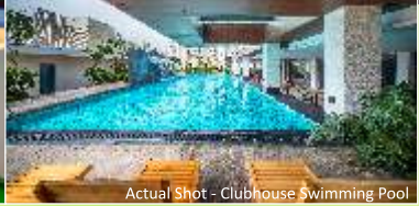
Actual Shot - Clubhouse Swimming Pool

Most distinct advantage of life at SNN Raj Serenity is the One Lakh Sft Clubhouse! Now with 25,000 Sft. being added to the Gardens Block, homeowners can enjoy many more activities... 1,25,000 Sft. Club Serenity, Biggest in Bangalore.