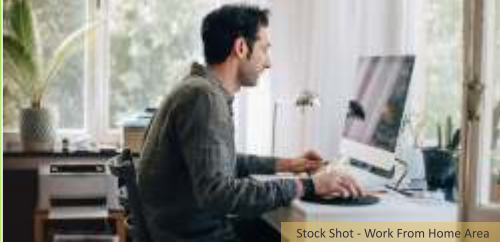
Stock Shot - Work From Home Area