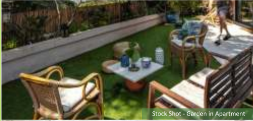
Stock Shot - Garden in Apartment