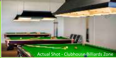
Actual Shot - Clubhouse Billiards Zone