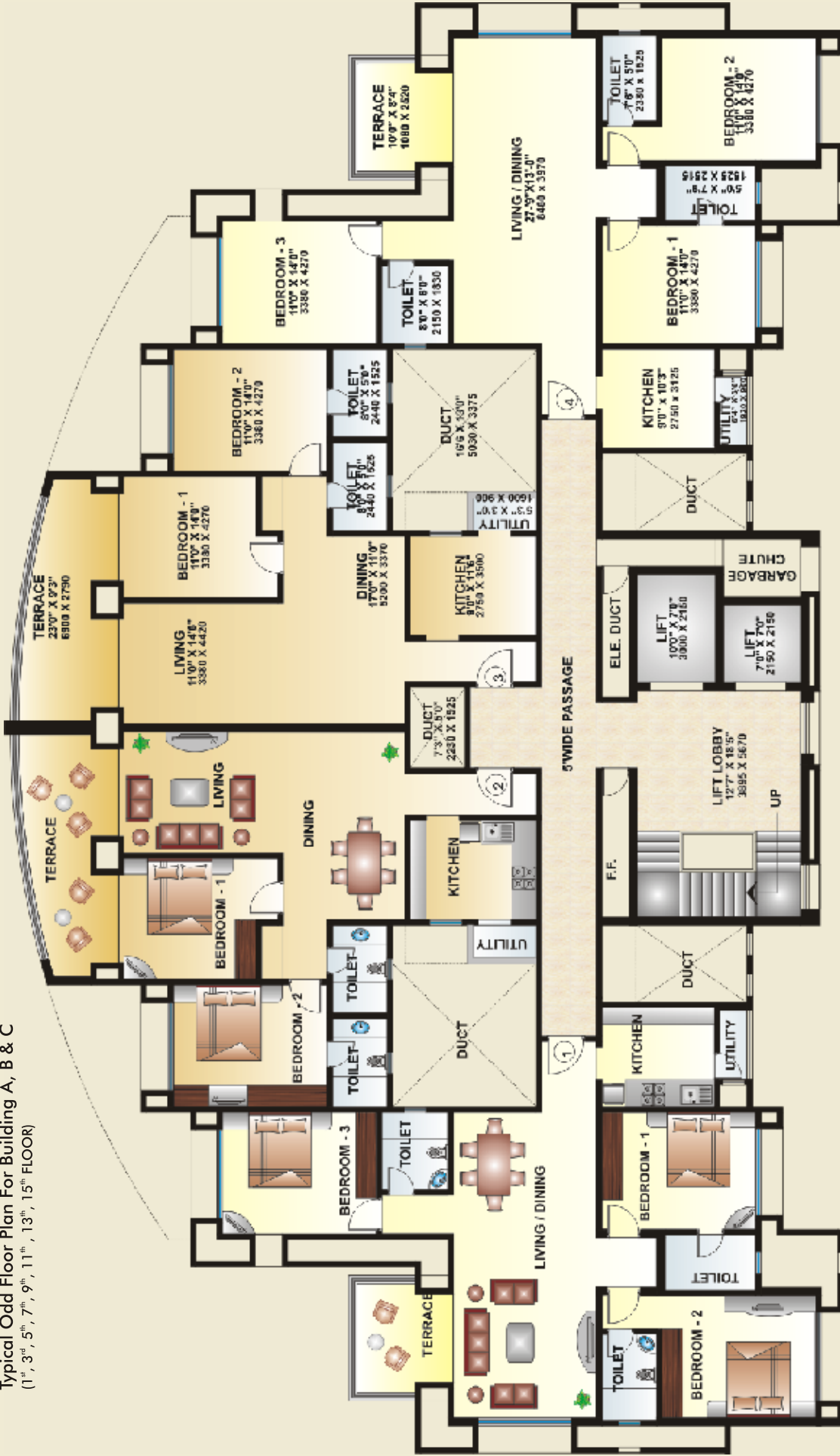
Typical Odd Floor Plan For Building A, B & C (1 st , 3 rd , 5 th , 7 th , 9 th , 11 th , 13 th , 15 th FLOOR)