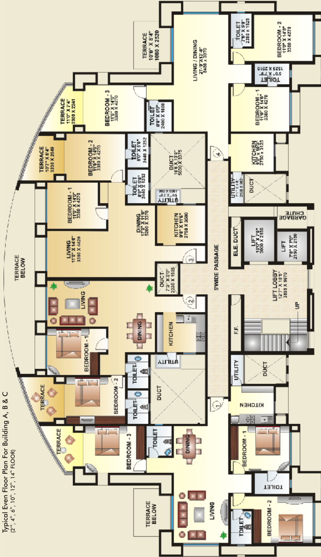
Typical Even Floor Plan For Building A, B & C (2 nd , 4 th , 6 th , 10 th , 12 th , 14 th FLOOR)