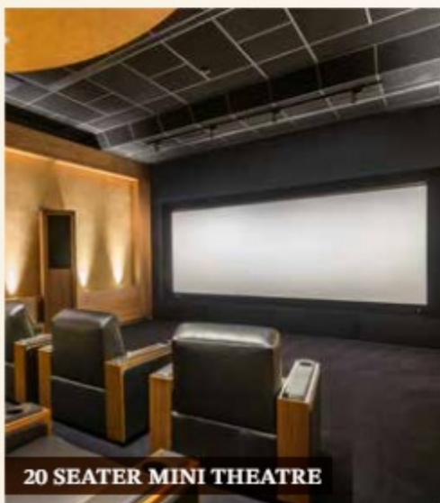
20 SEATER MINI THEATRE