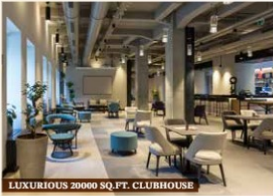
LUXURIOUS 20000 SQ.FT. CLUBHOUSE