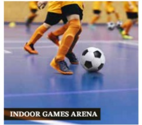
INDOOR GAMES ARENA