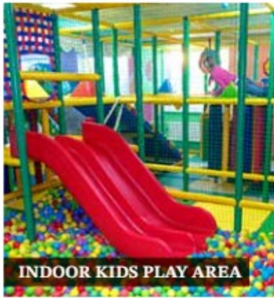
INDOOR KIDS PLAY AREA