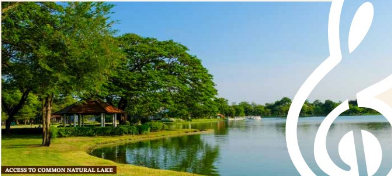
ACCESS TO COMMON NATURAL LAKE