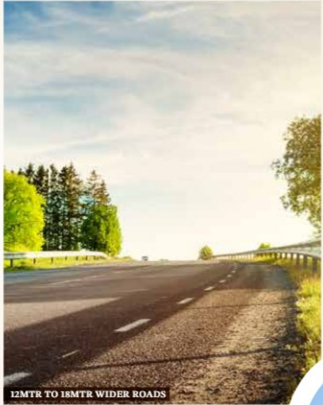
12MTR TO 18MTR WIDER ROADS