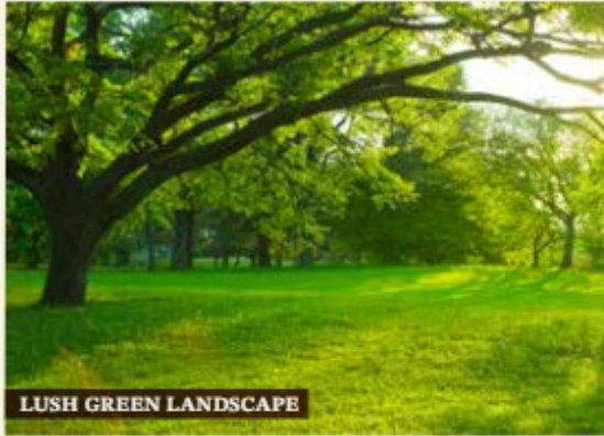
LUSH GREEN LANDSCAPE