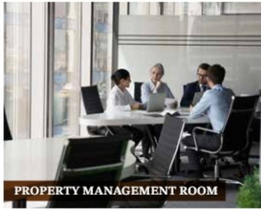
PROPERTY MANAGEMENT ROOM