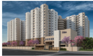
ASHRAYA Bengaluru-Mysuru Expressway Bidadi