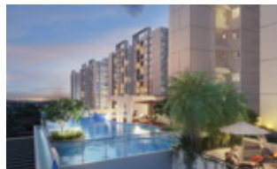
MISTY CHARM Off Kanakapura Main Road Bengaluru