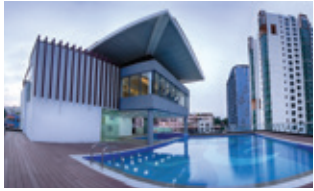
MAGNIFICIA Old Madras Road, Bengaluru