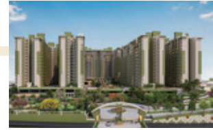
ANUGRAHA Vijayanagar Extension Bengaluru