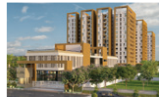
EXOTIC Bagalur Main Road, Bengaluru