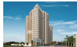
SIGNET Sarjapur Main Road, Bengaluru