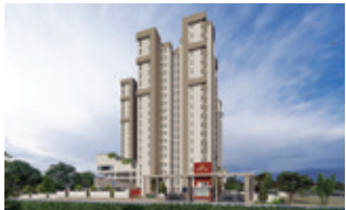
AQUA VISTA Bannerghatta Main Road Bengaluru