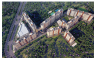
PARK CUBIX Devanahalli Town, Bengaluru