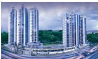
LUXURIA Malleswaram, Bengaluru