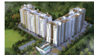
NAVARATNA RESIDENCY Avinashi Road, Coimbatore