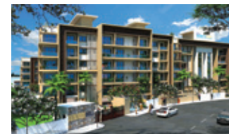
WATER'S EDGE Sancoale, Goa