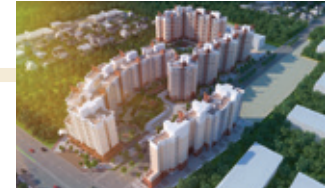
HM ROYAL Kondhwa (Opp. Talab factory) Pune