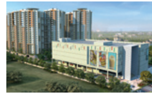
DIVINITY Mysore Road, Bengaluru