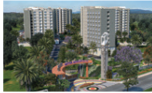
AEROPOLIS NH 44, Bengaluru