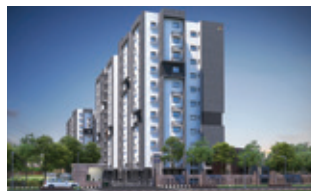
BLISS Off Budigere Road, Bengaluru