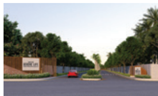
SERENE LIFE Shettigere, Bengaluru