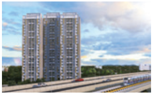
OPUS Tumkur Road, Bengaluru