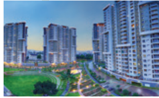
GREENAGE Hosur Main Road, Bengaluru