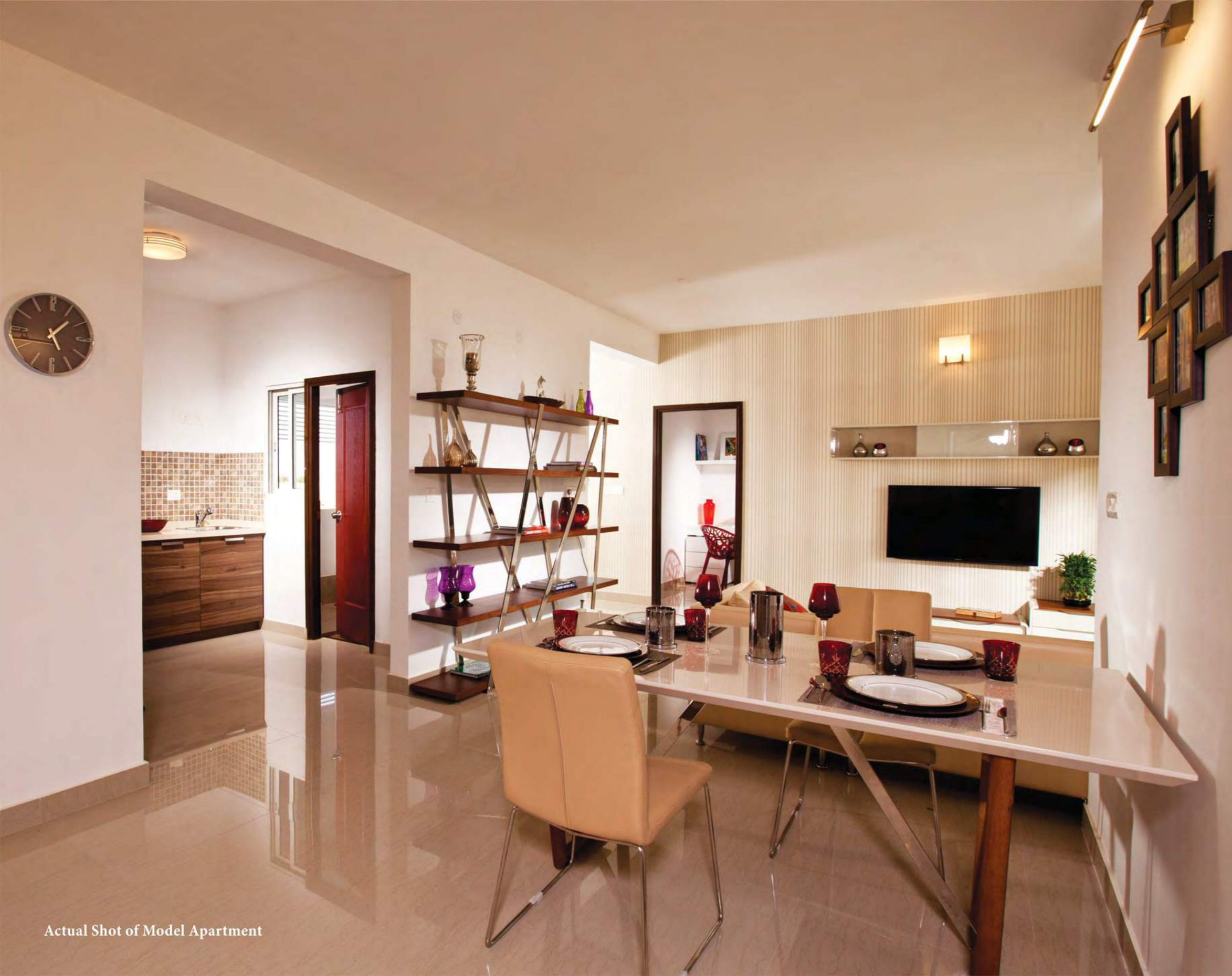
Actual Shot of Model Apartment