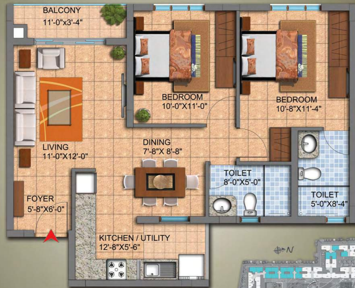
TYPE R - 2BHK SBA - 937 sft