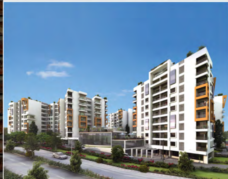
Fiesta HOMES fiestahomes.in