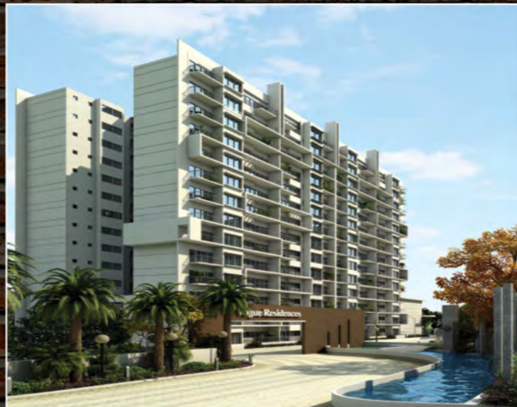
VOGUE RESIDENCES vogueresidences.in