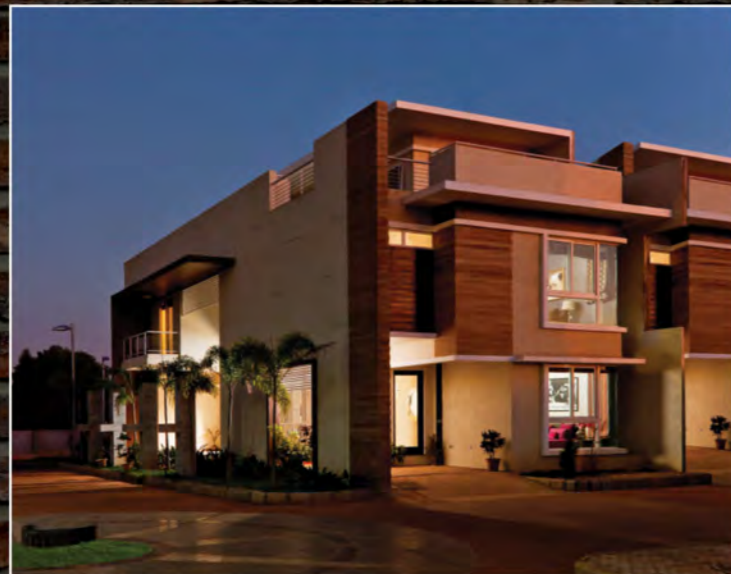
CRYSTAL COVE crystalcove.in