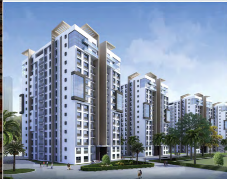
PARKWAY HOMES parkwayhomes.in