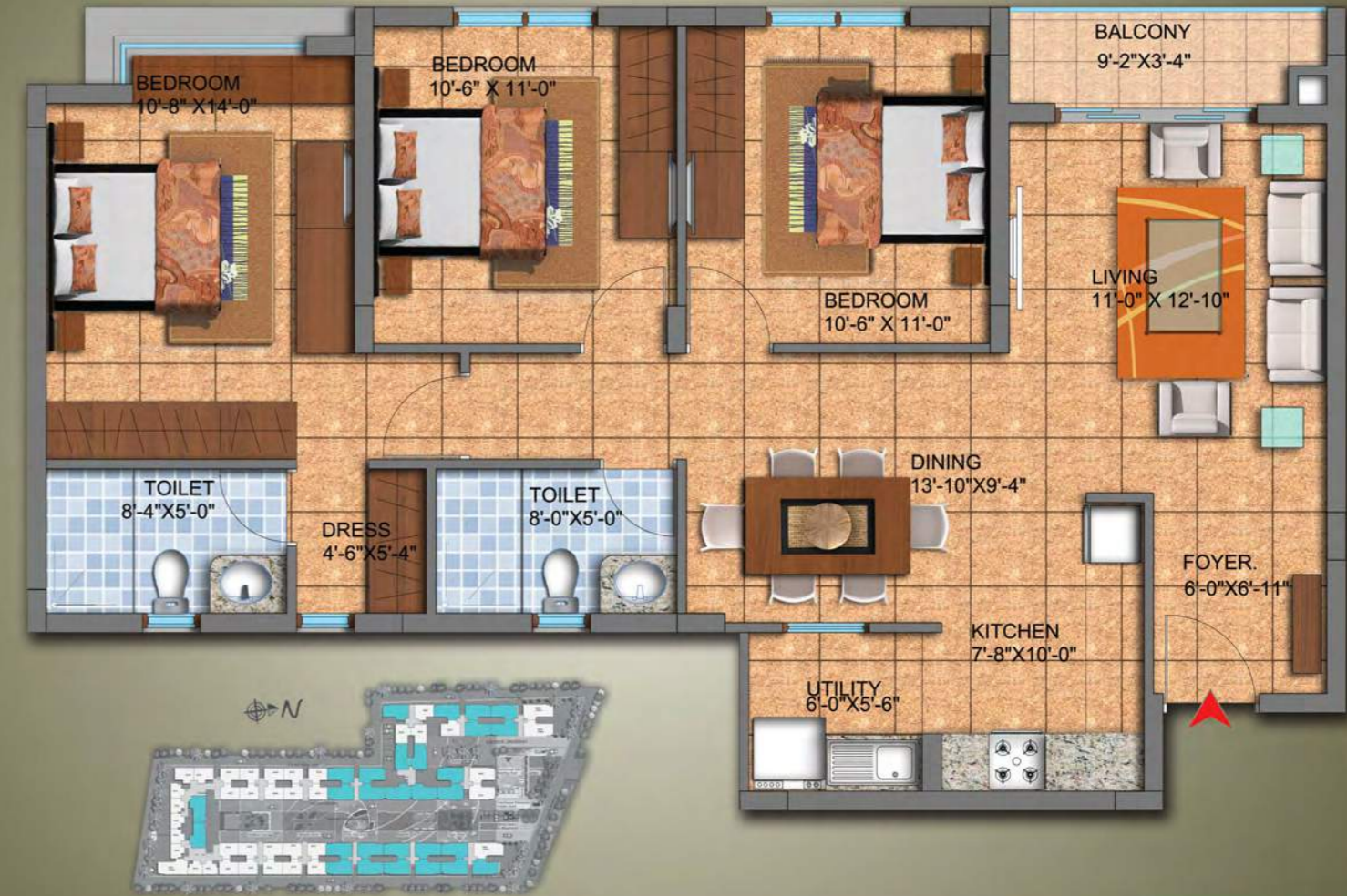
• TYPE Q - 3BHK SBA - 1229 sft •