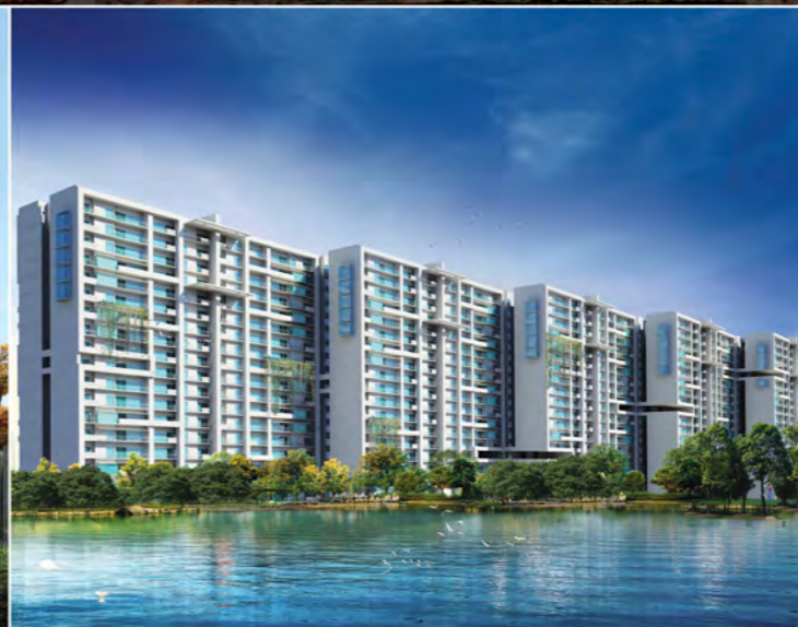
REGENT PARK regentpark.co.in