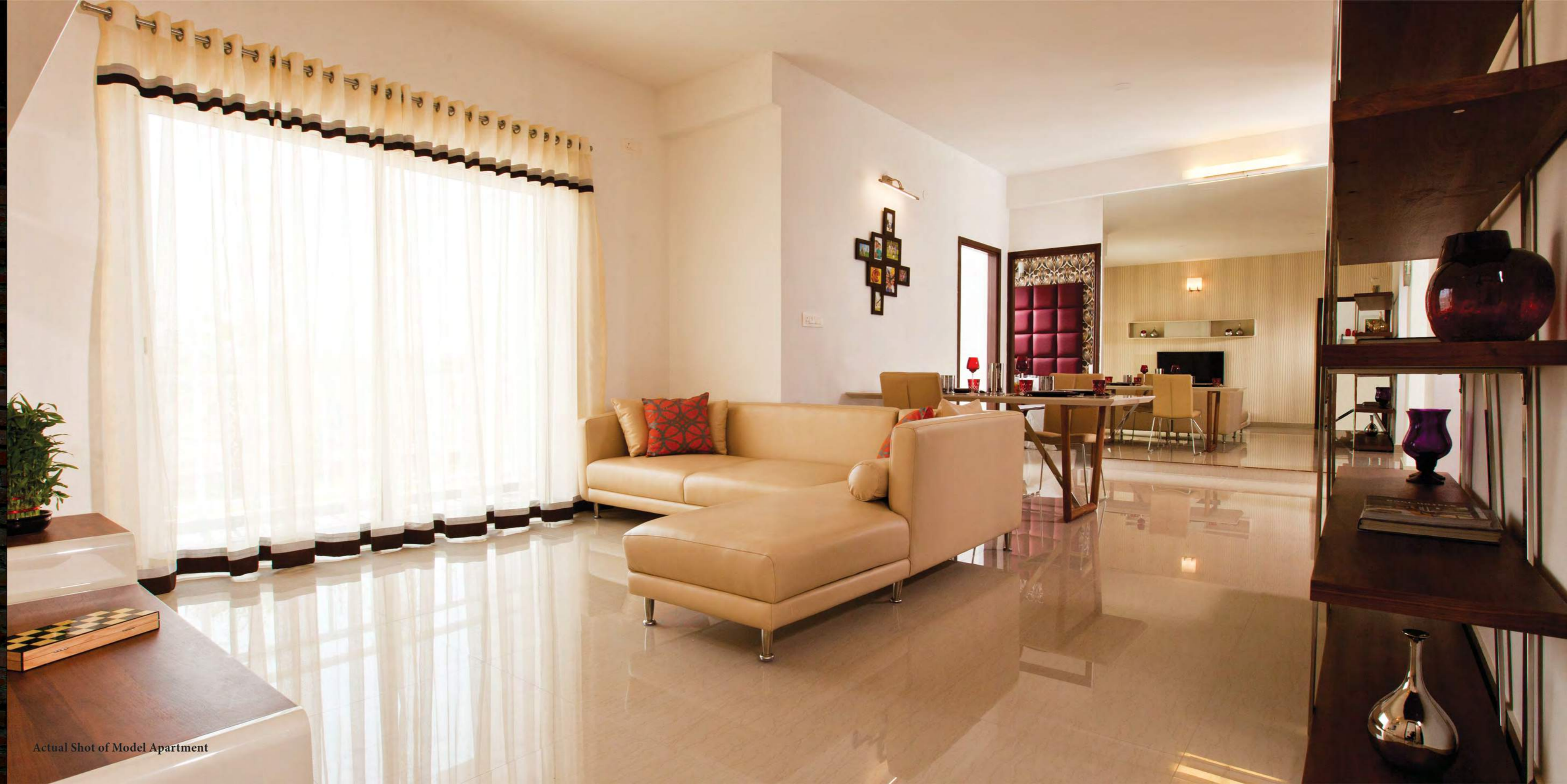
Actual Shot of Model Apartment

Aristocratic yet contemporary - this typifies the apartments at Hamilton Homes. Something that will surely be noticed by every guest who steps into your expansive, bright and airy living room.