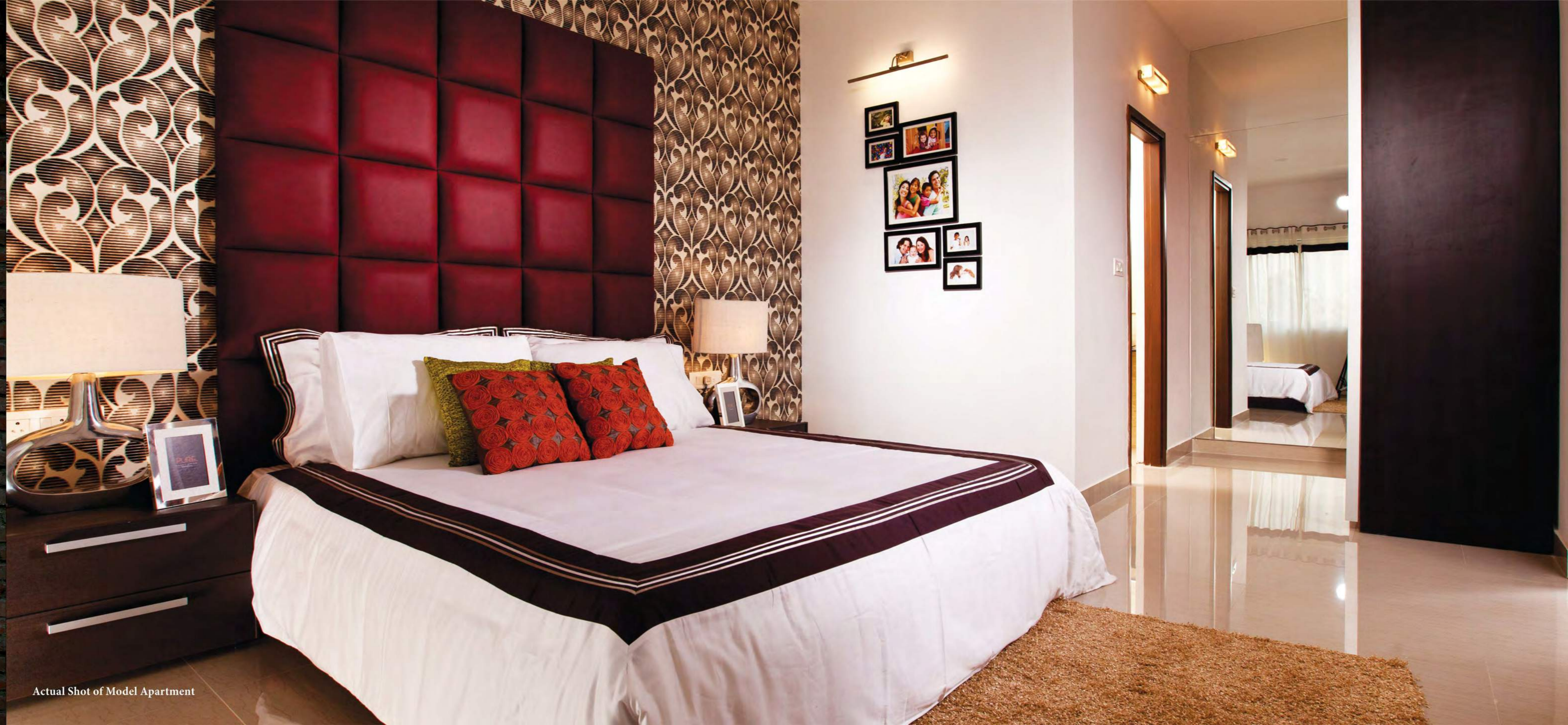
Actual Shot of Model Apartment

Layouts carefully optimised for privacy ensure that your bedrooms always remain private, discreetly removed from the rest of the home.