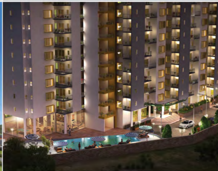
THE PAVILION OUTER RING ROAD pavilionhomes.in