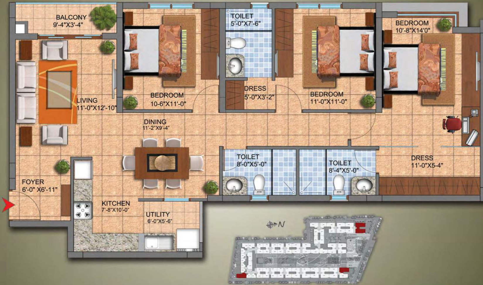
• TYPE P - 3BHK(L) SBA - 1400 sft •

As a discerning resident, you will surely appreciate the privacy you enjoy at Hamilton Homes. Every apartment has been carefully designed to ensure maximum freedom of movement and space. Combined with the abundance of natural light, it's the ideal setting to relax and spend time with family.