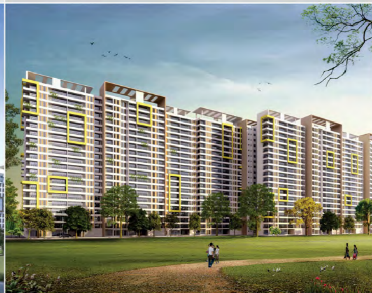
PALAZZA CITY palazzacity.in