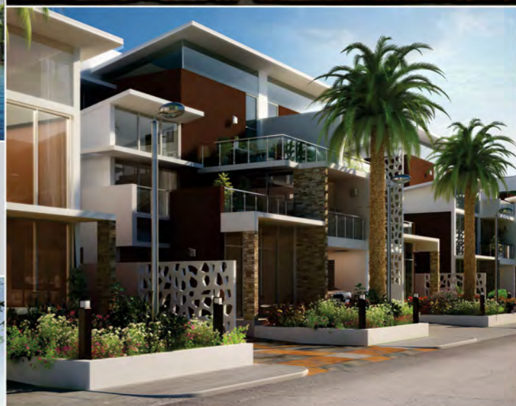
OFF SARJAPUR ROAD (Rayasandra) Contemporary Villas