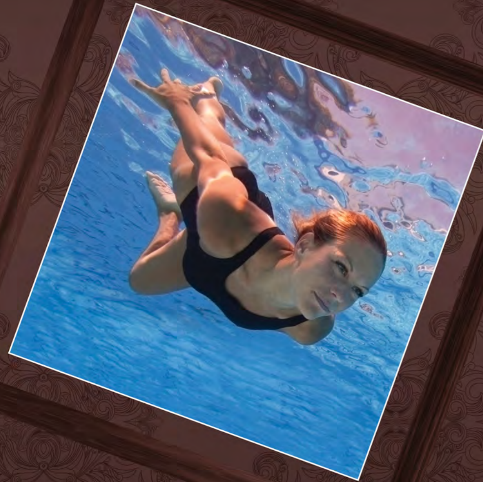
Rooftop Swimming Pool