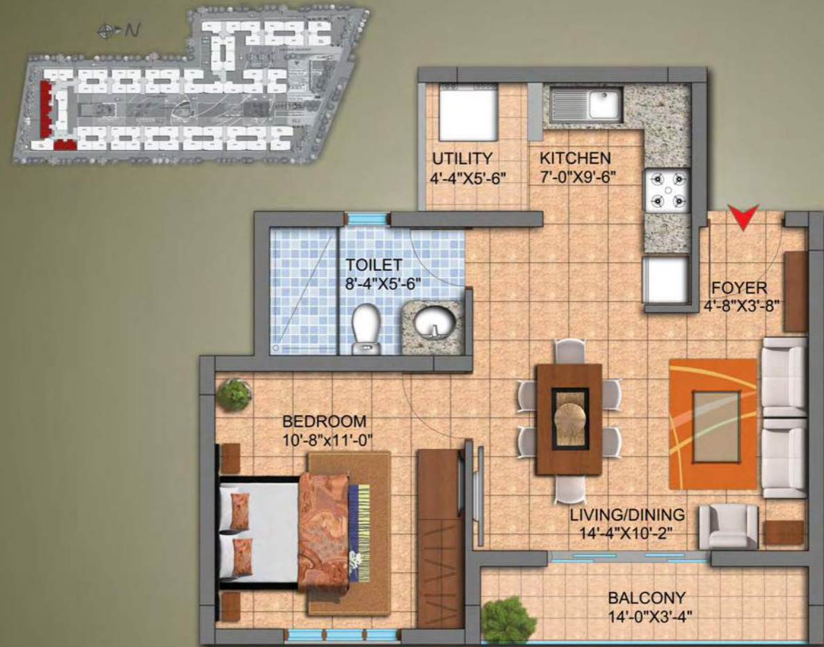
TYPE S - 1BHK SBA - 623 sft