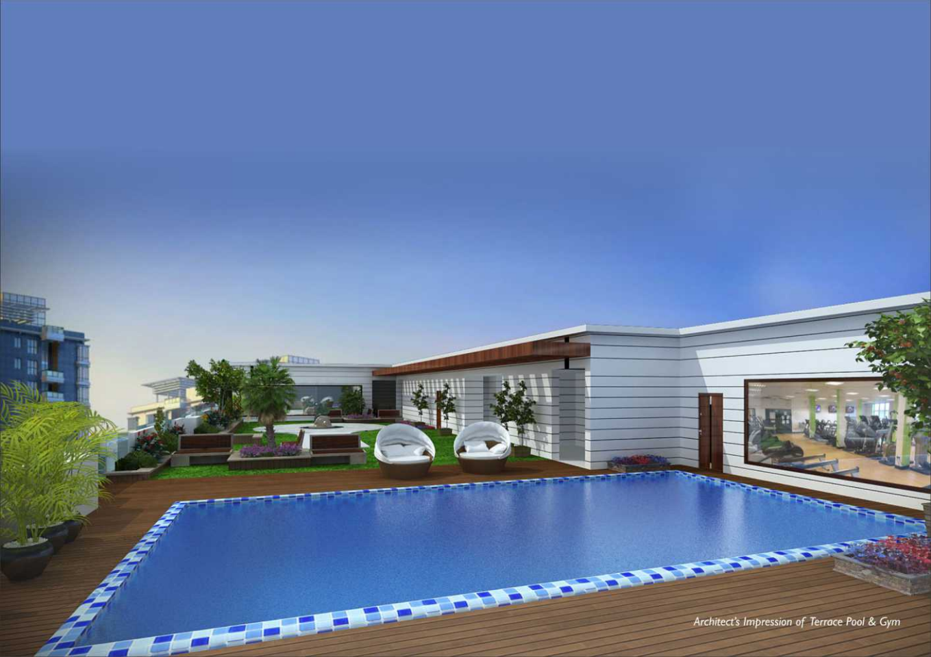
Architect's Impression of Terrace Pool & Gym