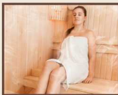
Sauna & Steam Bath