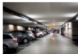
Adequate Parking Spaces