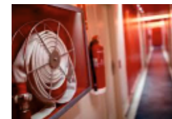
Fire Fighting & System