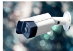
CCTV for Security