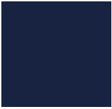
Artist's Impression for reference purpose only