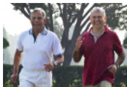
Senior Citizen Corner