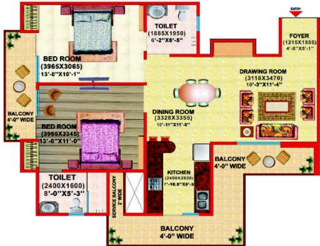
TYPICAL FLOOR PLAN Saleable Area : 1246.00 sq.ft. (115.75 sq.mt.)