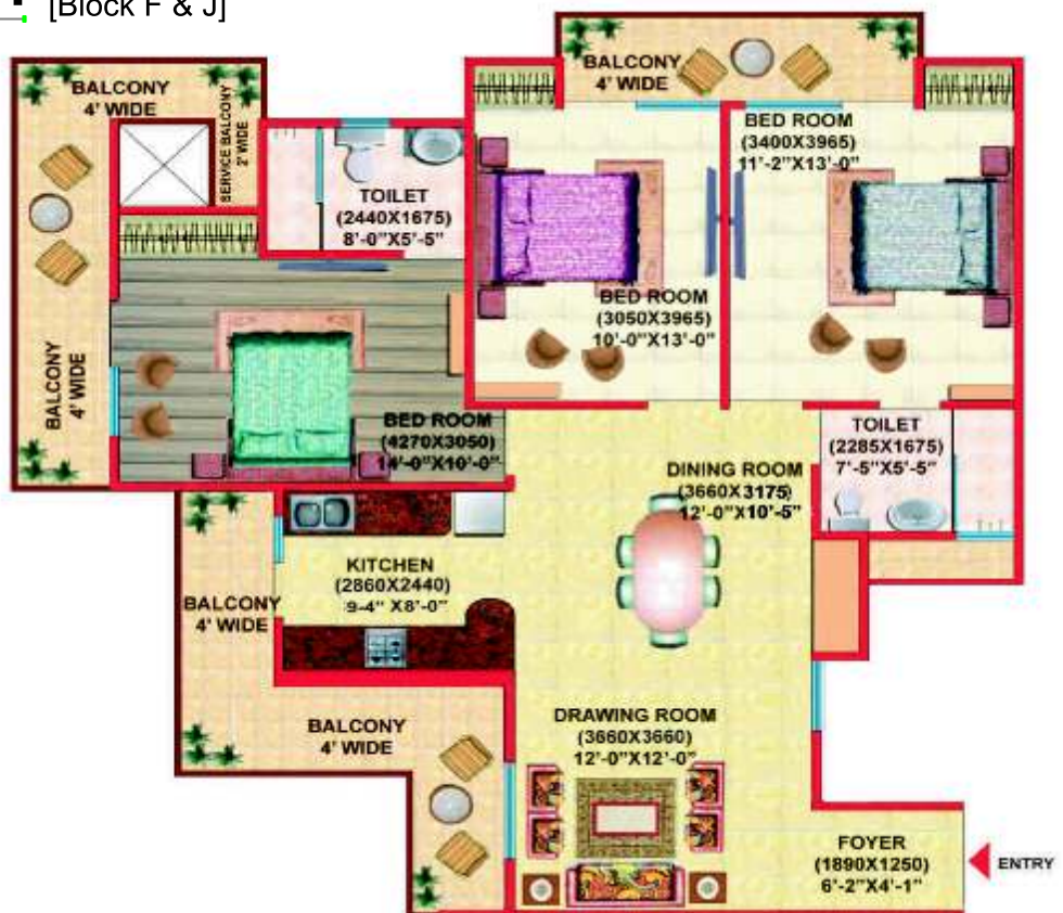
TYPICAL FLOOR PLAN Saleable Area : 1625.00 sq.ft. (150.96 sq.mt.)

Disclaimer : The areas and plans shown here are subject to change 1 sq.ft.=0.09290304 sq.mt. 10.764 sq.ft.=1 sq.mt. = 1.196 sq.yd. and 3.28 ft.=1 mt.