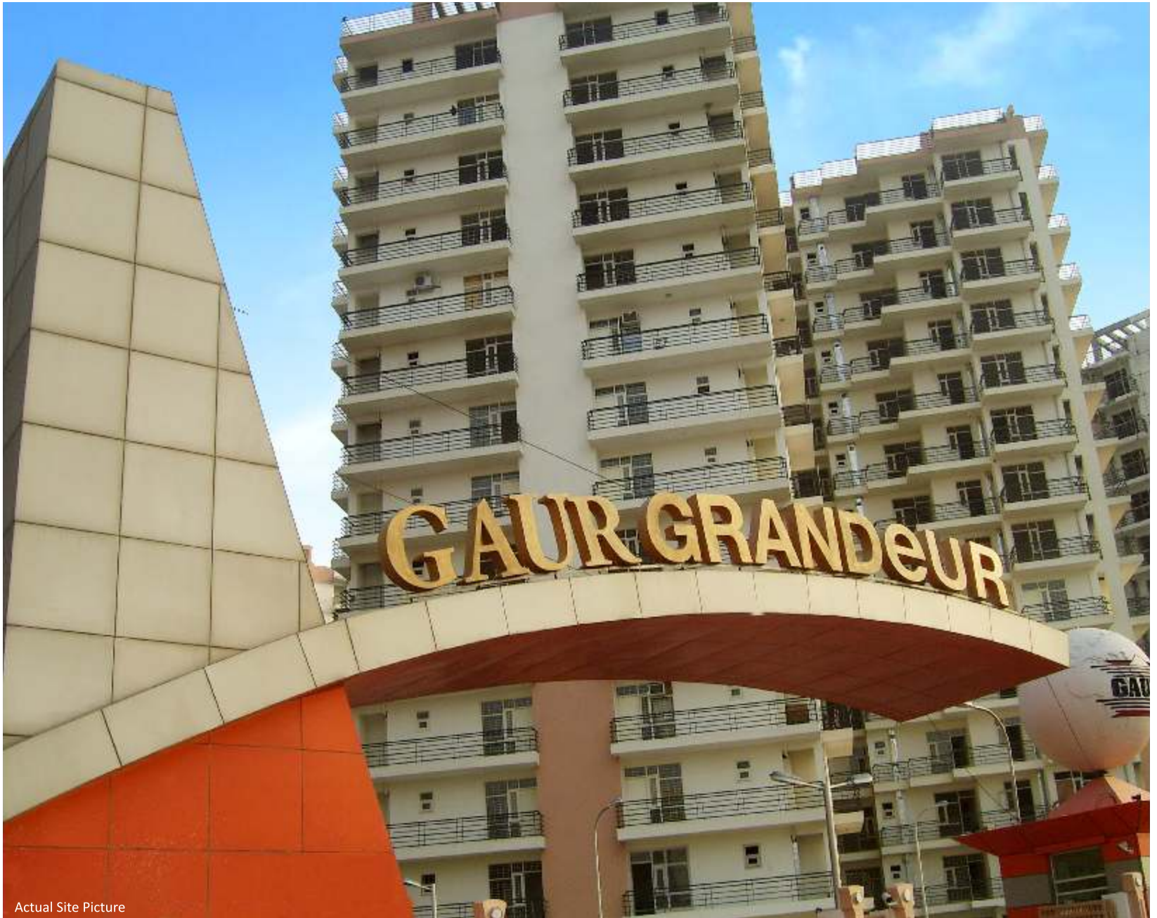
Actual Site Picture

GAUR GRANDeur SECTOR - 119 • NOIDA apartments. simply beautiful