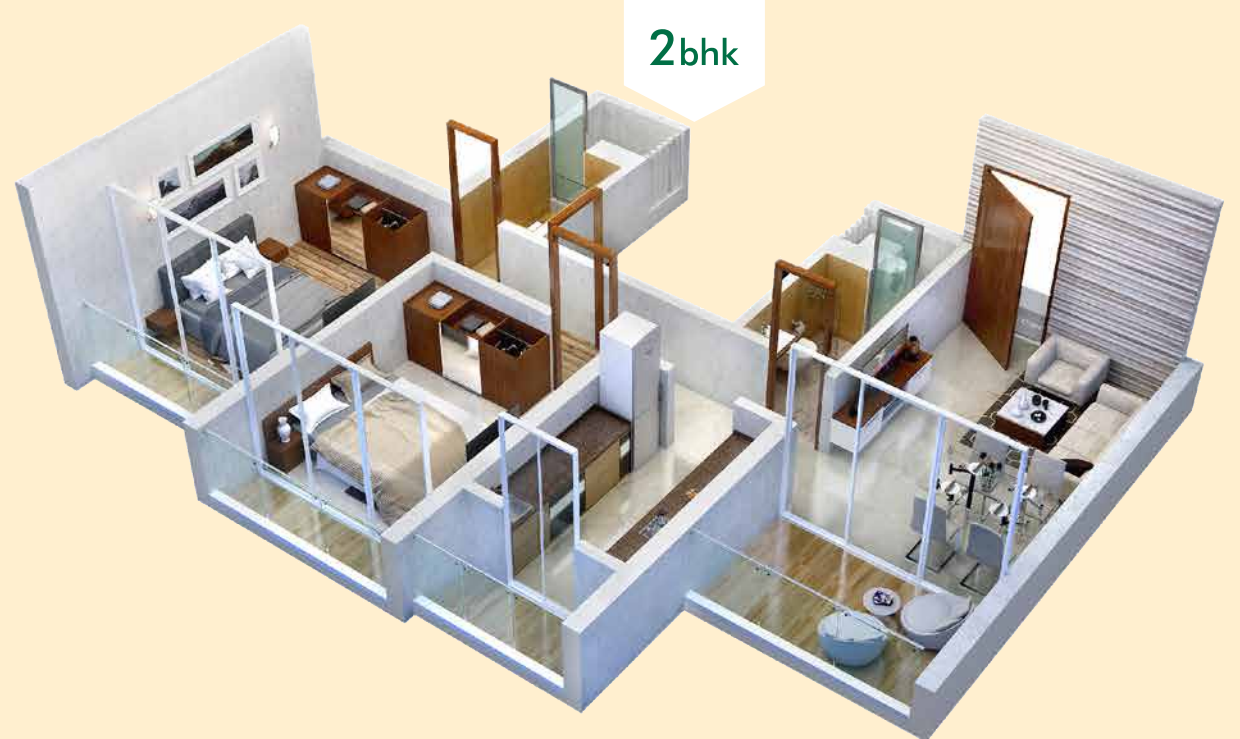
FLAT NO : 03 & 04

Disclaimer: The unit plan shown is indicative & tentative, and subject to modification on account of any changes in plans, permission & final approval of the respective appropriate authorities. Unit plan is for marketing purpose and to be used for reference purpose only, unit plan is intended to give a general indication of the proposed unit layout.