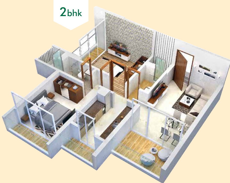
FLAT NO : 01