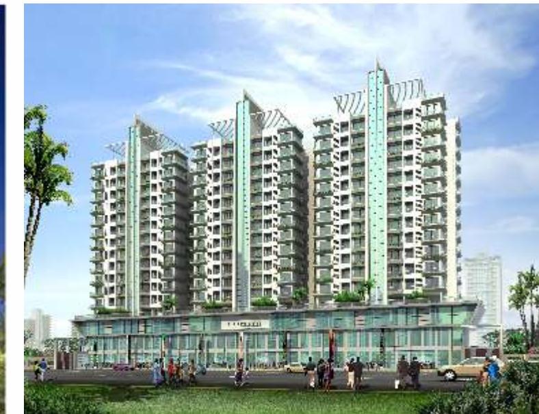
MANGAL MURTI, BLDG. NO. 120, KURLA (E)