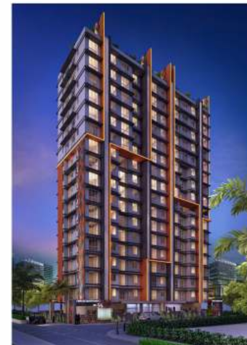
SAMRUDDHI ELEGANCE, BLDG. NO. 54, KURLA (E)