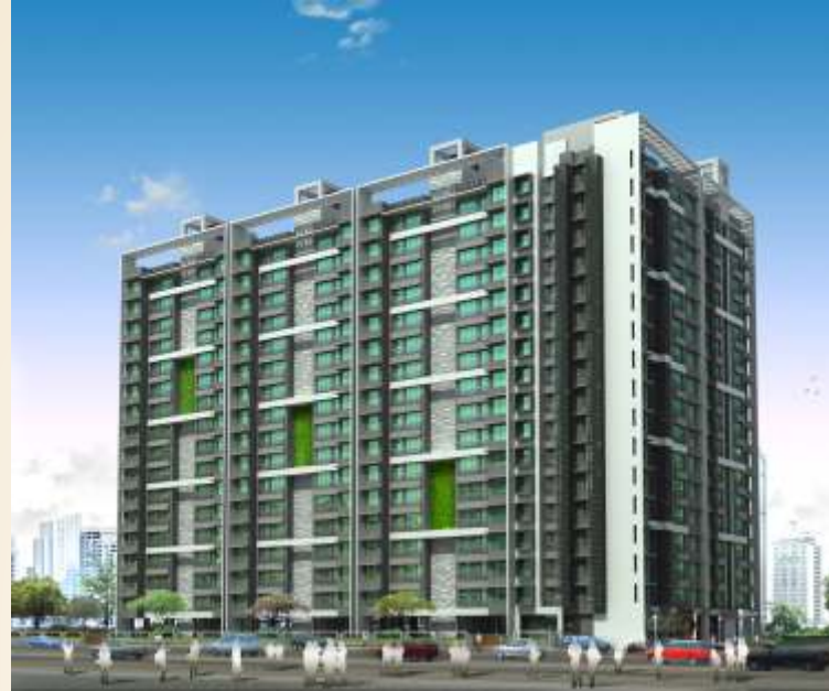
SKY VIEW CASTLE redefining life style... Kurla East