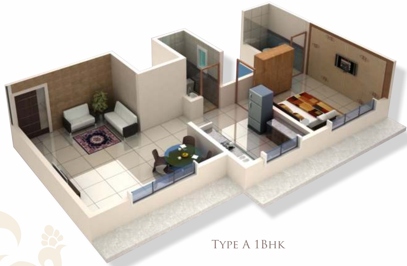
TYPE A 1BHK