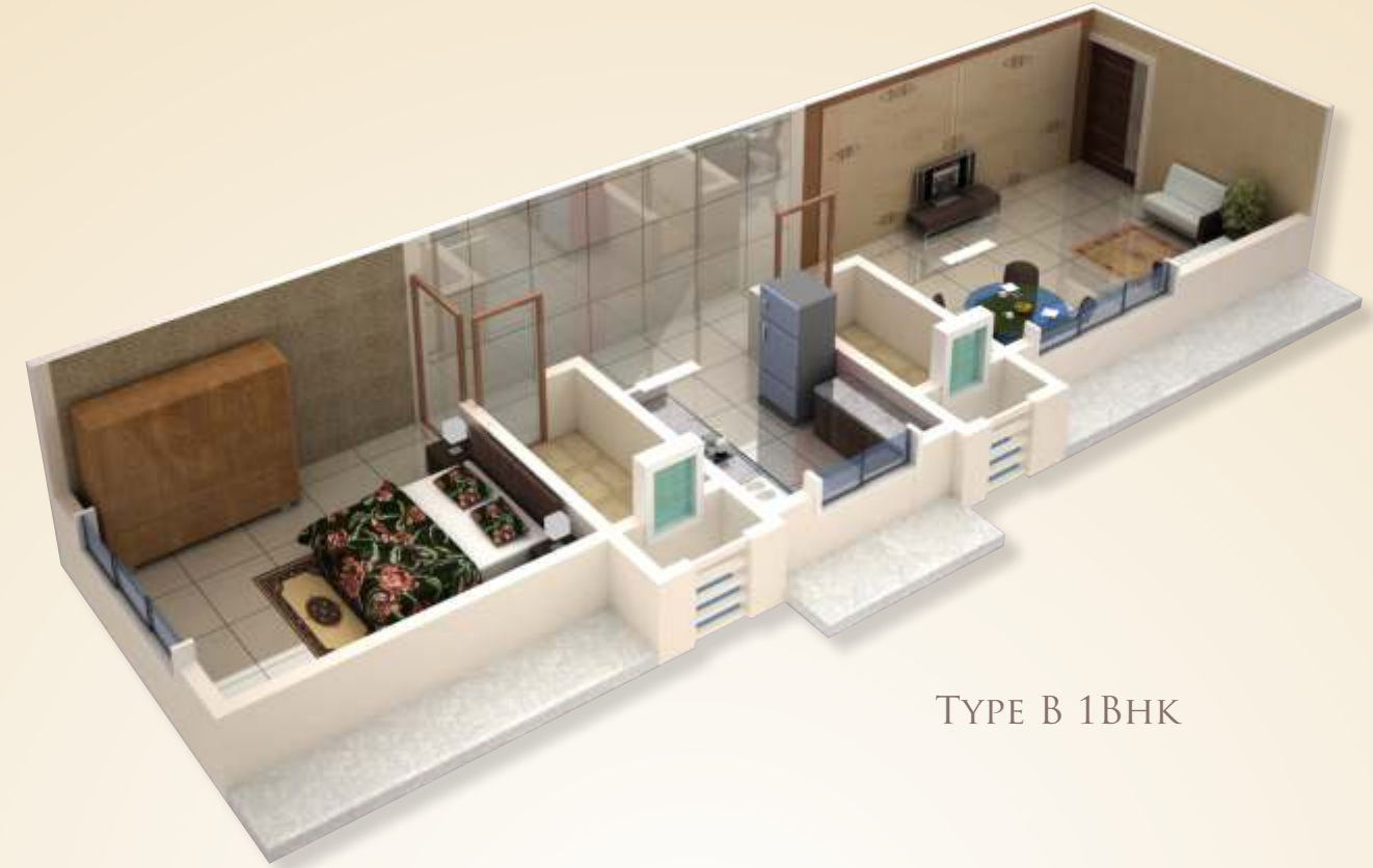
TYPE B 1BHK