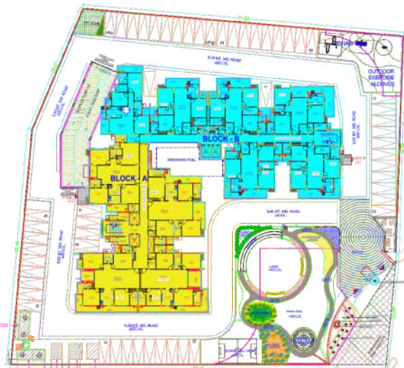
SITE PLAN TYPICAL FLOOR PLAN PRESENTATION DRAWING