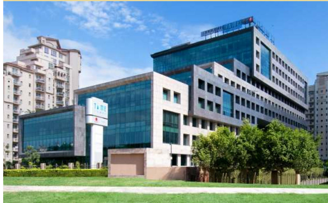
Time Tower, Gurgaon 7 Star Office Complex