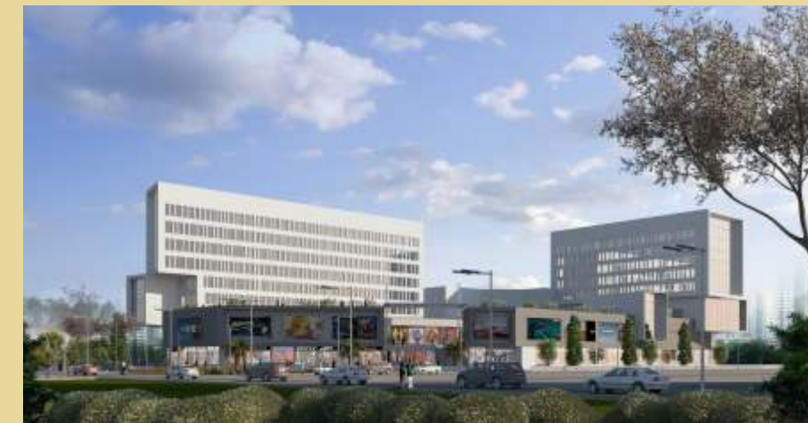
Time Arcade, Sector 37C, Gurgaon Office Complex and Shopping