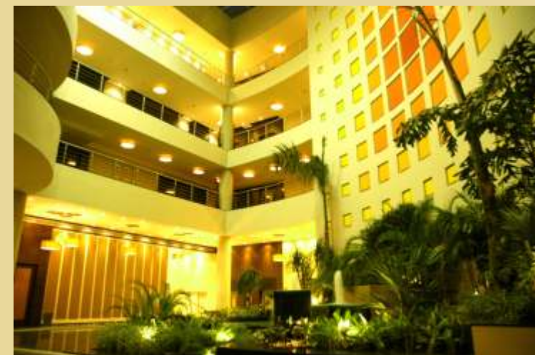
The Spring Club, Kolkata Finest Club of Kolkata