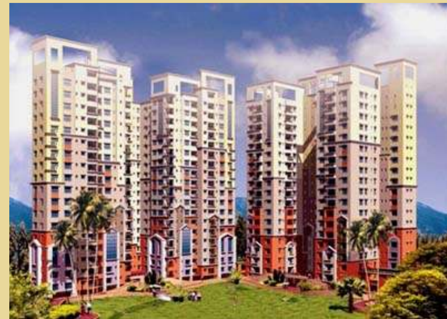
Silver Spring, Kolkata 540 high end luxury lifestyle apartments