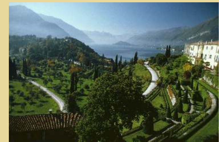
Resort at Dhamdama, Gurgaon 100 acres of pure nature