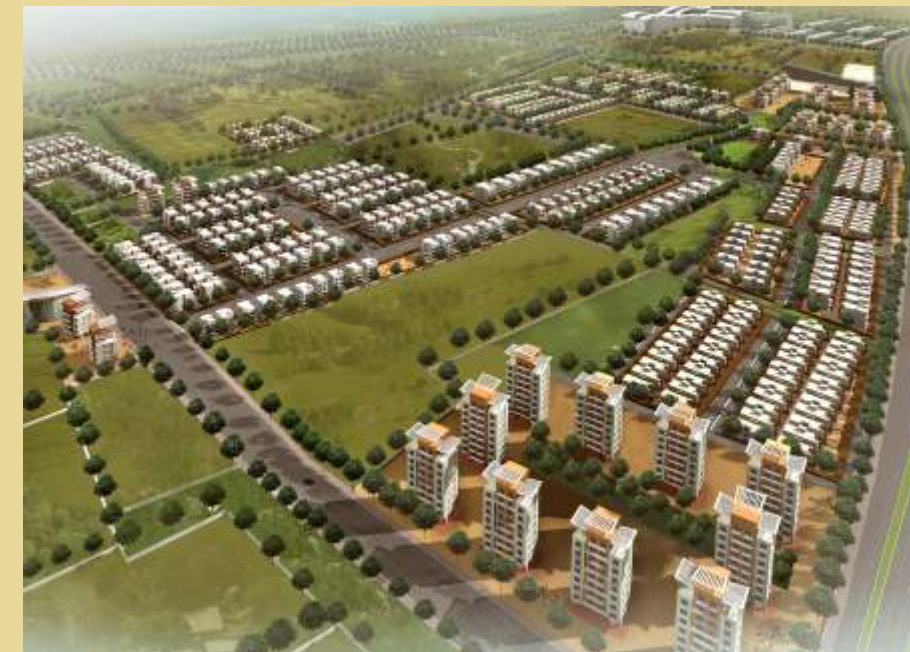
Vistara, Indore Modern integrated township