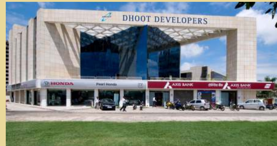
Time Centre, Gurgaon Office Complex and Shopping