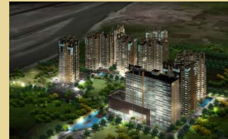
Olympia Opaline, Chennai 1000 apartments in a modern self sufficient township