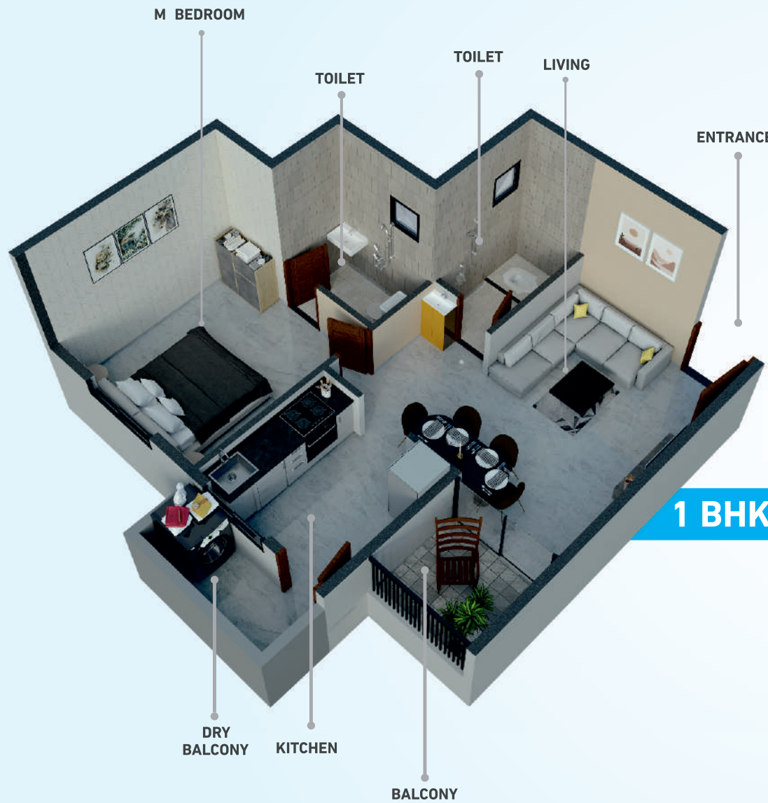
1 BHK View