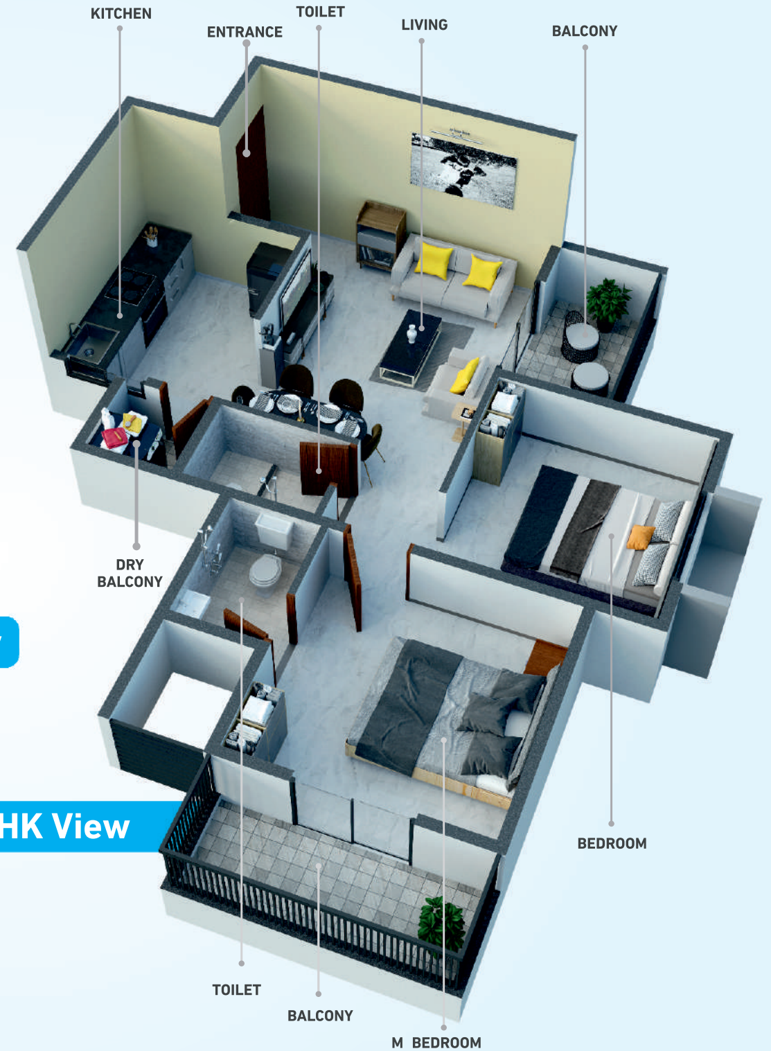
2 BHK View