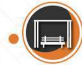
26. TRELIS WITH SEATER