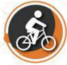
13. CYCLE TRACK