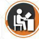
16. MINI LIBRARY