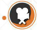
2. MINI AMPHITHEATER