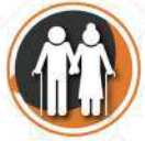
11. ELDER ZONE