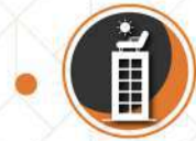
24. SKY RELAXATION LOUNGE