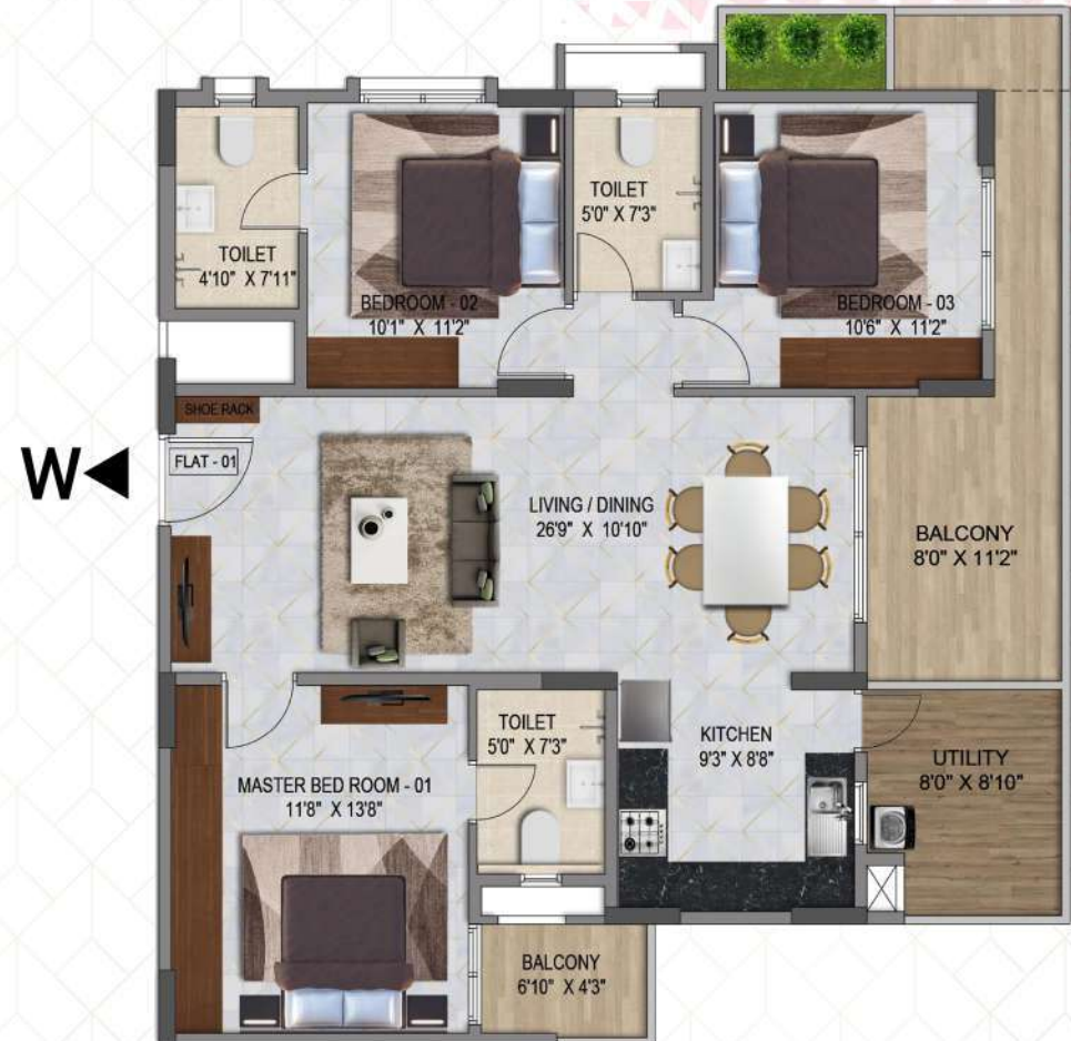
FLAT 1 VERSION 2 1655SFT | 3BHK Odd Floors