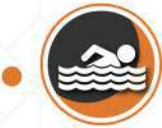
19. ADULT SWIMMING POOL