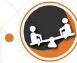
4. CHILDRENS PLAY AREA