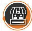
23. FOOD COURT