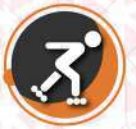
9. SKATING RINK