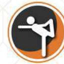
25. SKY YOGA