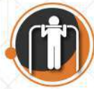
3. OUTDOOR GYM