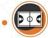
1. MULTI PURPOSE COURT