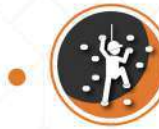
5. WALL CLIMBING FOR KIDS