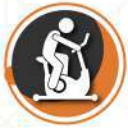
10. INDOOR GYM