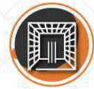
6. CRICKET NET