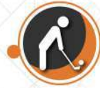
15. MINI GOLF COURT