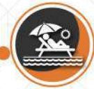
21. POOLDECK SEATER