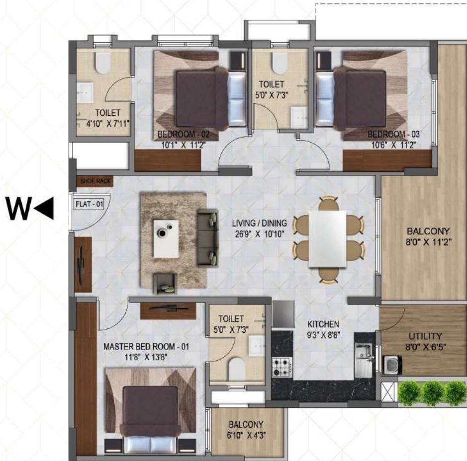
FLAT 1 VERSION 1 1597SFT | 3BHK Even Floors