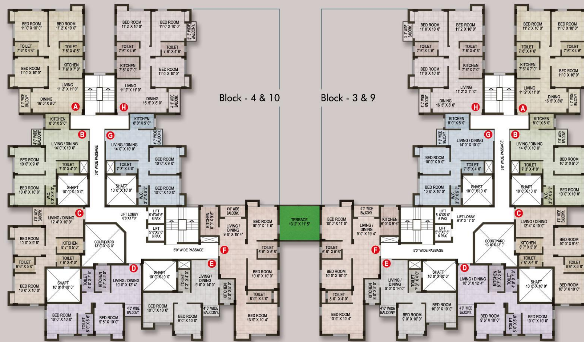
Typical Floor Plan - Block 3/4/9 & 10