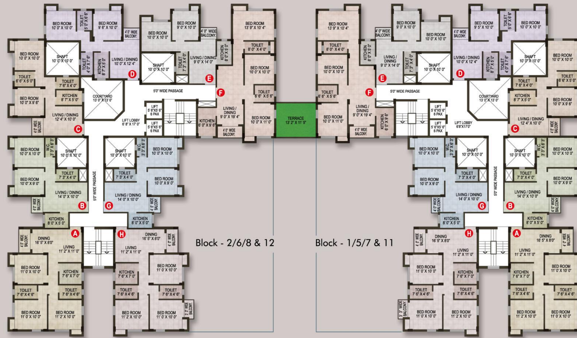
Typical Floor Plan - Block 1/2/5/6/7/8/11 & 12