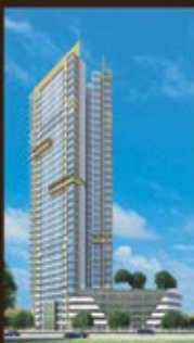
Maple View Malad