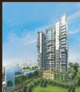
Upcoming Project in Bandra