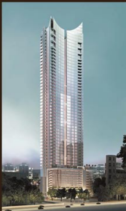
Ahuja Towers Worli