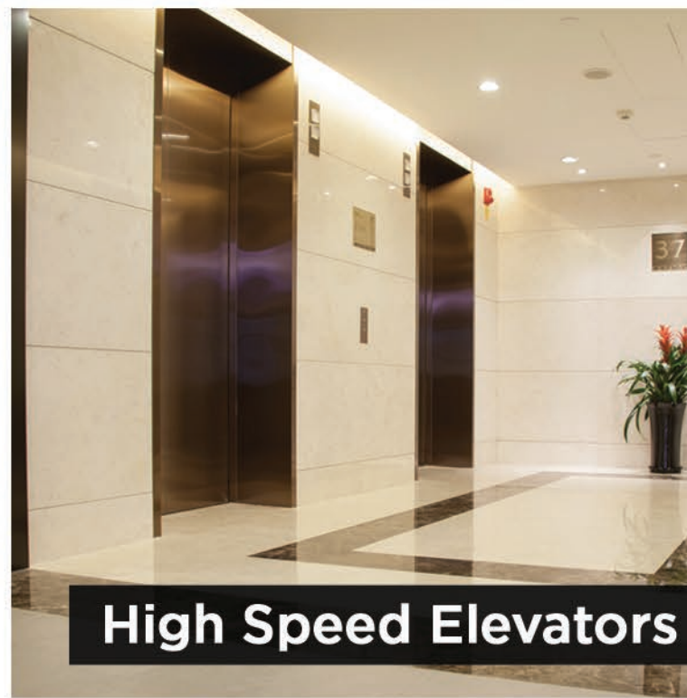
High Speed Elevators