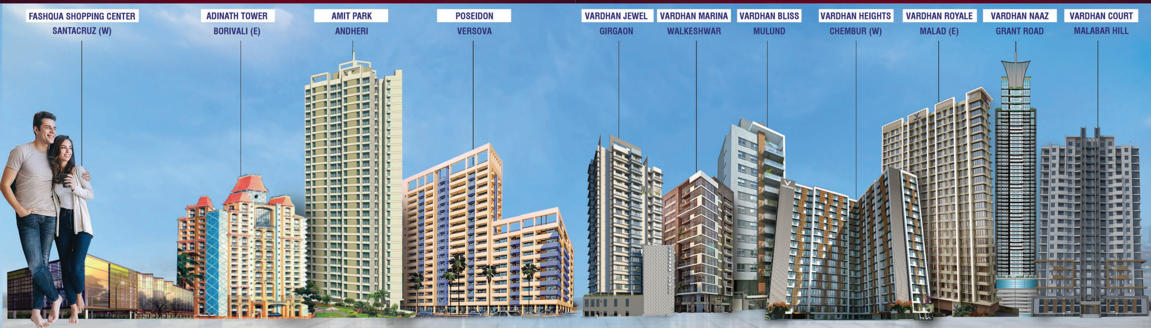
FASHQUA SHOPPING CENTER SANTACRUZ (W)