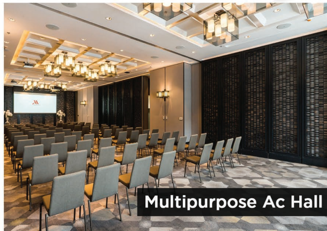
Multipurpose Ac Hall