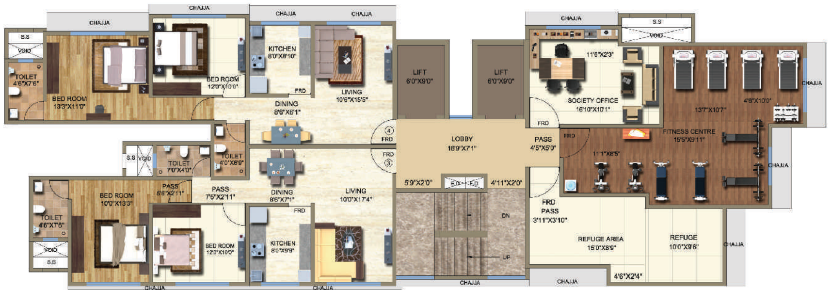
7th Floor Plan