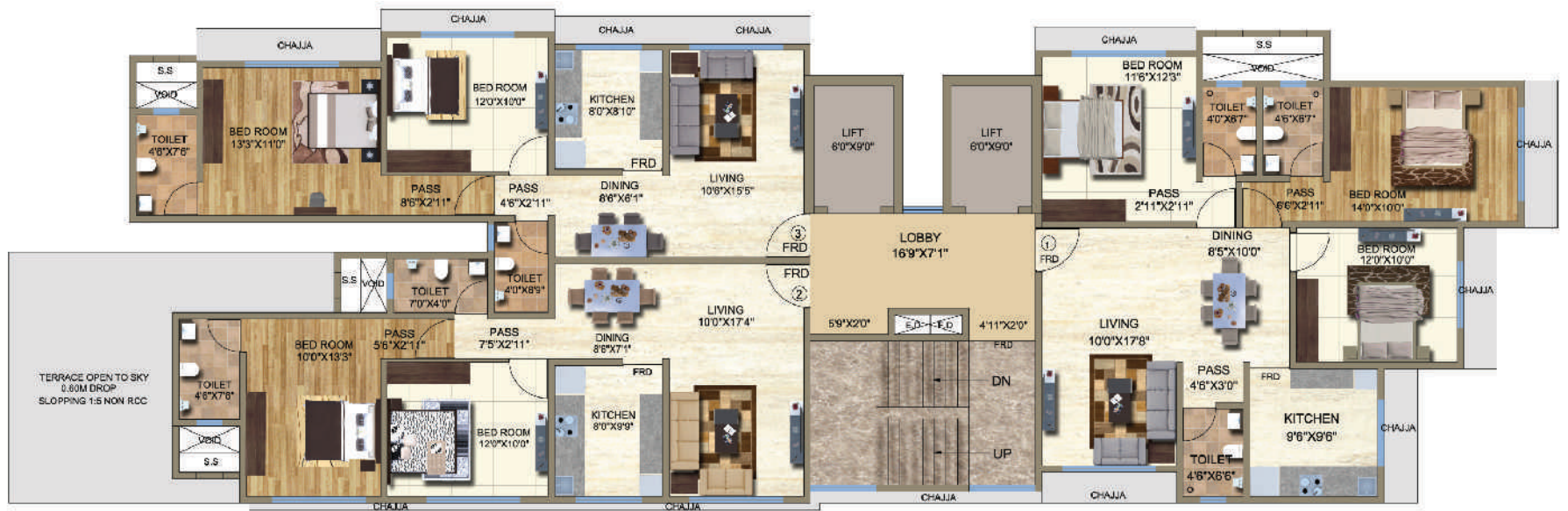
1st to 6th & 8th to 9th Floor Plan