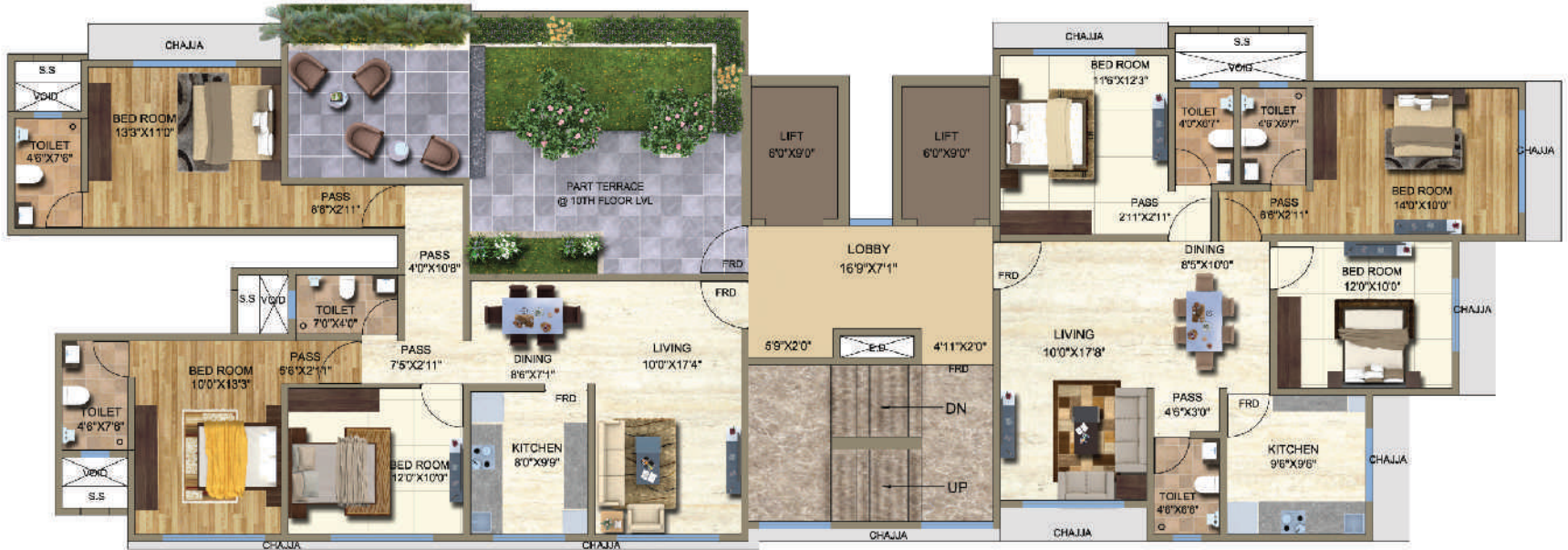
10th Floor Plan