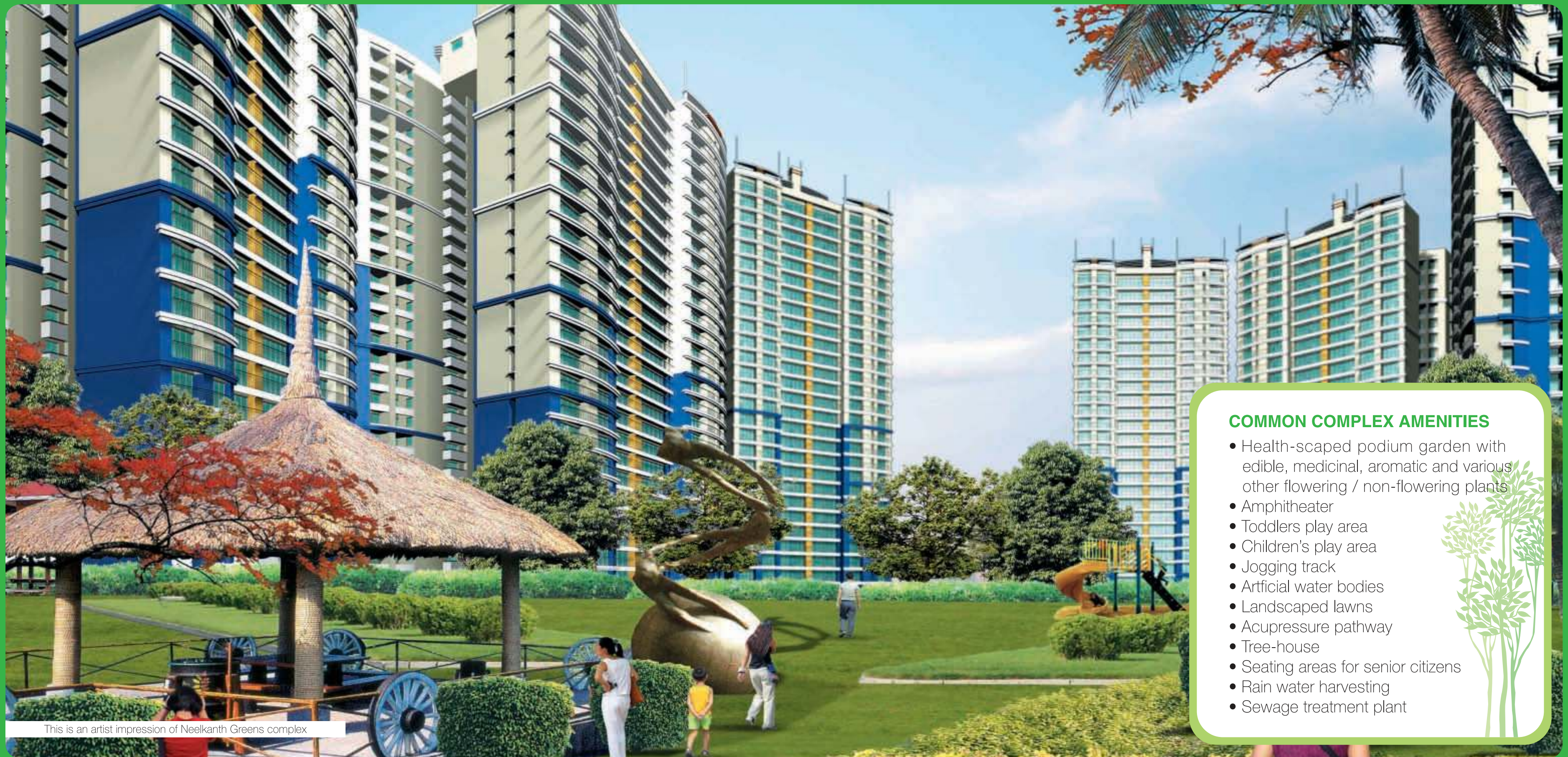
This is an artist impression of Neelkanth Greens complex