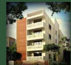
Ideal home for peace lovers of old Bangalore. HSR layout, Bangalore.