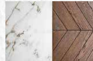
ITALIAN MARBLE/ WOODEN FLOORING