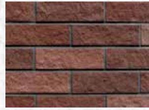
UNFIRED CLAY CLADDING