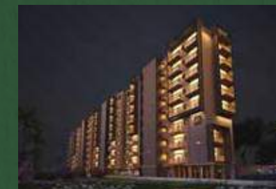
Affordable Luxury Apartments Dommasandra Circle Sarjapur Road, Bangalore.