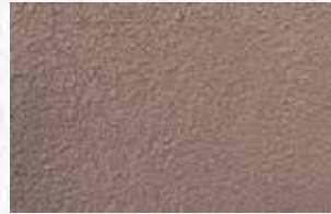
WALNUT OAK TEXTURED PAINT