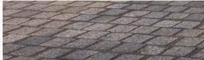
GRANITE STONE PAVED ROADS