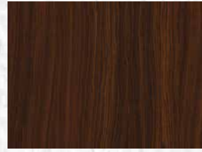
LAMINATED UPVC DARK WALNUT