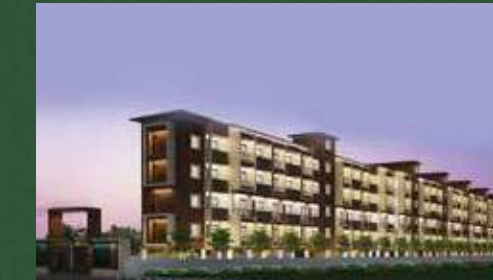
Affordable Luxury Apartments Dommasandra Circle Sarjapur Road, Bangalore.