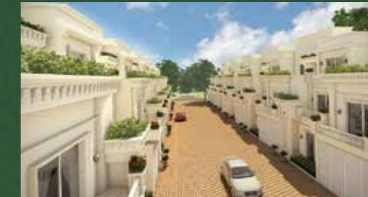
46 State Of The Art Roman Style Row Houses. Sarjapur Road, Bangalore.