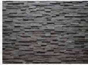
BLACK STACKED STONE CLADDING