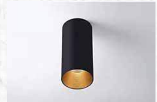
CYLINDRICAL CEILING LIGHTS