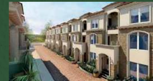
Resort Living Of 44 Premium villas spread over 2 acres of pure indulgence. Sarjapur Road, Bangalore.