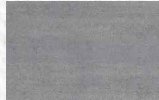
GREY COLOUR TEXTURED PAINT