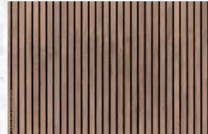
FLUTED PANEL WALNUT OAK