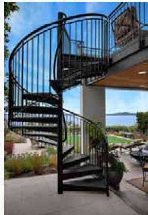
MS SPRIAL STAIRCASE