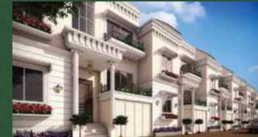
Stroll into Marble Arch for a glimpse of the English way of life. Sarjapur Road, Bangalore.