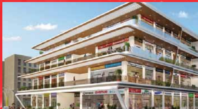
GALLERIA COMMERCIAL & LIFESTYLE MIDC, Dombivli (E), District - Thane