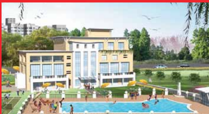
SPRINGTIME CLUB K.D.M.C. Road, Khadakpada, Kalyan