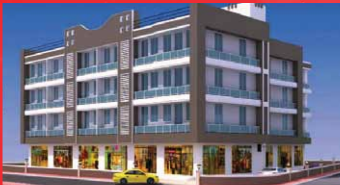
SOLITAIRE INDUSTRIAL ESTATE MIDC, Dombivli (E), District - Thane

From industrial & commercial to community living & residential, our stars have brightened the lives of many.