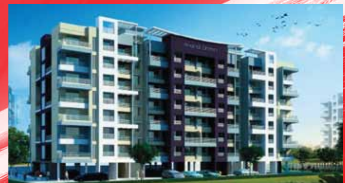
ANAND GREEN Near Mumbai University, Kalyan (W)