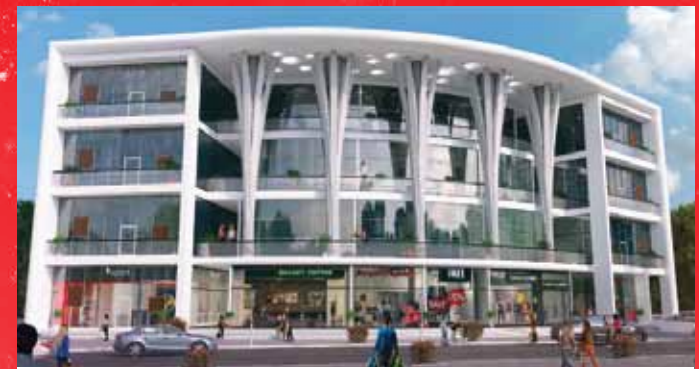
ARCADIA COMMERCIAL & LIFESTYLE MIDC, Dombivli (E), District - Thane