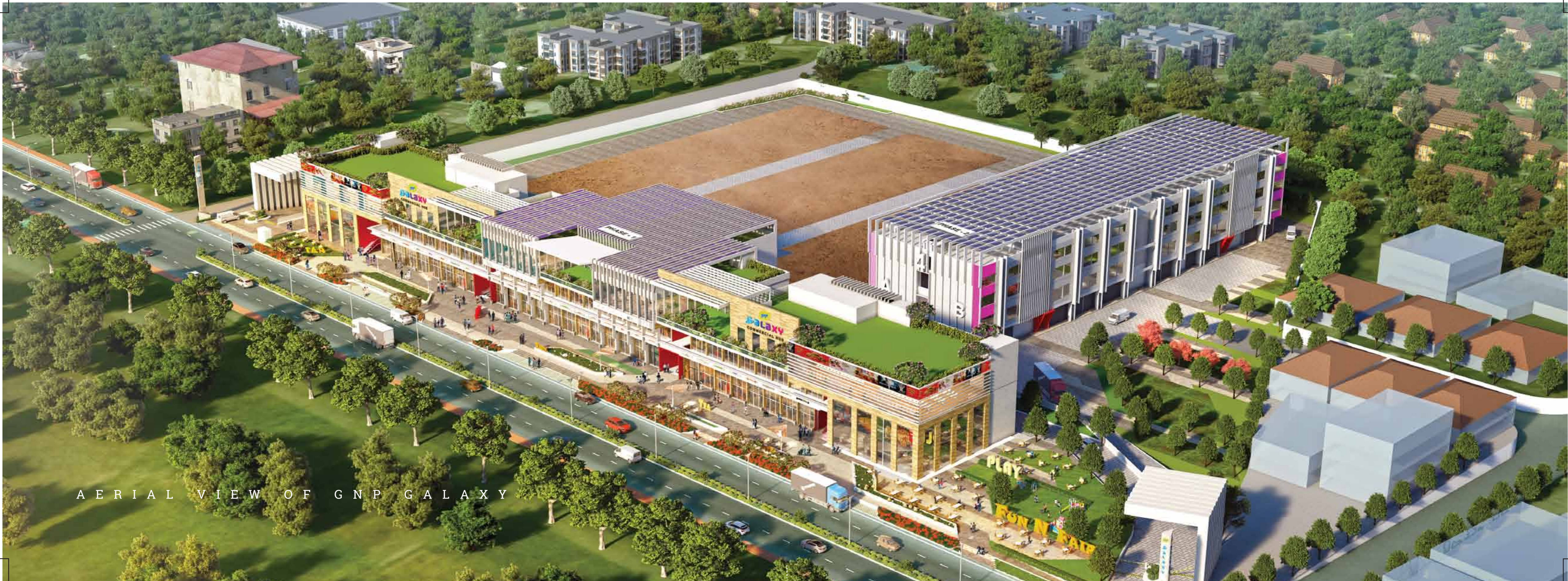
AERIAL VIEW OF GNP GALAXY