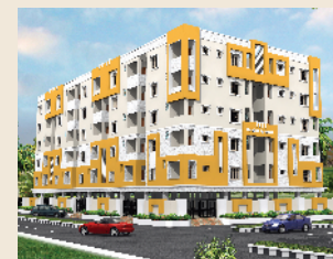
Whitefield Apartments Whitefield Lay-out, NRI Medical College Backside, Mangalagiri