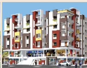
Whitefield Classic Apartments Whitefield Lay-out, NRI Medical College Backside, Mangalagiri