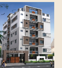
Grandeur Apartments 1/4 Vidyanagar Guntur