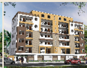
Whitefield Residency Apartments Whitefield Lay-out, NRI Medical College Backside, Mangalagiri