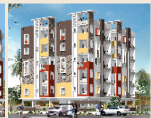
Ashoka Empire Apartments 4/4 Ashok Nagar Guntur