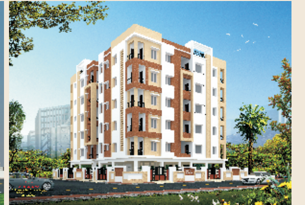
Gateway Residency Amaravathi Road, Guntur