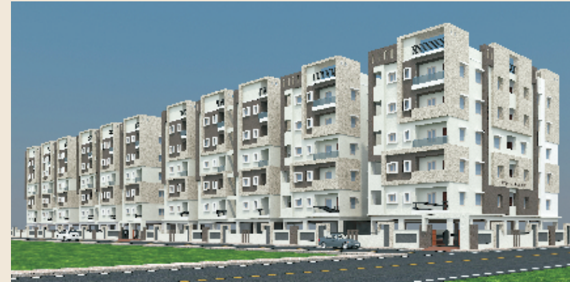
Capital Square Beside IJM Raintree Park, Kanteru Road, Guntur