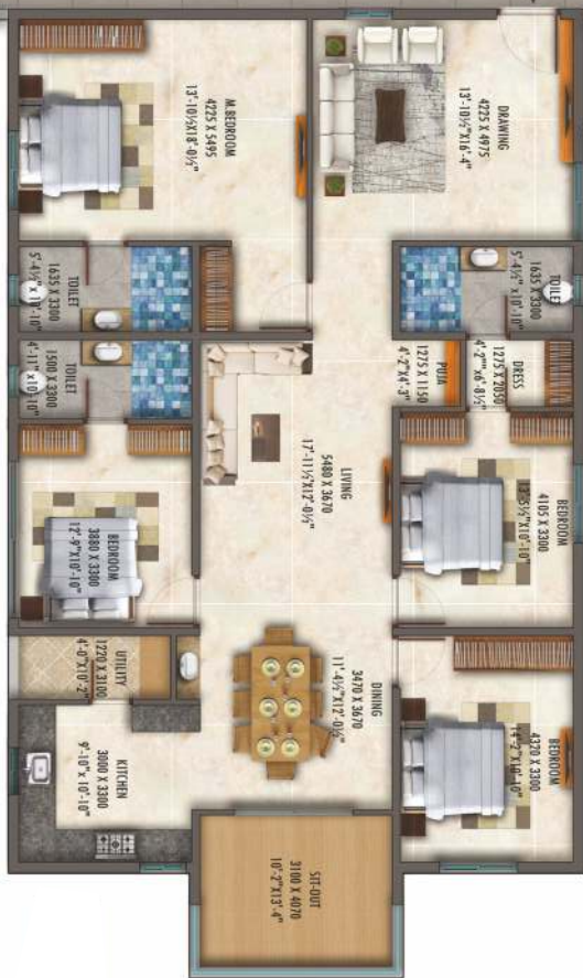
4 West Flat Area: 2700