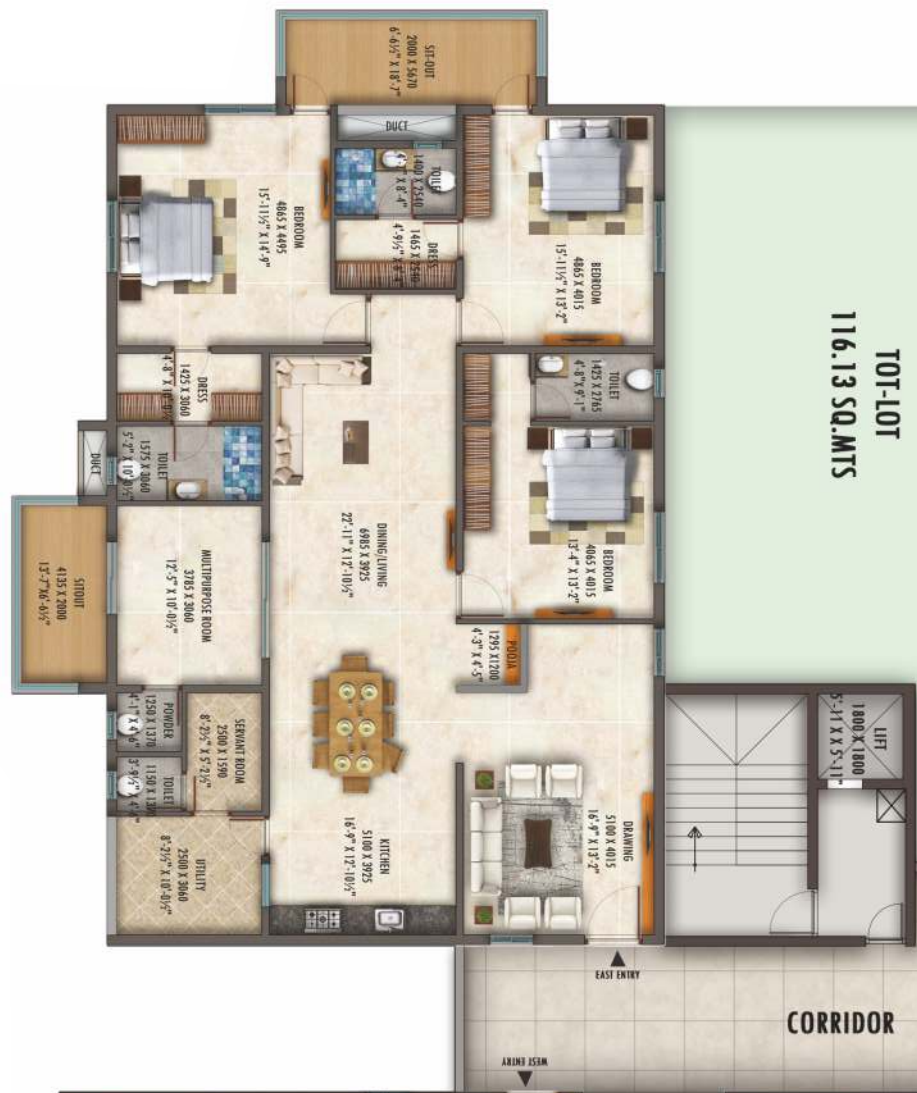
1 East Flat Area: 3200