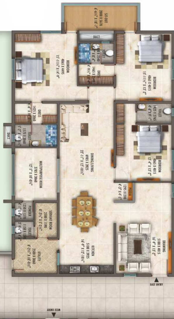
3 East Flat Area: 3100