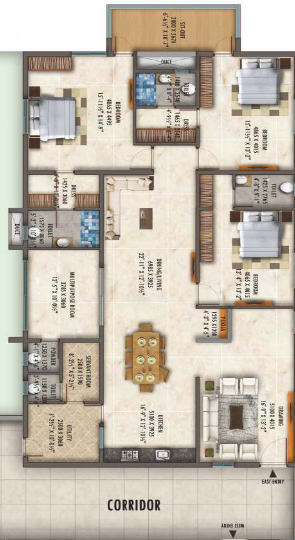
7 East Flat Area: 3200