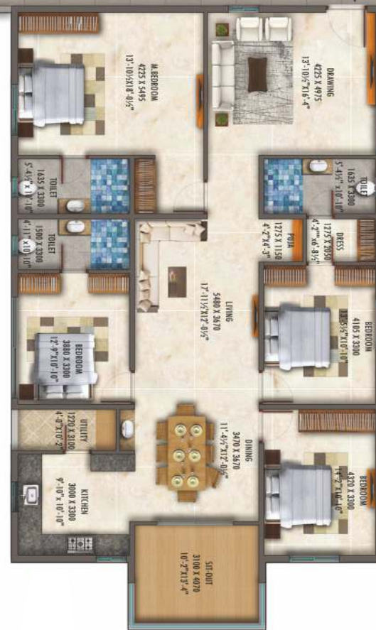
8 West Flat Area: 2700