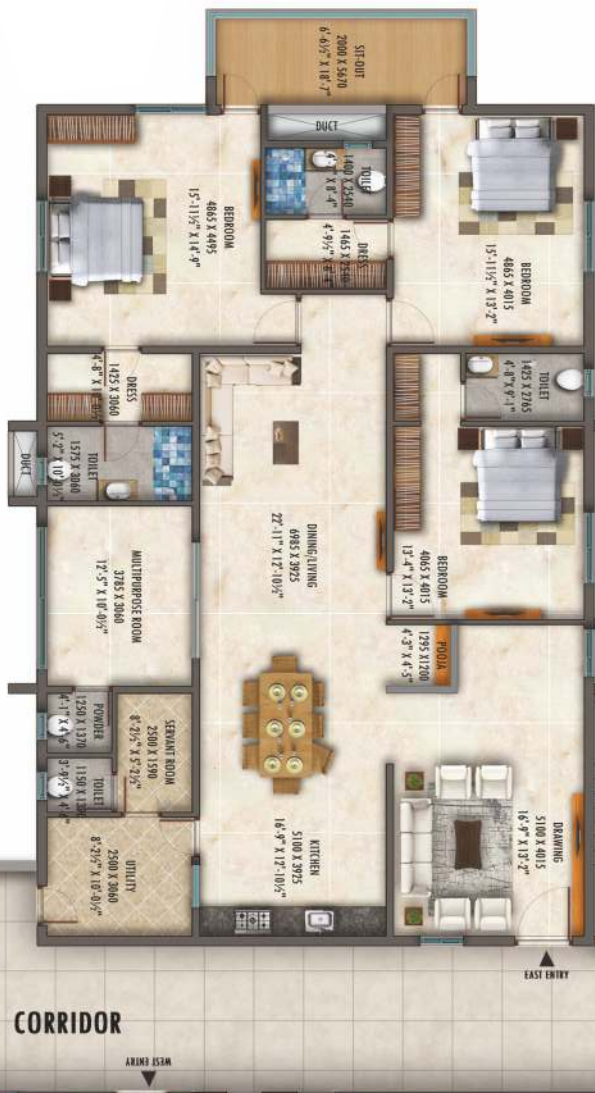
5 East Flat Area: 3100