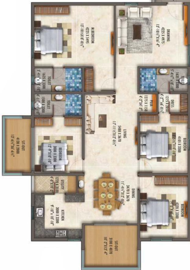
2 West Flat Area: 2800