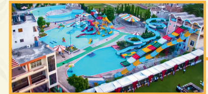
Diamond Aqua Water Park