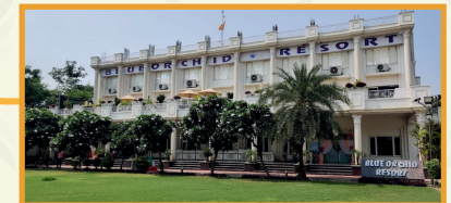
Blue Orchid Resort