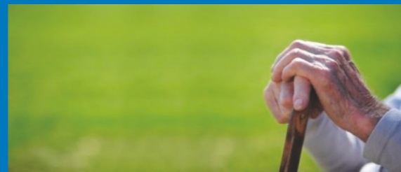
Senior Citizen Area