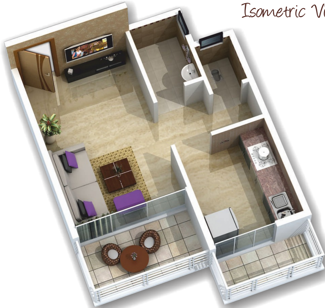
Isometric View - 1 RK & 1 BHK