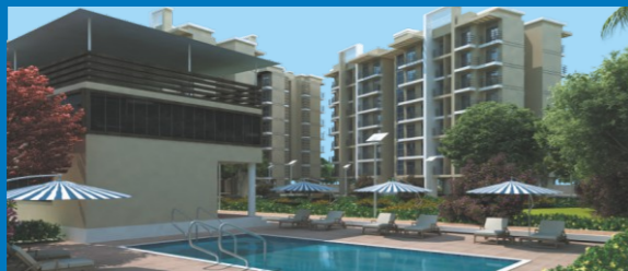
Landscape garden with children's Play area.