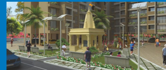
Temple Inside Complex premise