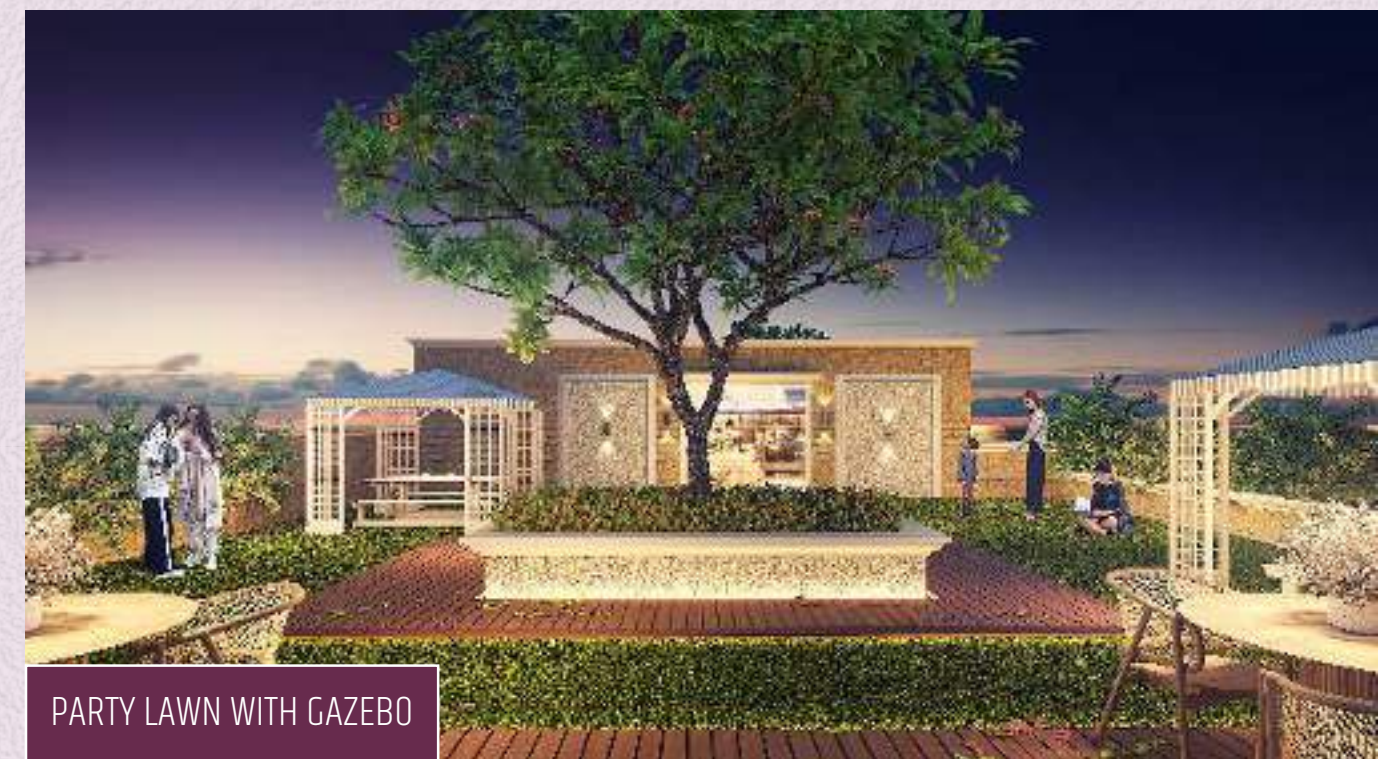
PARTY LAWN WITH GAZEBO