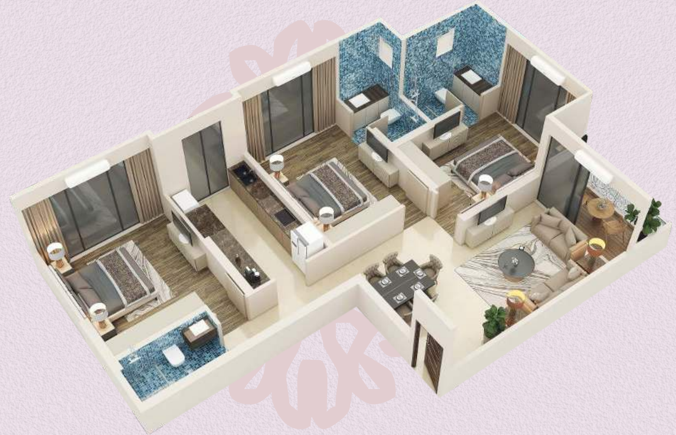
3 BHK UNIT PLAN