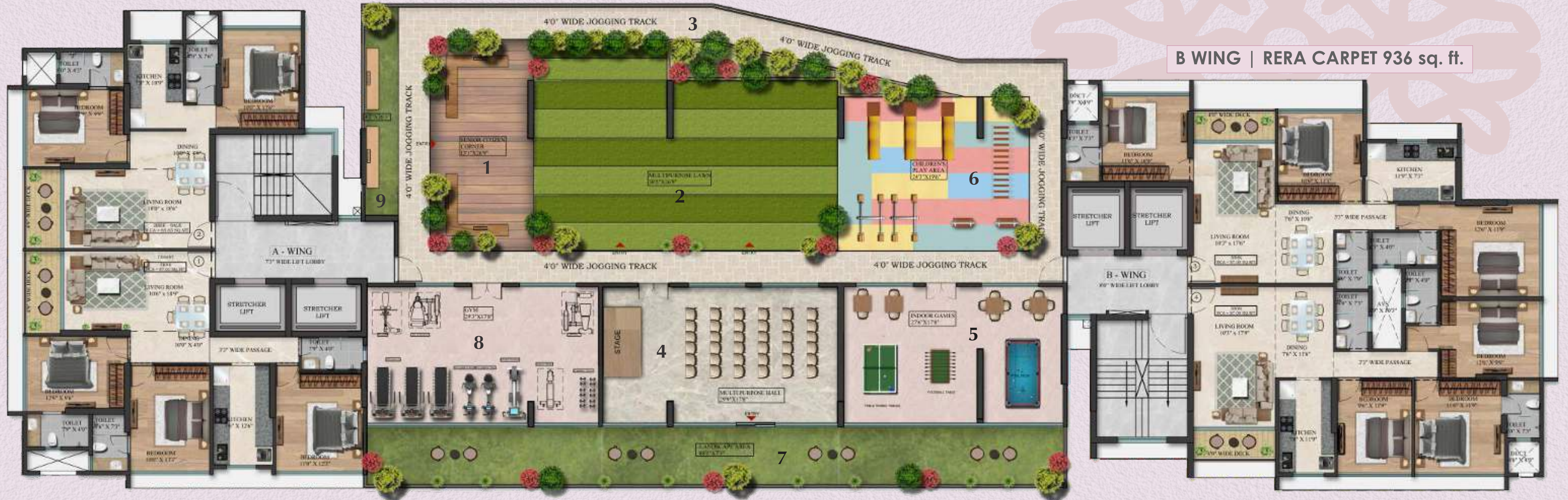
A WING | RERA CARPET 936 sq. ft.