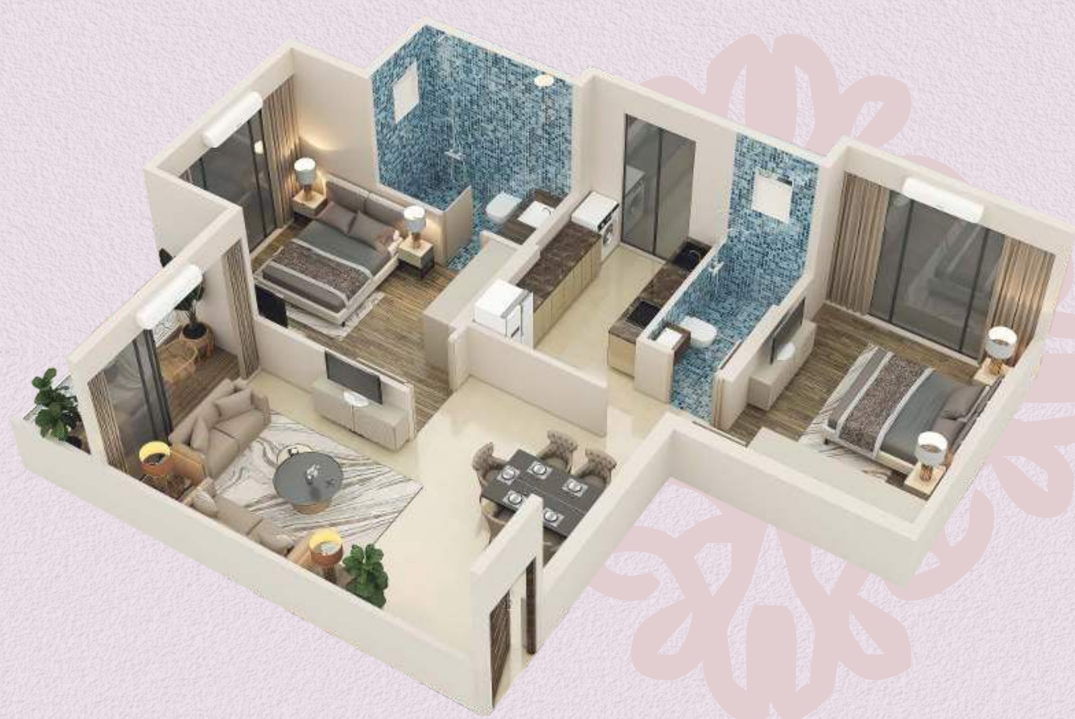
2 BHK UNIT PLAN

APARTMENTS THAT REDEFINE THE LANGUAGE OF LUXURY