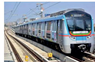
LB Nagar Metro