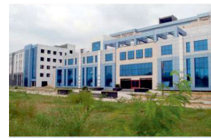
AIIMS Bibinagar Hospital