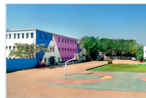
Johnson Grammar School