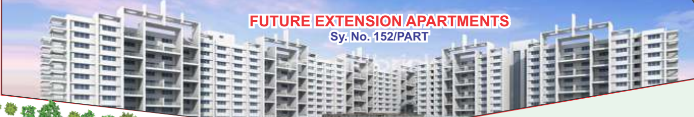
FUTURE EXTENSION APARTMENTS Sy. No. 152/PART