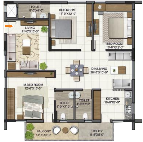
West Facing - A 3 BHK 1553 Sq.ft.