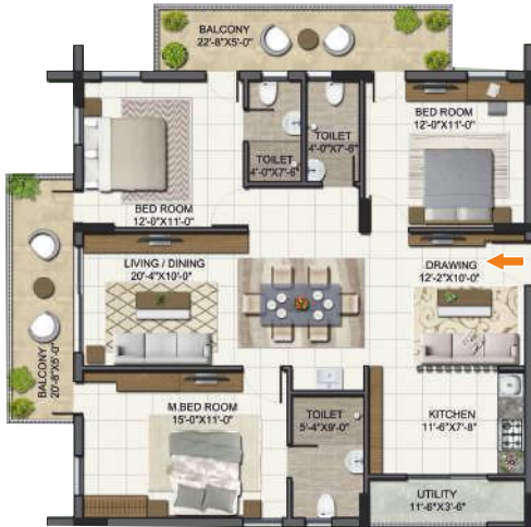
East Facing - A 3 BHK 1728 Sq.ft.