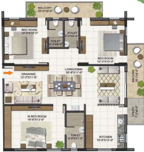
West Facing - A 3 BHK 2036 Sq.ft.