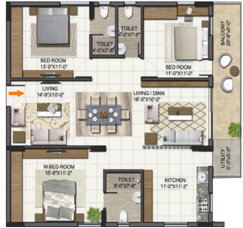
West Facing - A 3 BHK 1669 Sq.ft.