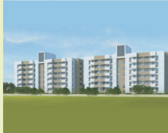
Green Leaf , Fursungi