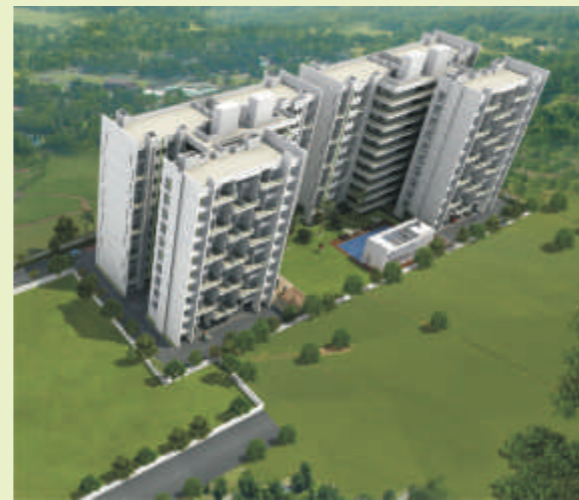
The Turf , B T Kawde Road