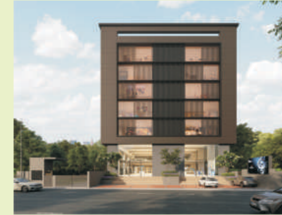
City Center , Hadapsar