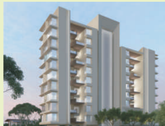
Oro Vista , Modi Baug, Shivajinagar