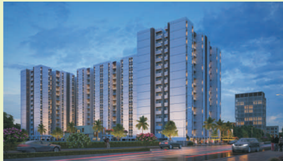
Green Park , Fursungi