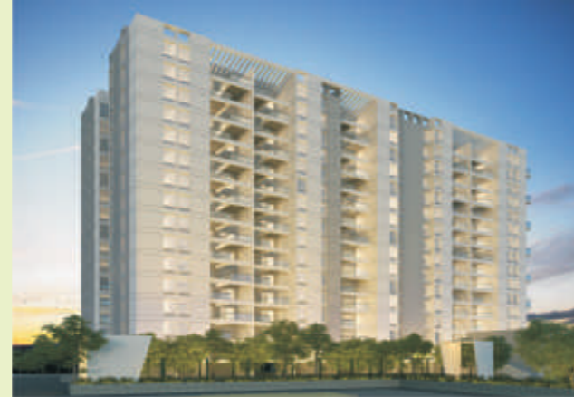
UNIKA , Hadapsar