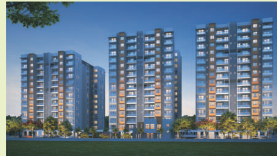
Green Ville , Hadapsar