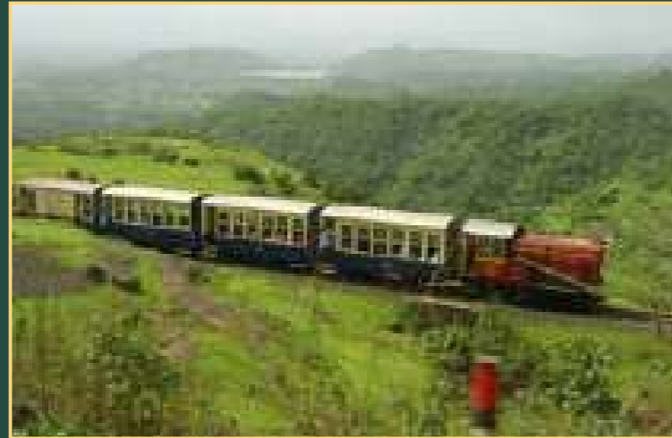
Matheran Hill Station