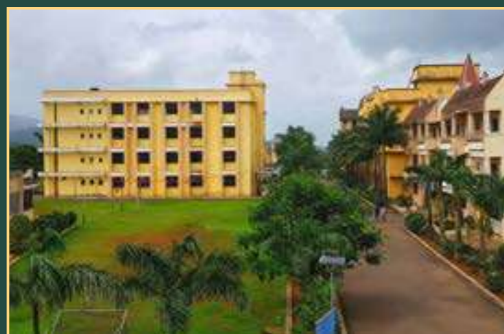
Dilkap College of Engineering