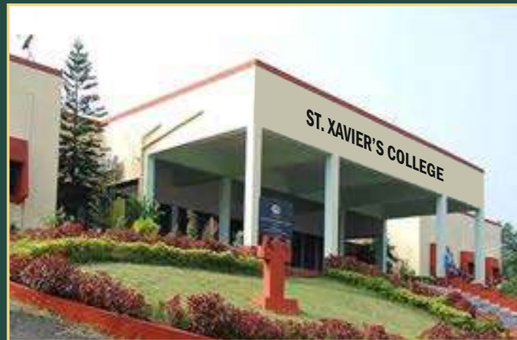
St. Xavier's College