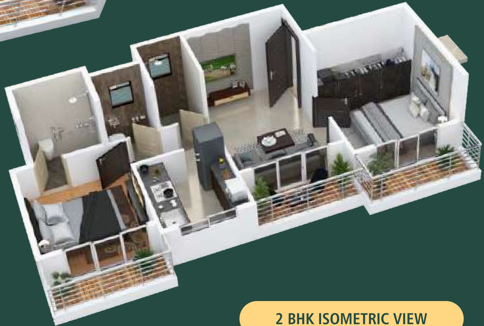
2 BHK ISOMETRIC VIEW