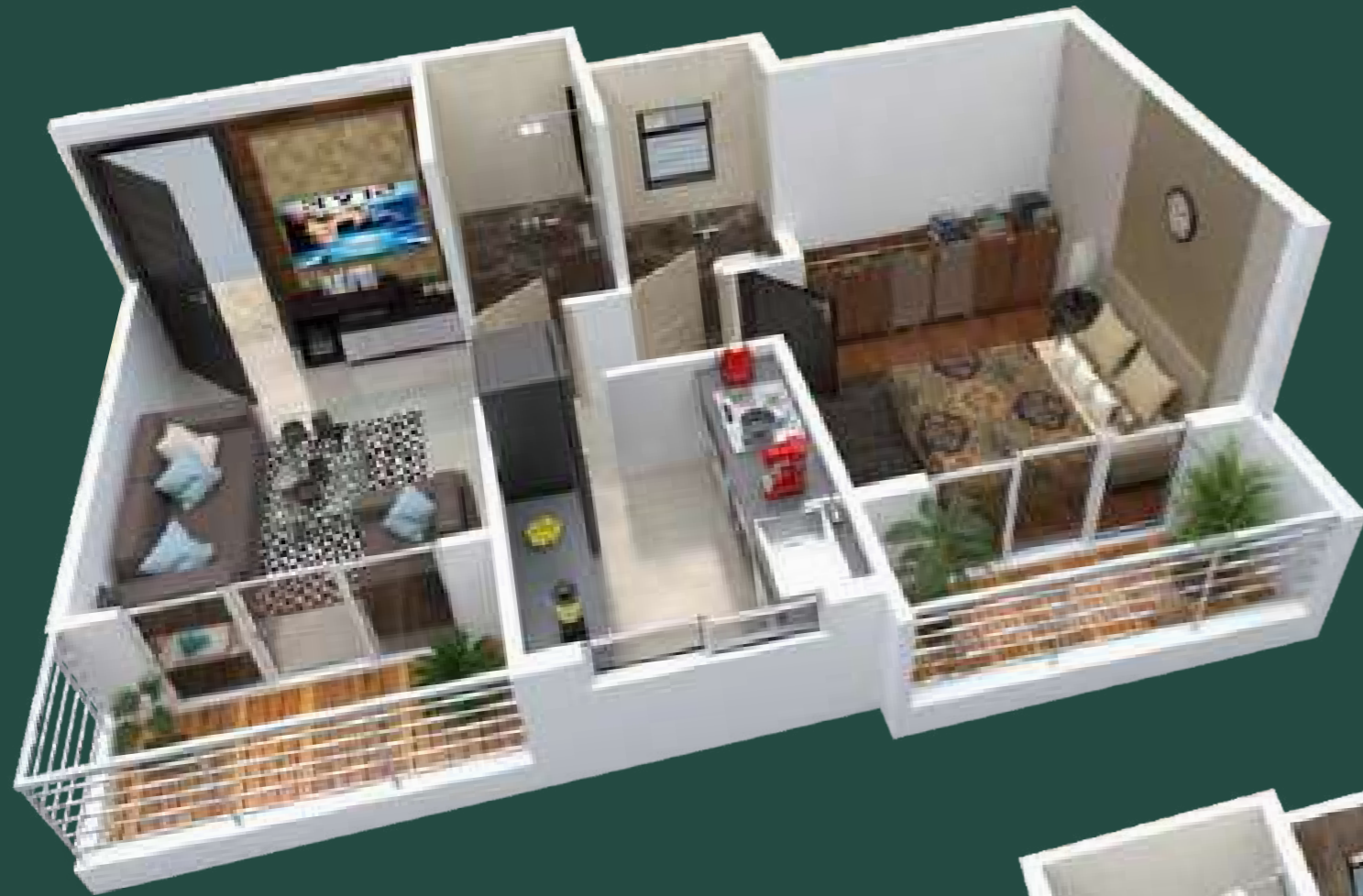
1 BHK ISOMETRIC VIEW