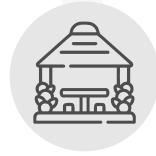
Pergola With Seating