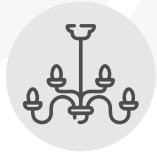
Designer Entrance Lobby