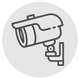
CCTV at The Entrance Gate