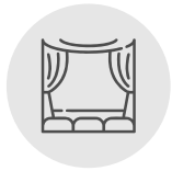
Stage For Cultural Events