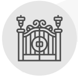
Grand Entrance with Security Cabin