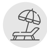
Pool Side Deck