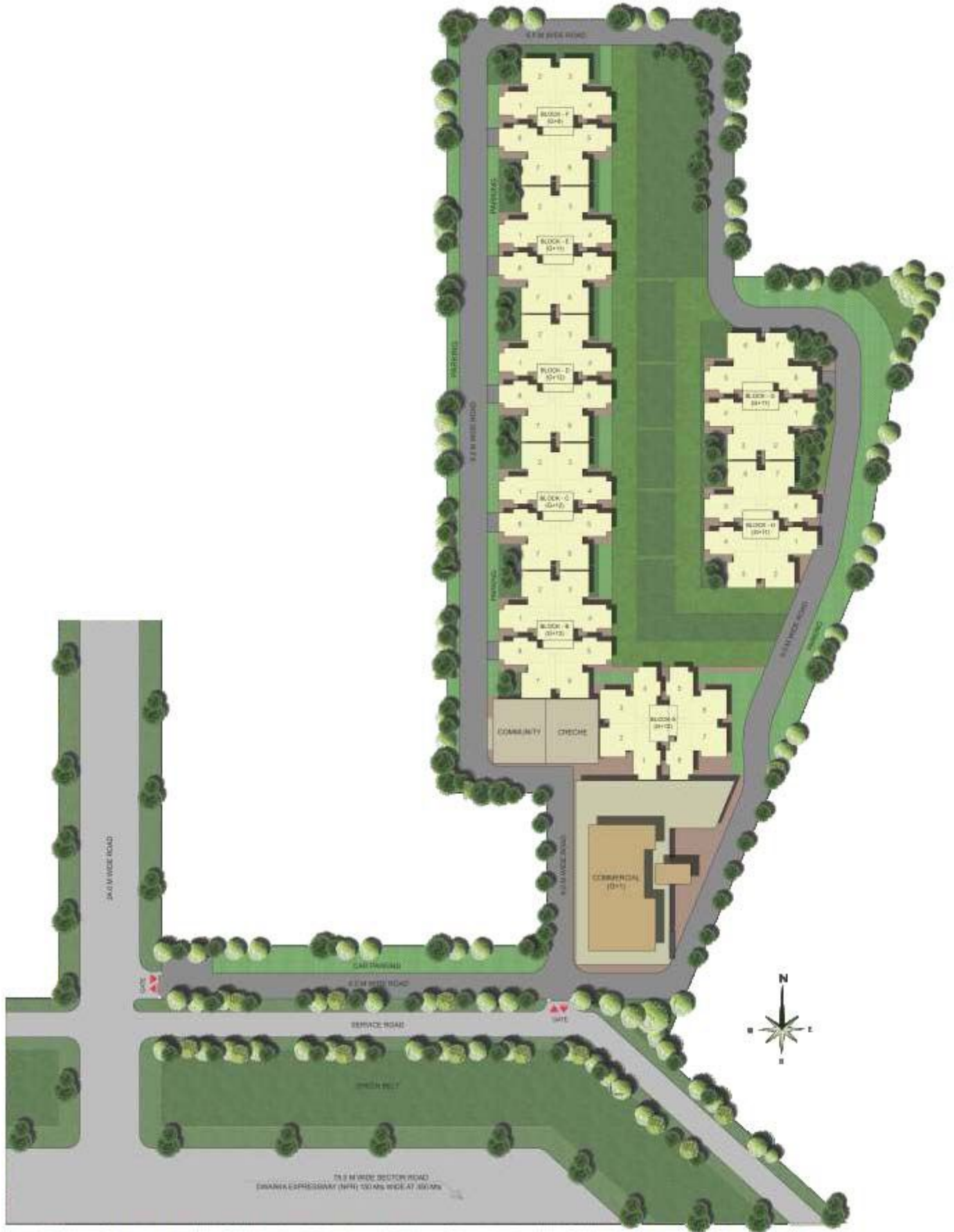
SITE LAYOUT PLAN