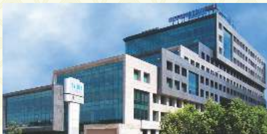
Time Tower, M.G. Road, Gurgaon