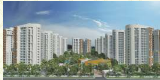
Parikrama, Sector-20, Panchkula