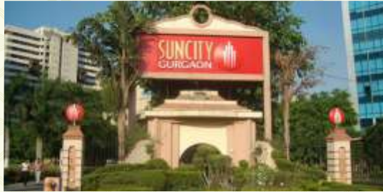
Suncity Township, Golf Course Road, Gurgaon