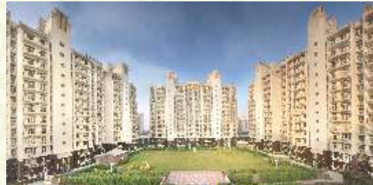
Essel Tower, M.G. Road, Gurgaon