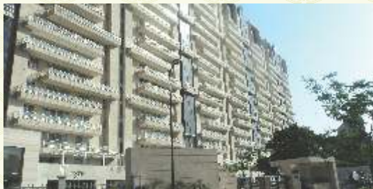
La Lagune, Golf Course Road, Gurgaon