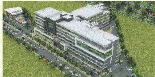
Success Tower, Sector-65, Gurgaon

Suncity Projects is one of the most eminent real estate companies in North India. The Group has built an unshakable reputation for quality, efficiency, trust and meticulous planning. Suncity Projects in North India are famous for offering top quality amenities, superlative designs, timely completion, guaranteed possessions and handing over of projects ranging from Townships to Group Housing to Luxury Apartments. In Corporate & Retail space Suncity Projects offers Shopping Malls to Office Complexes. The organisation is backed with the unmatched experience and expertise of two of India's most reputed business conglomerates - The Essel Group and the Action Group.