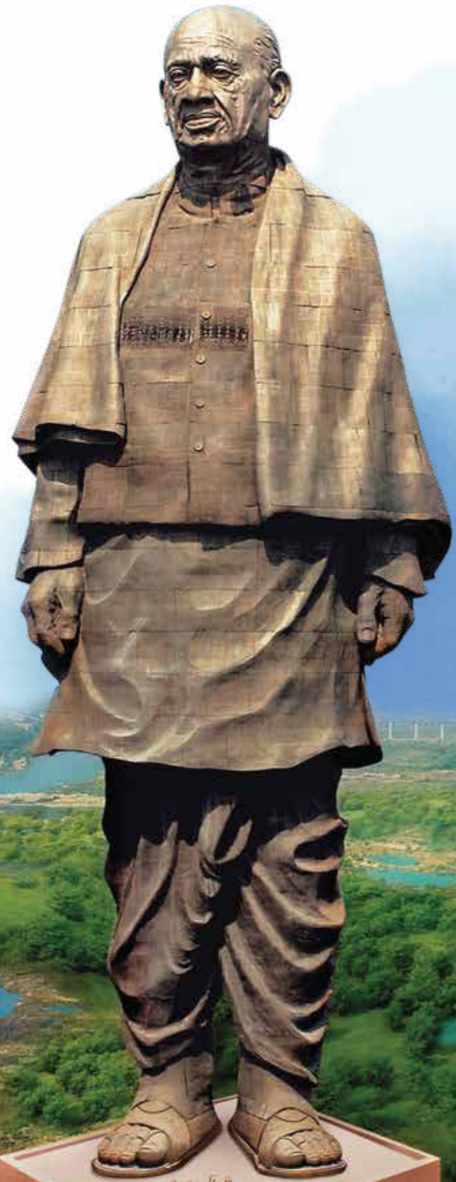
Statue of Unity, Gujarat

Larsen & Toubro is a USD 21 Billion conglomerate. You've seen this name on megastructures, gigantic construction sites and in the headlines - reporting benchmark setting projects in India and abroad. From our earliest days of manufacturing to our most recent projects, L&T has been a critical part of India's growth. Today, many of India's iconic buildings, airports to IT parks, malls to monuments, carry our signature of excellence.