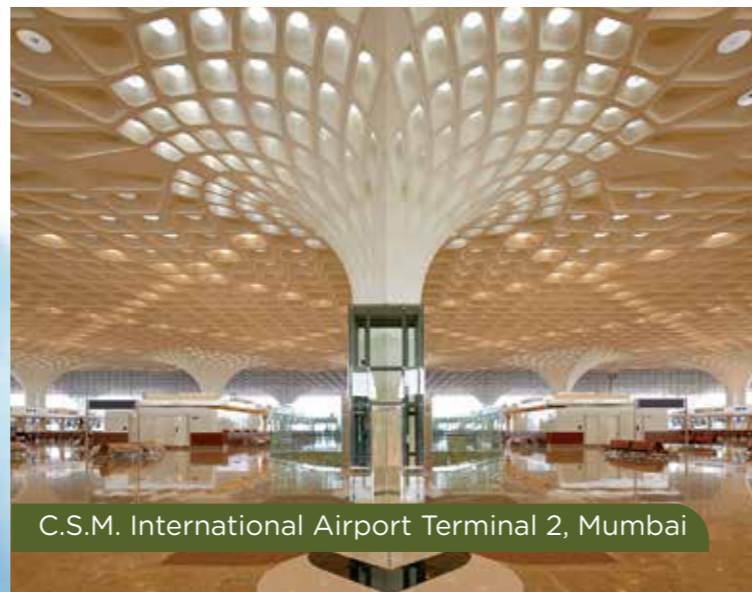
C.S.M. International Airport Terminal 2, Mumbai