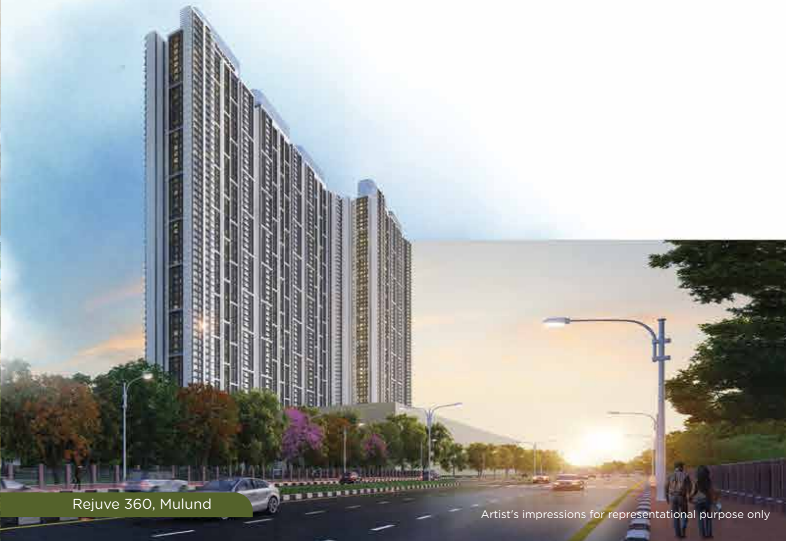
Rejuve 360, Mulund

A residential complex designed to help you feel 'rejuvenated' all day, every day. With its diligently designed homes and nature-inspired amenities, Rejuve 360 is a true haven for your and your family's wellness.