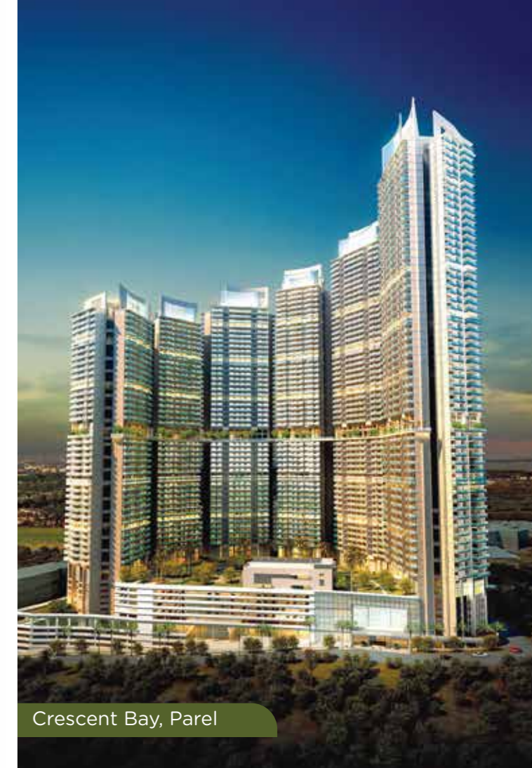
Crescent Bay, Parel

Artist's impressions for representational purpose only