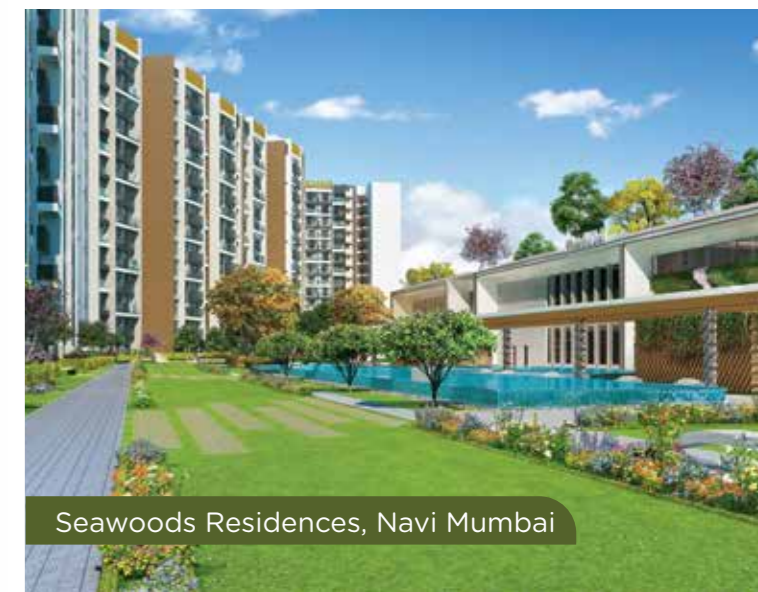
Seawoods Residences, Navi Mumbai