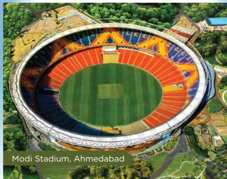
Modi Stadium, Ahmedabad