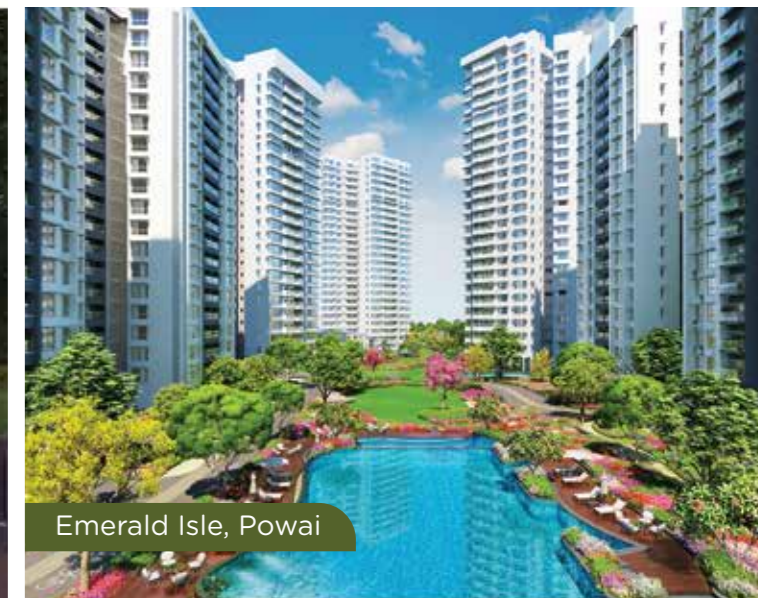
Emerald Isle, Powai