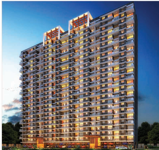
Balaji Emerald - Thakurli (E) Ongoing