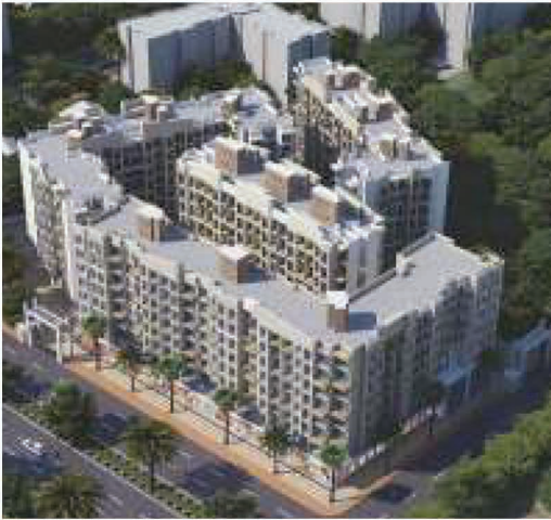
Balaji Aangan Complex - Thakurli (E) Completed