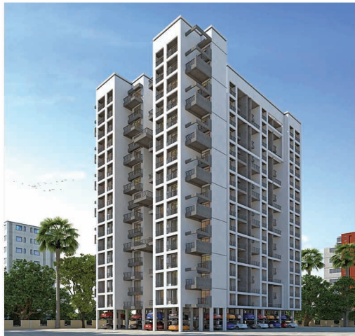
Balaji Residency - Thakurli (E) Completed