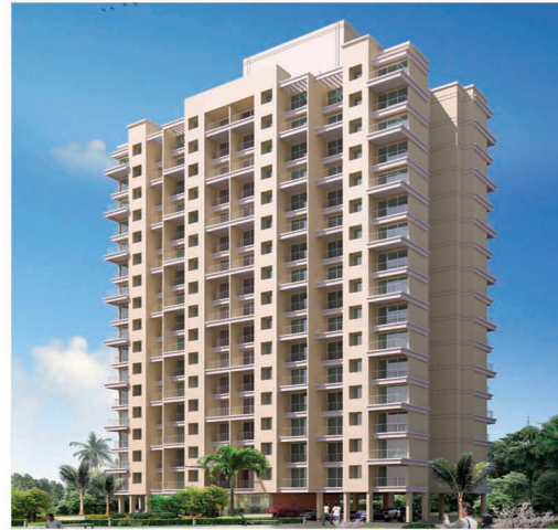
Trilok Heights - Thakurli (E) Completed