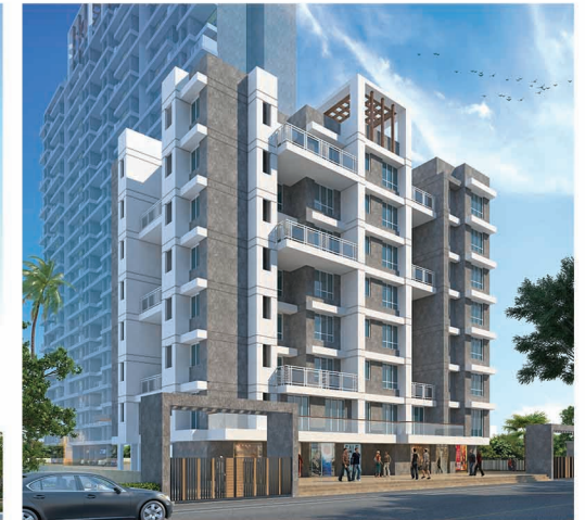
Balaji Emerald - Thakurli (E) Ongoing