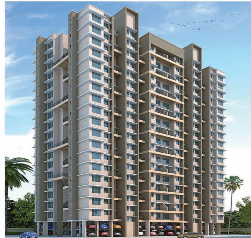
Balaji Annex - Thakurli (E) Ongoing