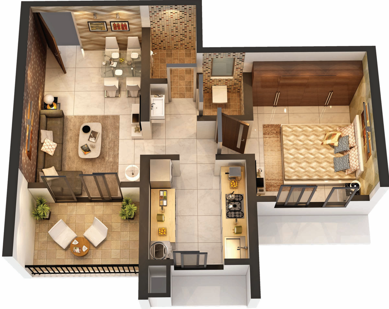
1 BHK Isometric View