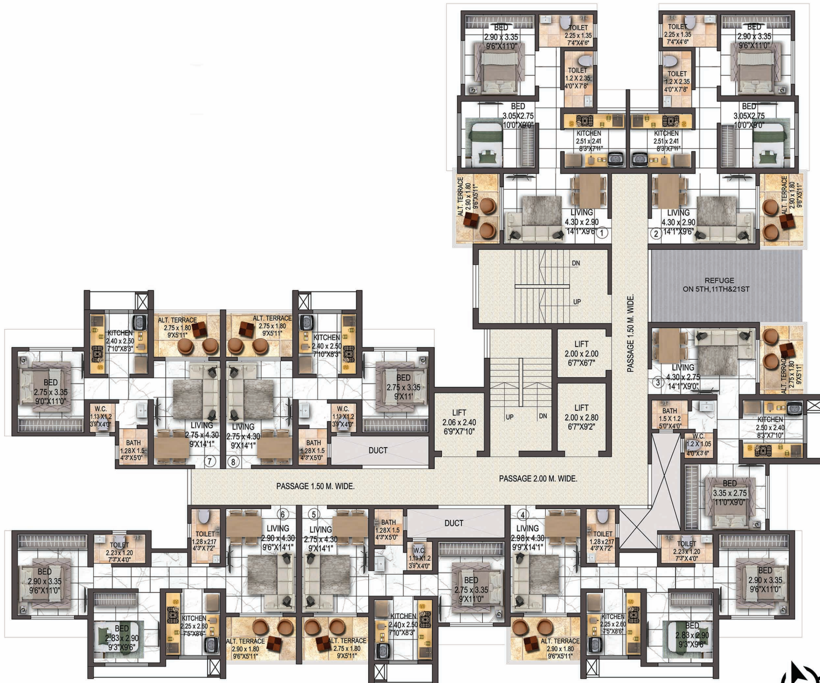
3RD, 5TH, 7TH, 9TH, 11TH, 13TH, 15TH, 17TH, 19TH, 21TH & 23TH FLOOR PLAN.