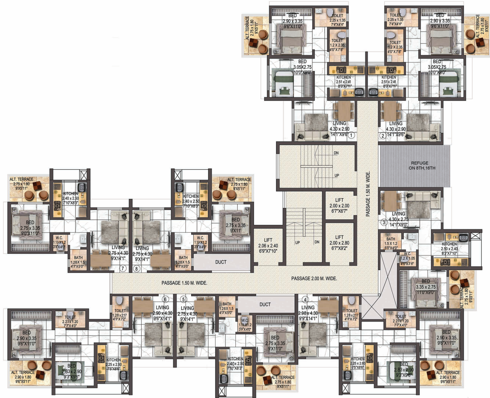
4TH, 6TH, 8TH, 10TH, 12TH, 14TH, 16TH, 18TH, 20TH & 22ND FLOOR PLAN.