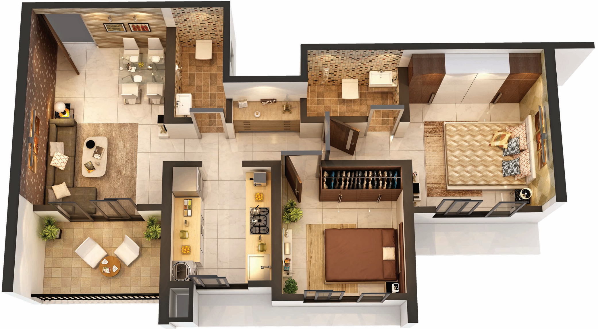
2 BHK Isometric View