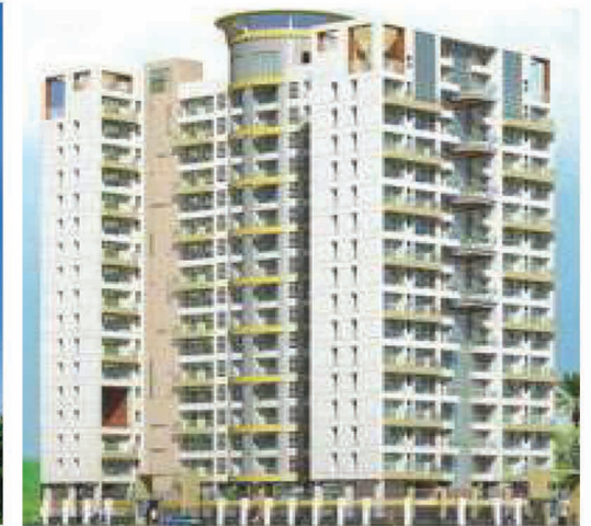
Dream Heights - Kharghar Completed