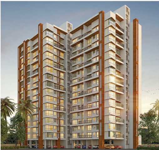
Balaji Siddhivinayak Complex Dombivali (W) - Ongoing