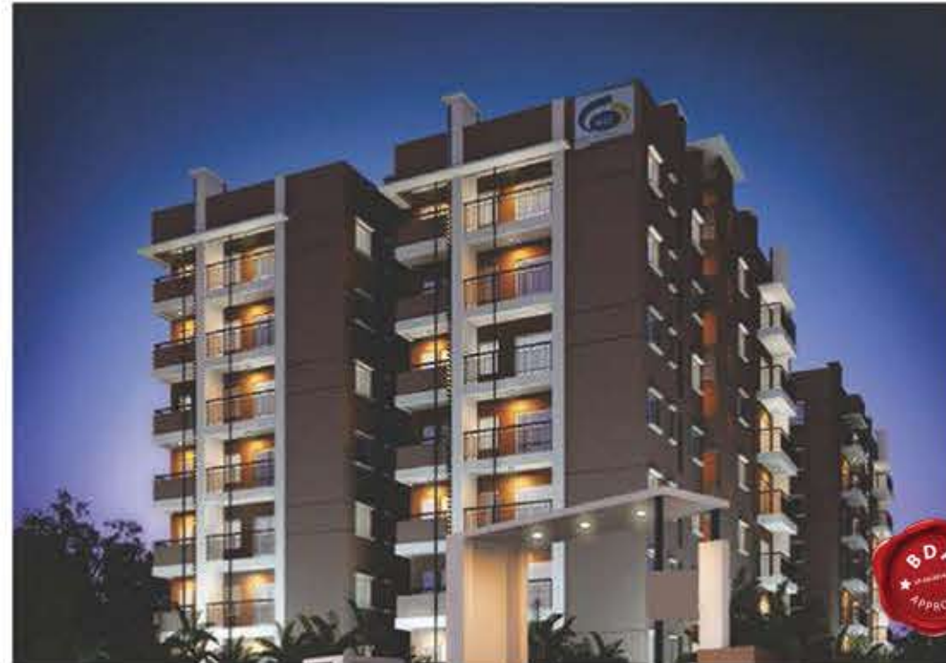
OC obtained - Electronic City Phase 1

Our landmark project has pinned us on the maps of Bangalore. Amidst the busy offices in Electronics City, stands a home that is peaceful and lavish. With 77 homes spread on 1.2 acres, Elena is a dream come true for all of the happy families that live here.