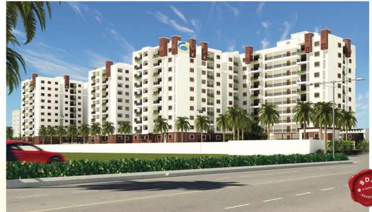
OC obtained - 300 Apartments Electronic City Phase 1

Elena 5, a home that makes you want to live, a place where your dreams come true, a place to create memories, a place to call home. Come, live peace, lifestyle, luxury, but more importantly, just live, for you have earned it.. For you belong right here, amidst solitude.