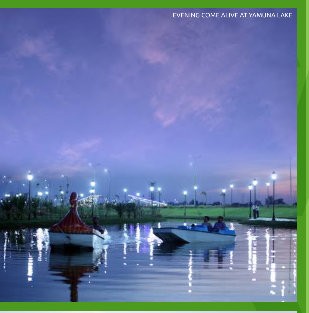
GLITTERING GAUR YAMUNA CITY WITH ITS BEAUTIFUL LAMP POSTS AROUND THE TOWNSHIP

All specifications, images including stock images, colours, pictures and accessories are indicative and used for illustrative purposes only. For the actual project details, pl. refer to the specifications mentioned in the subsequent page of the brochure