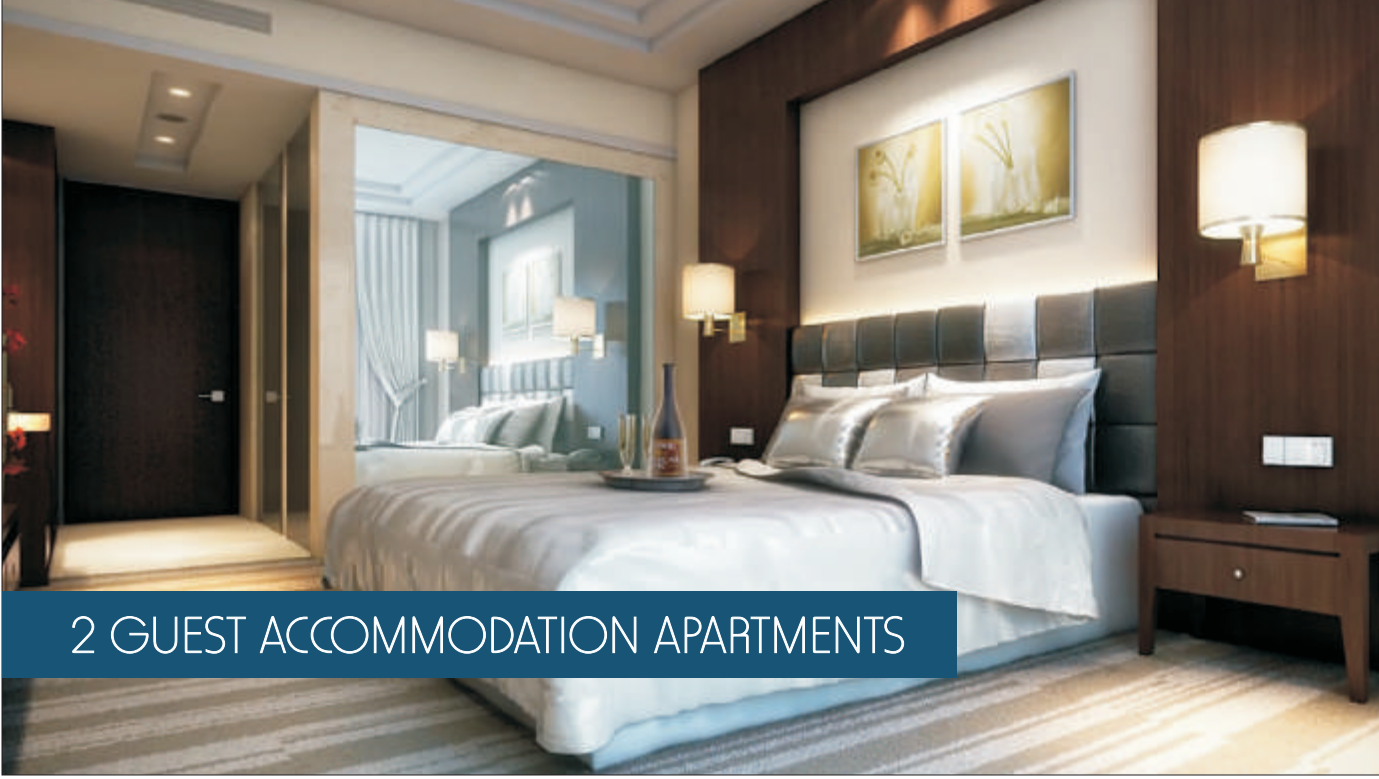
2 GUEST ACCOMMODATION APARTMENTS