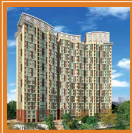
GUNDECHA GREENS Thakur Village, Kandivali (E)