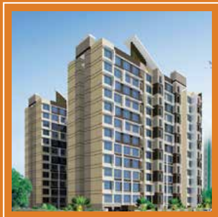
GUNDECHA ASTA Sakinaka, Andheri (E)