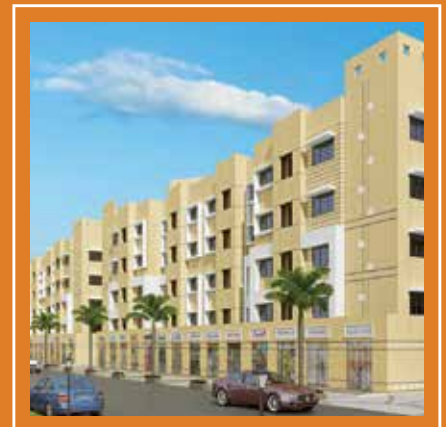
GUNDECHA WOODS Nandore, Palghar (E)