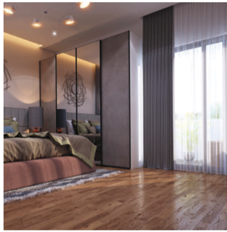
Large windows for the small things

Put up your feet and let time tick by as you take in the open view from the splendid balcony. Sip coffee one after the other as it's really hard to relinquish the coveted balcony seat and end the affair with the wind in your hair.