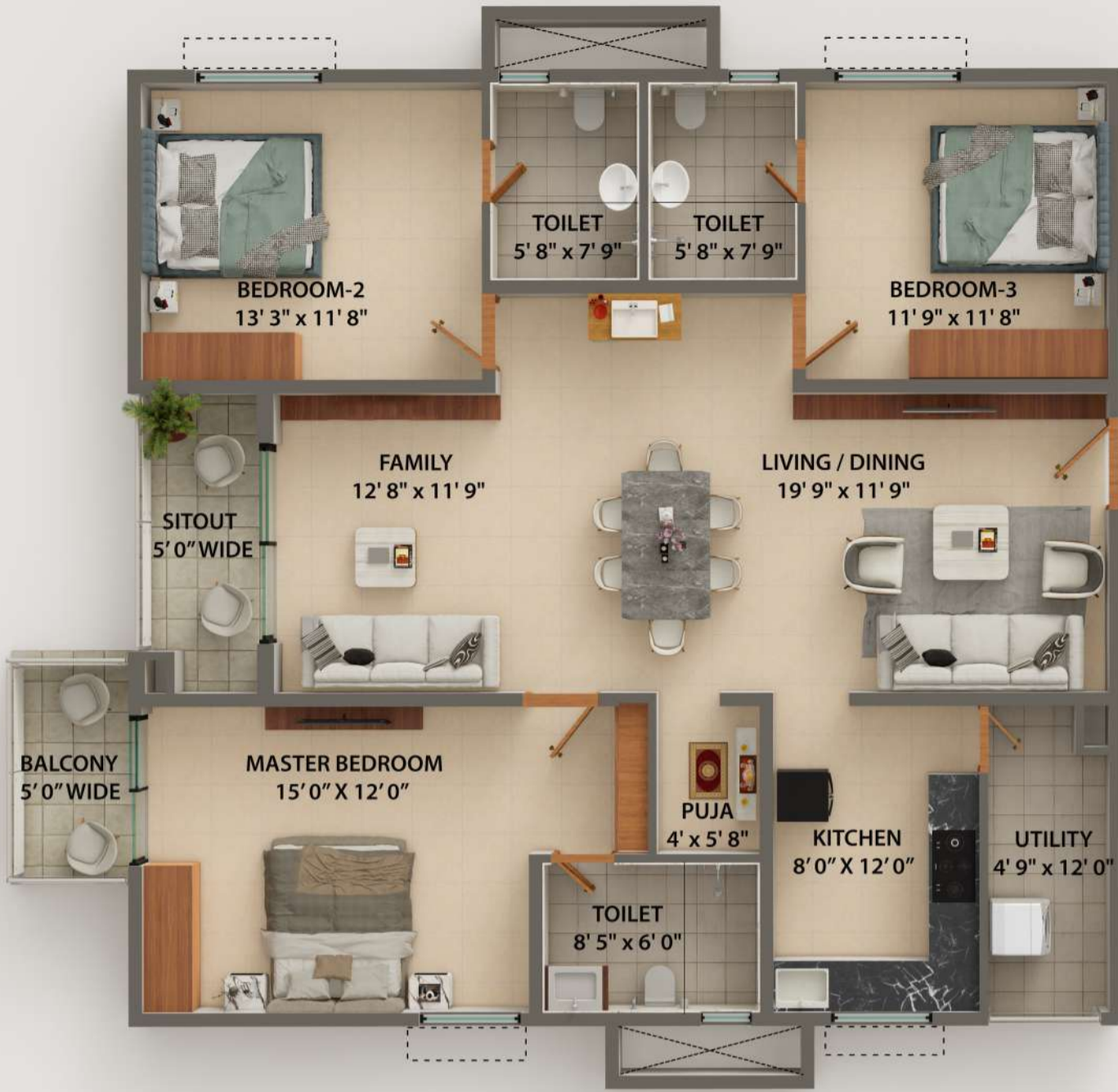
TYPE-4 | 3 BHK EAST FACING 1905 SFT