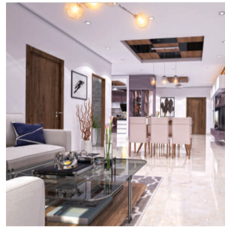
Right spaces for living areas and bedrooms

Park yourself by the side and witness the marvels of nature unfold in front of your eyes. Hug the morning sun tight and kiss the moon good night by the window side. View life in the different light.