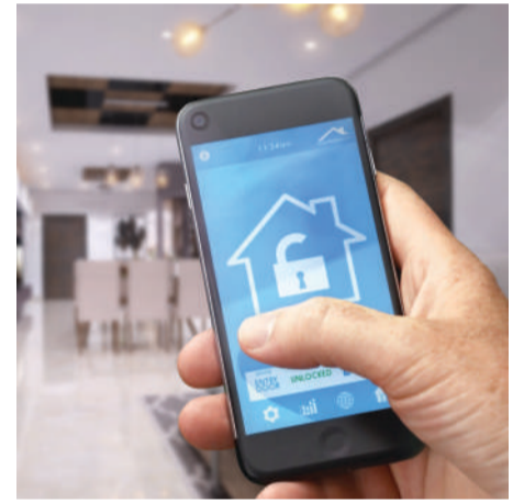
Welcome home the future

Exquisite features grace your home from the outside, while intelligently designed living areas and bedrooms make space for delights to pep up your every day.