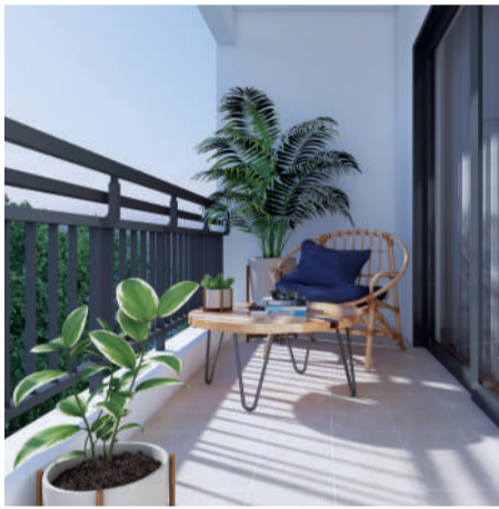
Bask in the sit-out balcony

Every single abode at Ramky One Astra is future-ready with smart home automation. The plush interiors exude a fine melange of charm and warmth. The grand windows usher in sunlight as if it was your own. Spend moments laden with solitude at the sit-out balcony that's an extension of your home whose sole objective is to soak you in luxury.