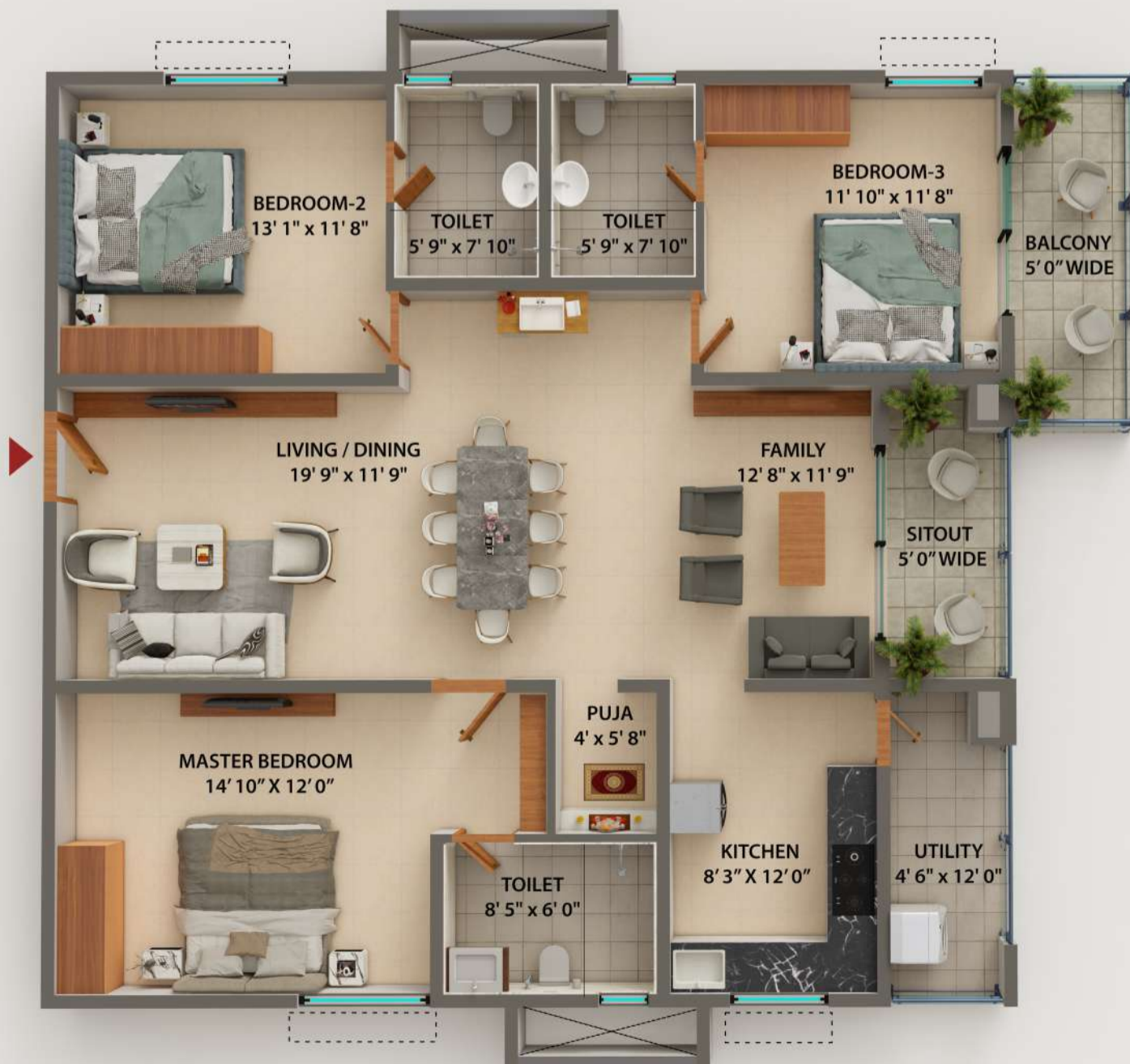
TYPE-4a | 3BHK WEST FACING 1935 SFT