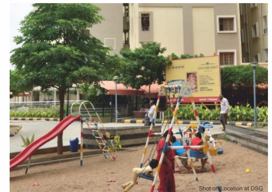
Shot on Location at DSG