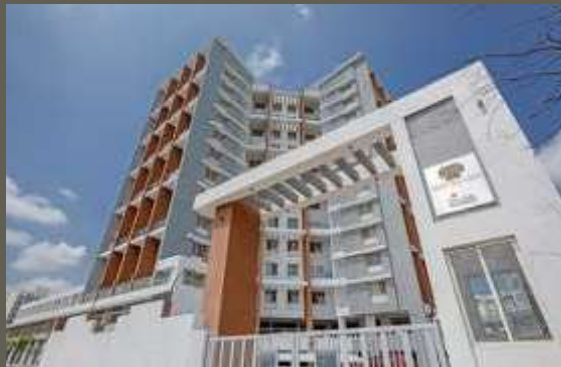
Mio Palazzo Kharadi, Pune

Two coveted real estate brands that have envisioned this masterpiece and passionately crafting it. They have an extensive experience and a refined vision. The landmark projects they have delivered and a penchant for stringent quality standards. A remarkable sense of aesthetics and precision in every project. Especially in the east of Pune, they possess a commendable track record.