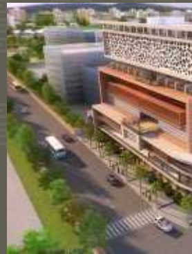
Global Bu Kharadi, Pune