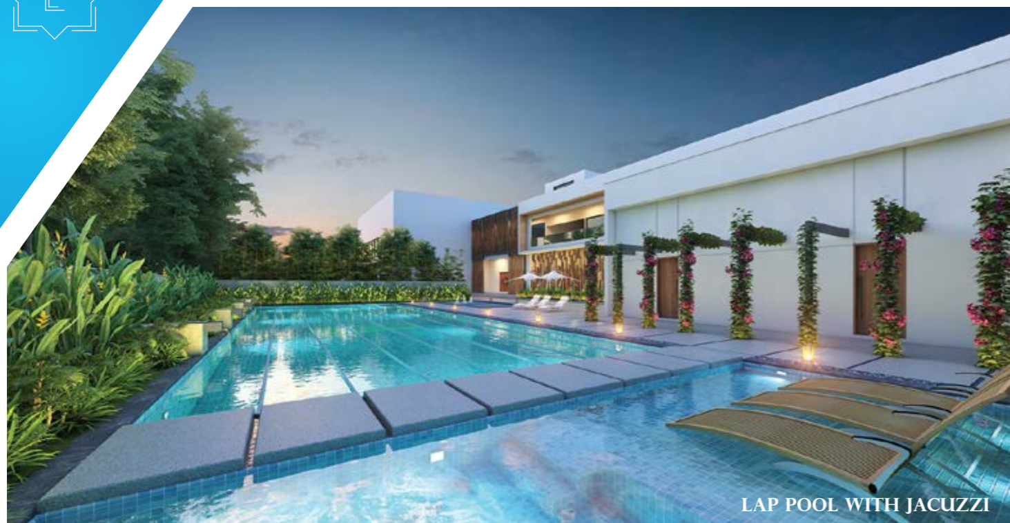
LAP POOL WITH JACUZZI