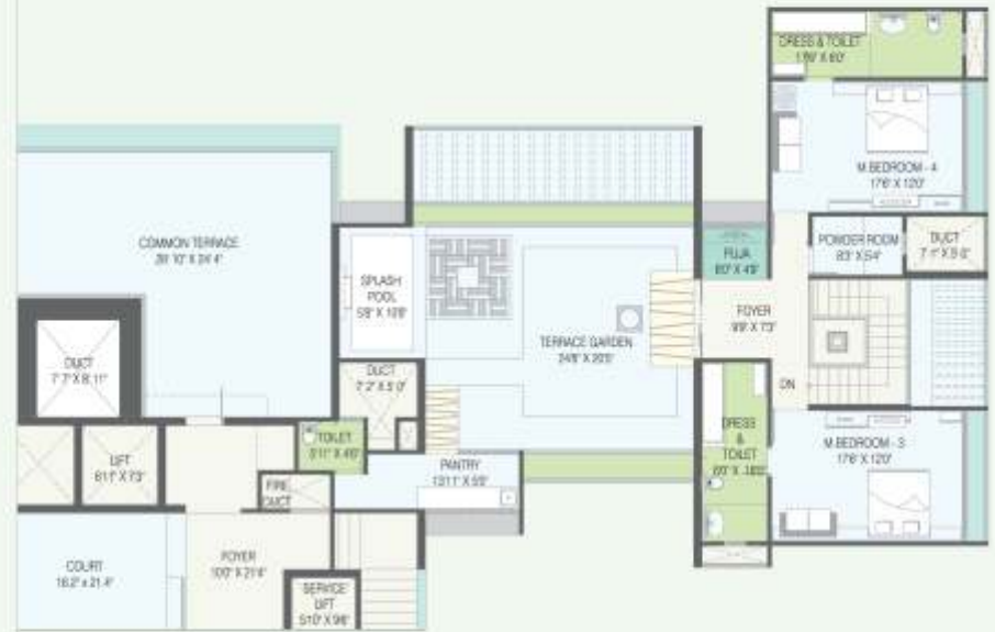
5 BHK PENTHOUSE UPPER LEVEL PLAN (5500 sq. ft.)