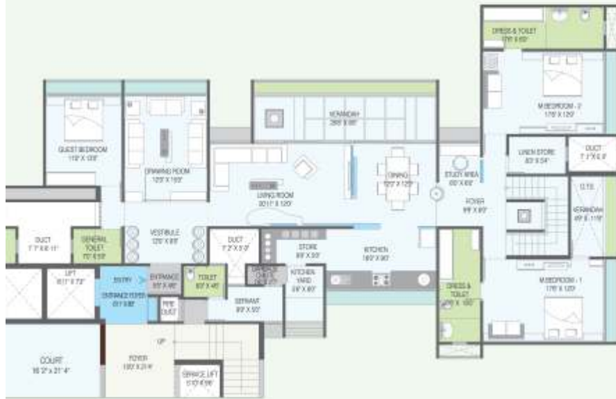
5 BHK PENTHOUSE LOWER LEVEL PLAN (5500 sq. ft.)