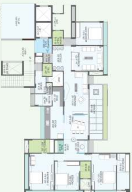
4 BHK LUXURIOUS UNIT PLAN (3000 sq. ft.)