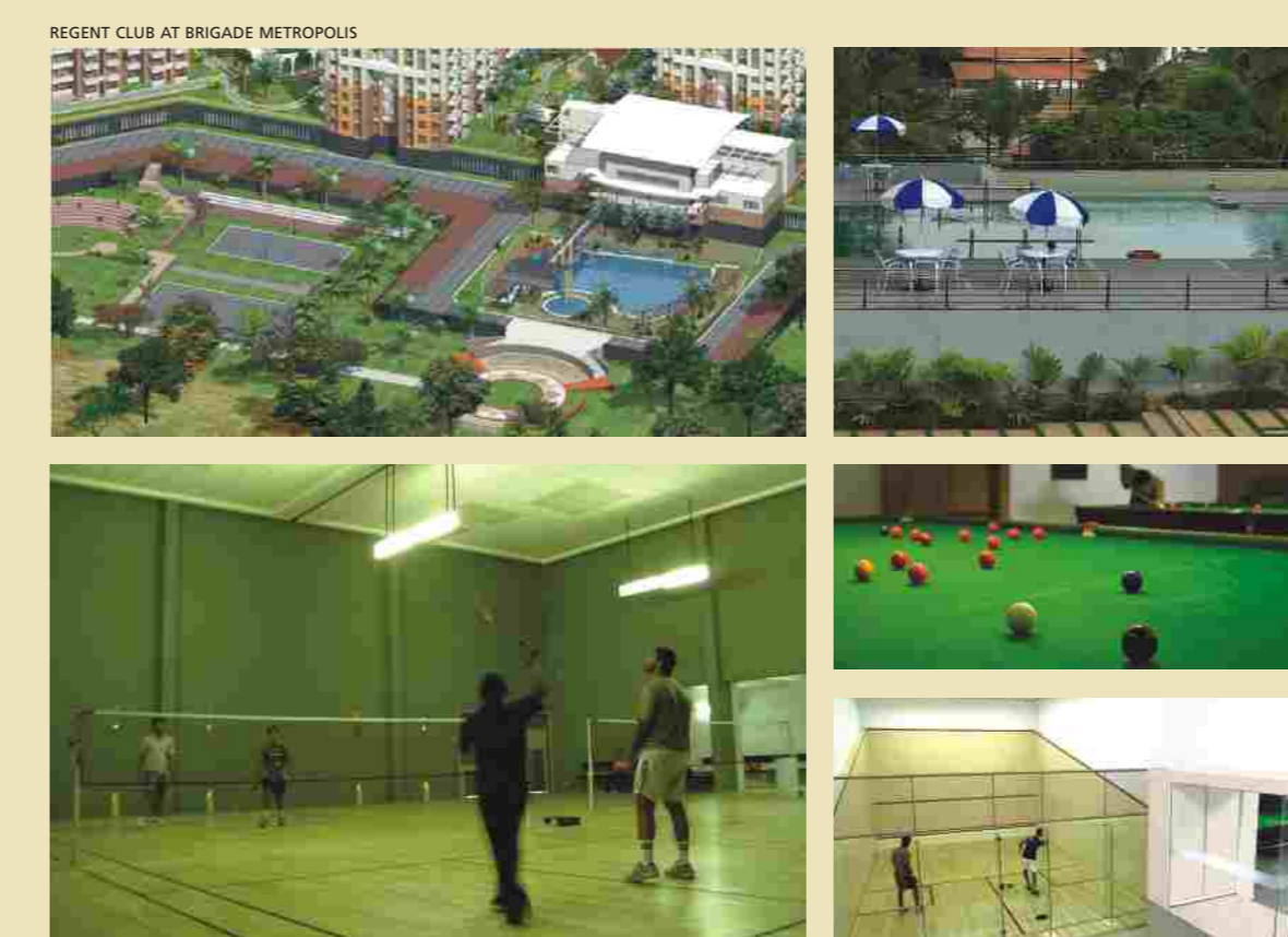
PHOTOGRAPH OF SWIMMING POOL AND SPORTS FACILITIES AT THE WOODROSE CLUB, BRIGADE MILLENNIUM

Apart from the sports facilities available at the club, the enclave will have various floodlit outdoor sports facilities.