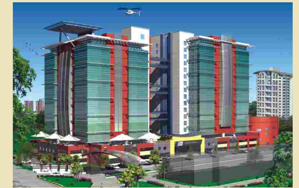
SUMMIT 1 AND 2, AS VIEWED FROM THE PROMENADE

Ample parking space will be created at four levels.