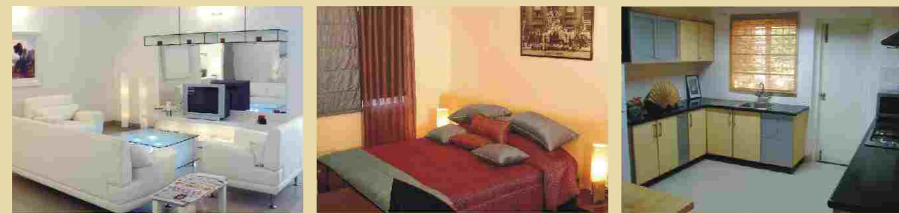
MODEL APARTMENT AT BRIGADE METROPOLIS

Our luxury apartments will have two and three bedrooms. With the launch of Phase 2, we present a new and wide choice of apartments. The model apartment at Brigade Metropolis will give you a clear picture of how it will feel to call Brigade Metropolis home.