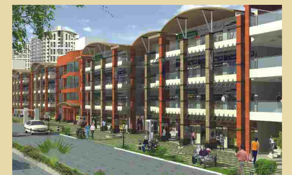
THE ARCADE, AS VIEWED FROM THE PROMENADE

Located at the entrance to the enclave, separated from Summit 1 and 2 by the stretch of The Promenade, The Arcade will offer 100,000 sft of excellent retail and small-office space. It is designed as the neighbourhood shopping centre, spread across four storeys. The Arcade will service the needs of the enclave's residents and users, as well as people living and working in the vicinity. Facilities are likely to include a supermarket, fruit and vegetable stalls, a cold storage, 24-hour pharmacy, clinics, a beauty parlour, ATM, cafeterias and a food court. The Arcade will also house business centres and provide small-office space for professionals.