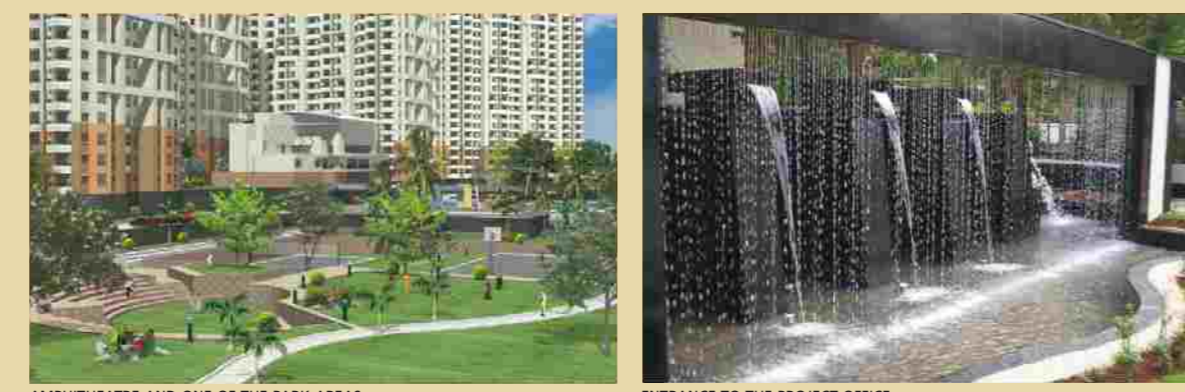
AMPHITHEATRE AND ONE OF THE PARK AREAS

The gardens of Brigade Metropolis will be a tribute to the imagination and painstaking effort of expert landscapers. The sheer extent and variety of these gardens will be a source of daily delight—Reflexology, Maze and Fragrant gardens; party lawns; a floral walk; pavilion seating amidst trellised arches; gazebos, fountains and water bodies; pathways and jogging tracks... The great outdoors at Brigade Metropolis will—additionally—include cheerful playgrounds, a floral clock, a skate park, barbecue area, exercise station, dance plaza, band stand and a special alcove for senior citizens.