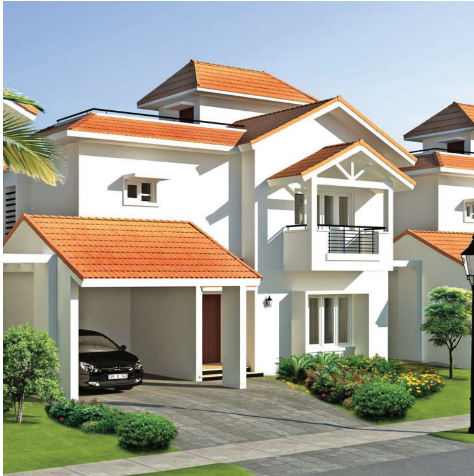
VILLA TYPE B-2