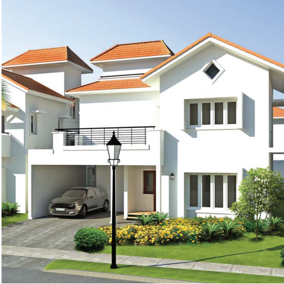
VILLA TYPE B-1