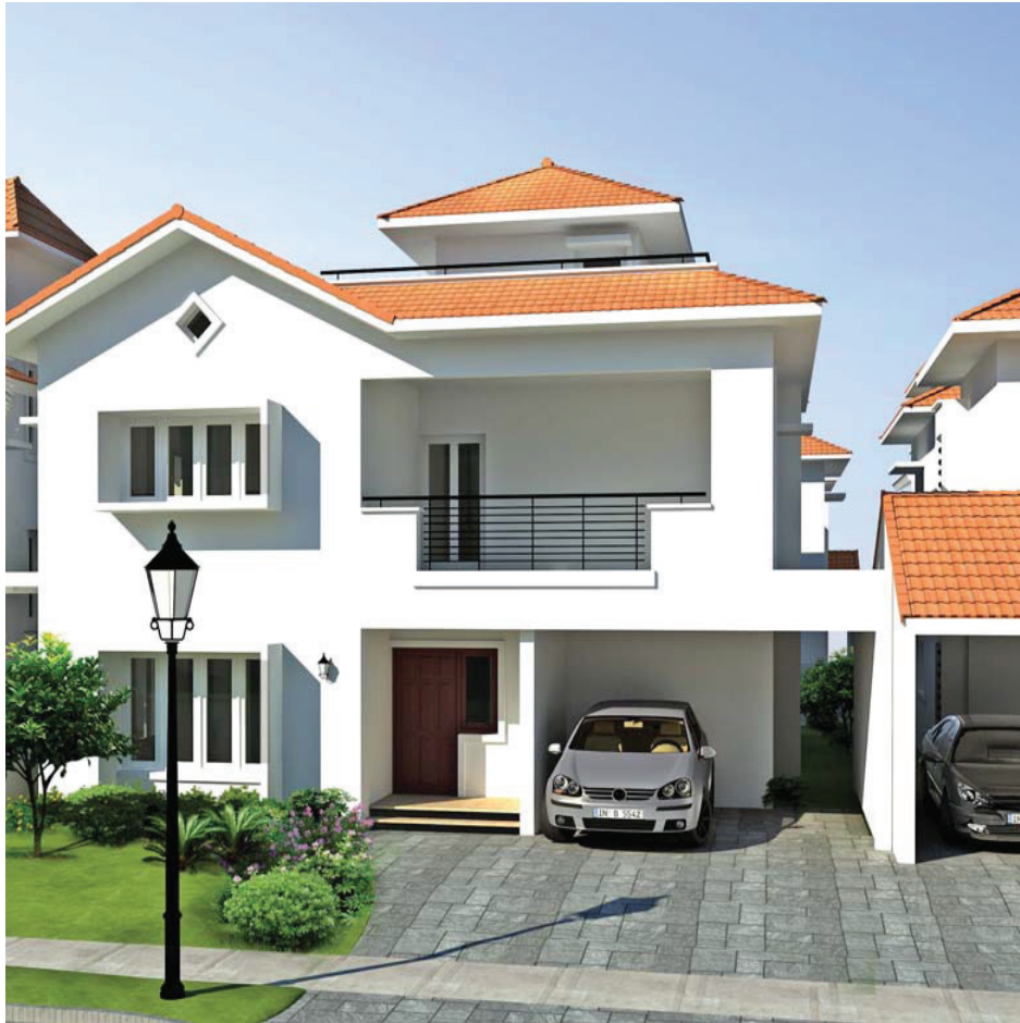
VILLA TYPE B-4