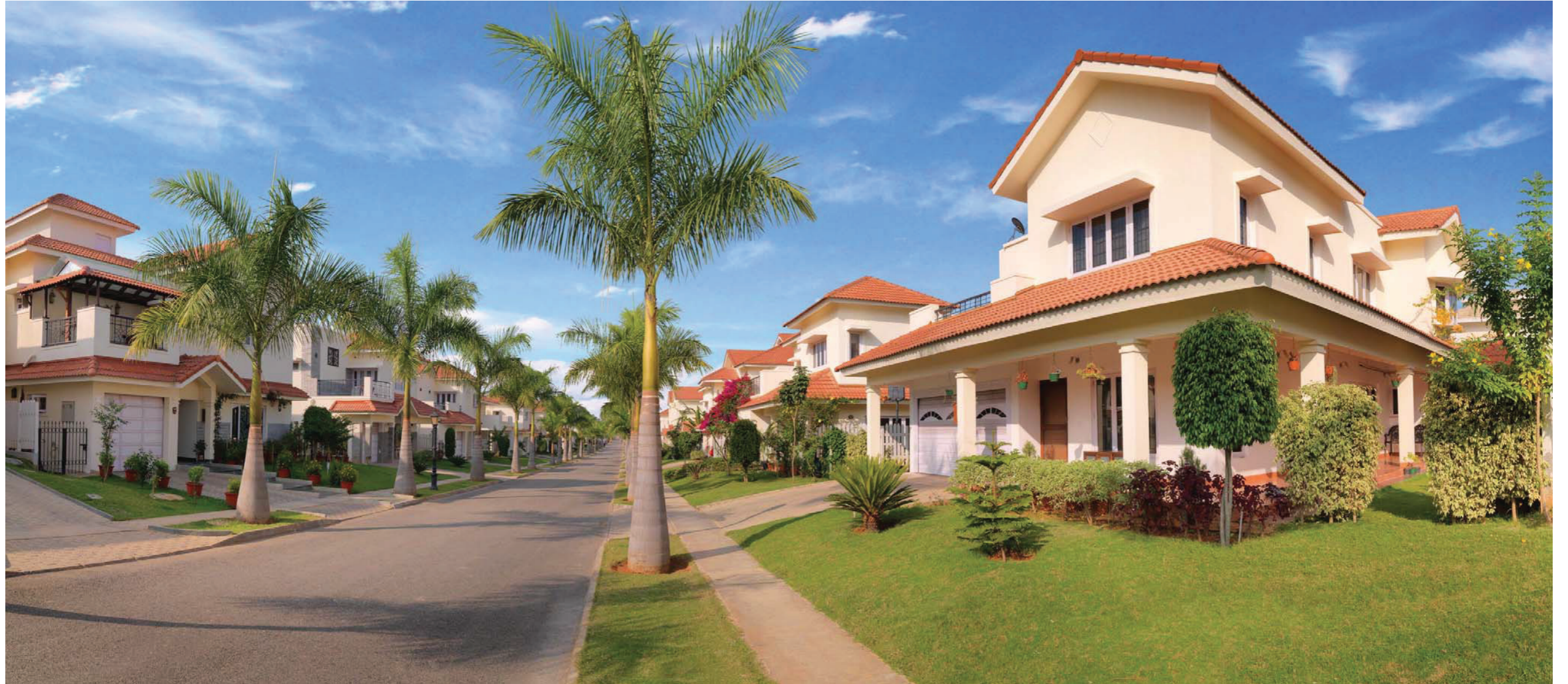
Palm lined walkways, lush green gardens, pollution free air. It's a neighbourhood you deserve to belong to.