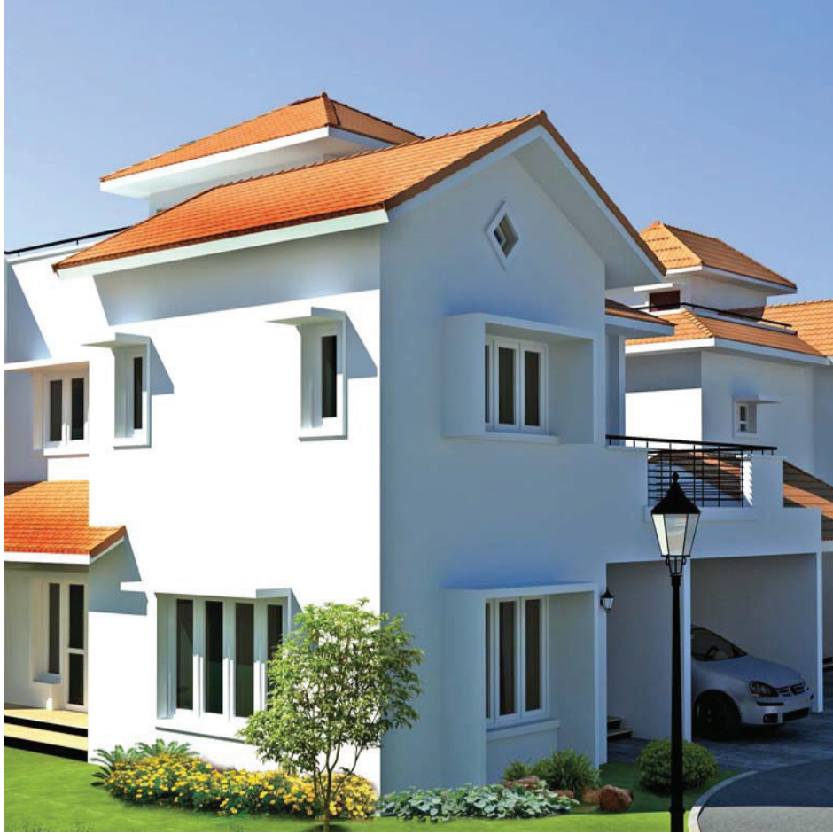
VILLA TYPE CD-2