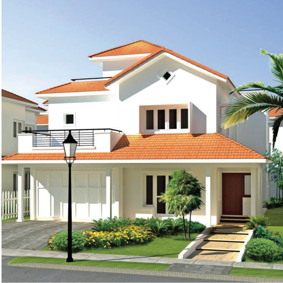
VILLA TYPE A-2