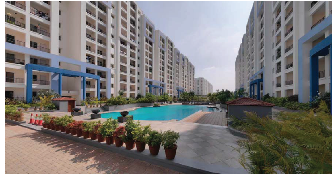
Adarsh Palm Retreat Gulmohar