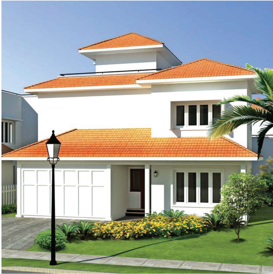
VILLA TYPE A-1