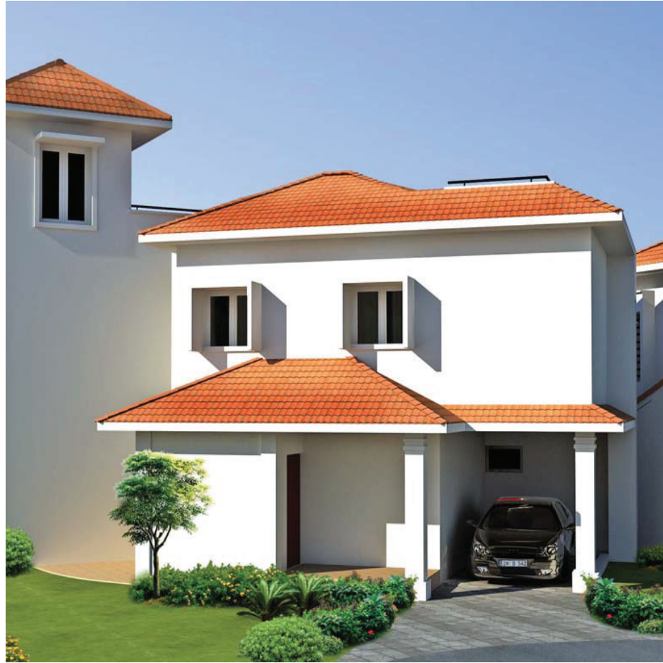
VILLA TYPE CD-3