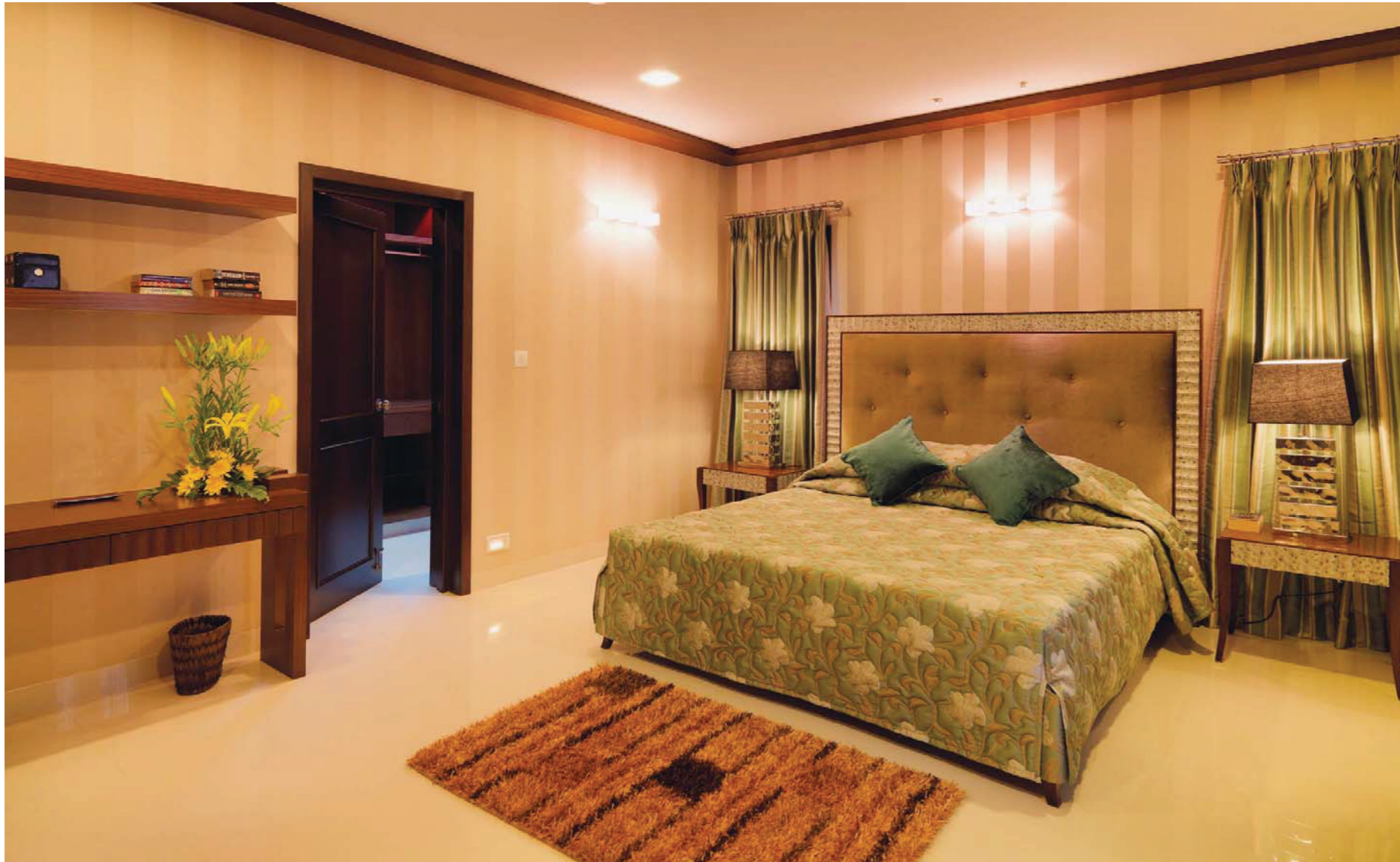
Airy and filled with light in the day. Comfy and cool at night. Yes, sometimes, the bedroom itself is a dream.

I t's the land of dreams that define the land of the waking. Inspire the right dream and you inspire life.