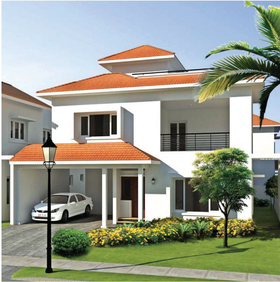
VILLA TYPE B-3