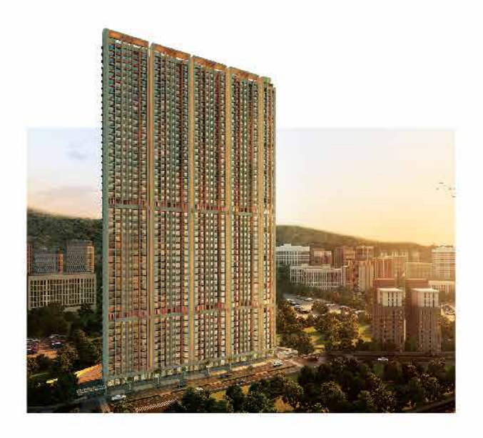
RAUNAK 108 1BHK Kasarvadavali, Thane (W)