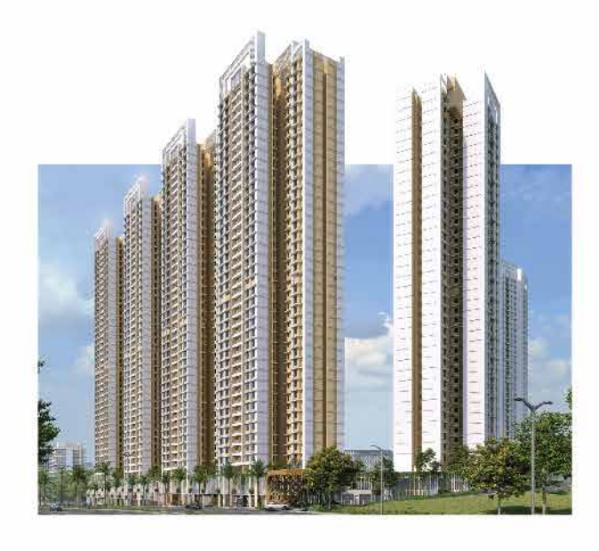
RAUNAK MAXIMUM CITY 1BHK, 2BHK Ghodbundar Road, Thane (W)