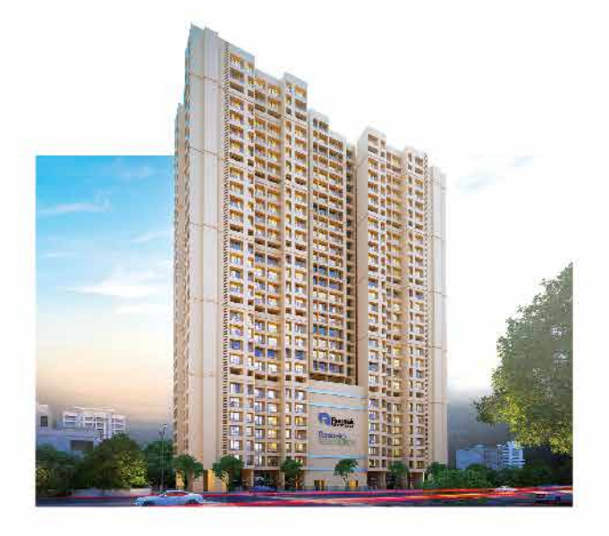
RAUNAK RESIDENCY 1BHK, 2BHK Pokharan Road No. 1, Thane (W)