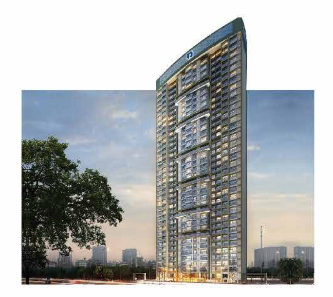
UNNATHI WOODS SUPREME 2BHK Luxury Apartment Ghodbundar Road, Thane (W)

RAUNAK CENTRUM 2BHK Off BKC Connector, Sion, Mumbai