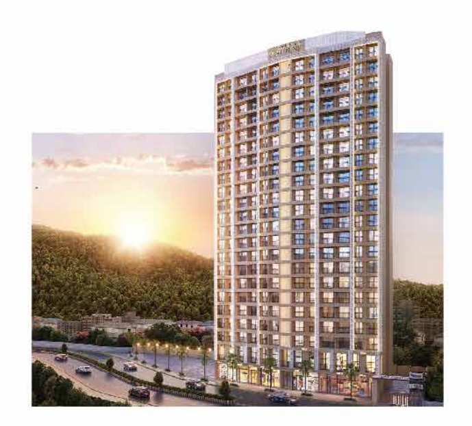
RAUNAK SERENE 1BHK, 2BHK Pokharan Road No. 1, Thane (W)