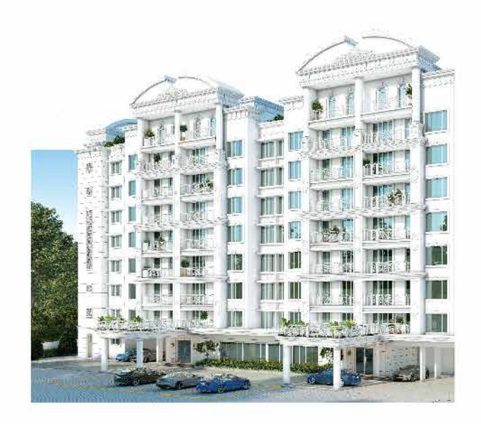
RAUNAK WHITE HOUSE 3 BHK, 4 BHK, 5 BHK Hiranandani Estate, Thane (W)

VIRAJ TOWER 4BHK, 5BHK Pokharan Road No. 2, Thane (W)