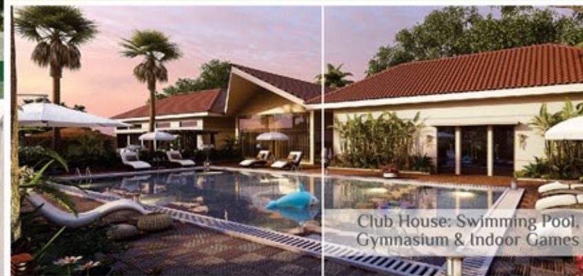
Club House: Swimming Pool, Gymnasium & Indoor Games