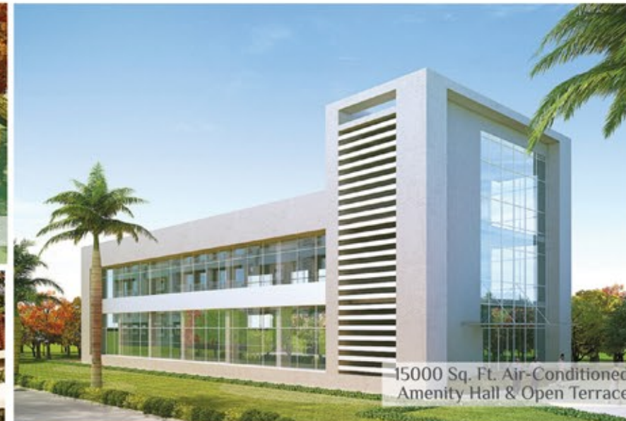
15000 Sq. Ft. Air-Conditioned Amenity Hall & Open Terrace