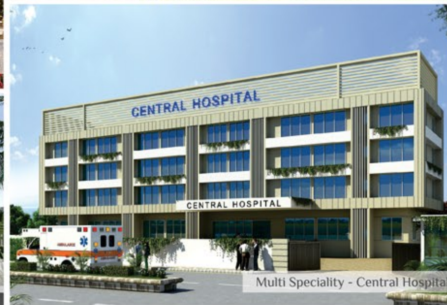
Multi Speciality - Central Hospital