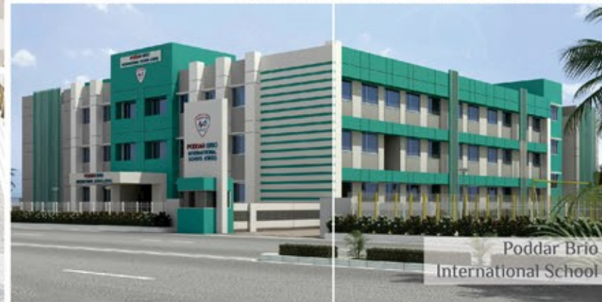
Poddar Brio International School