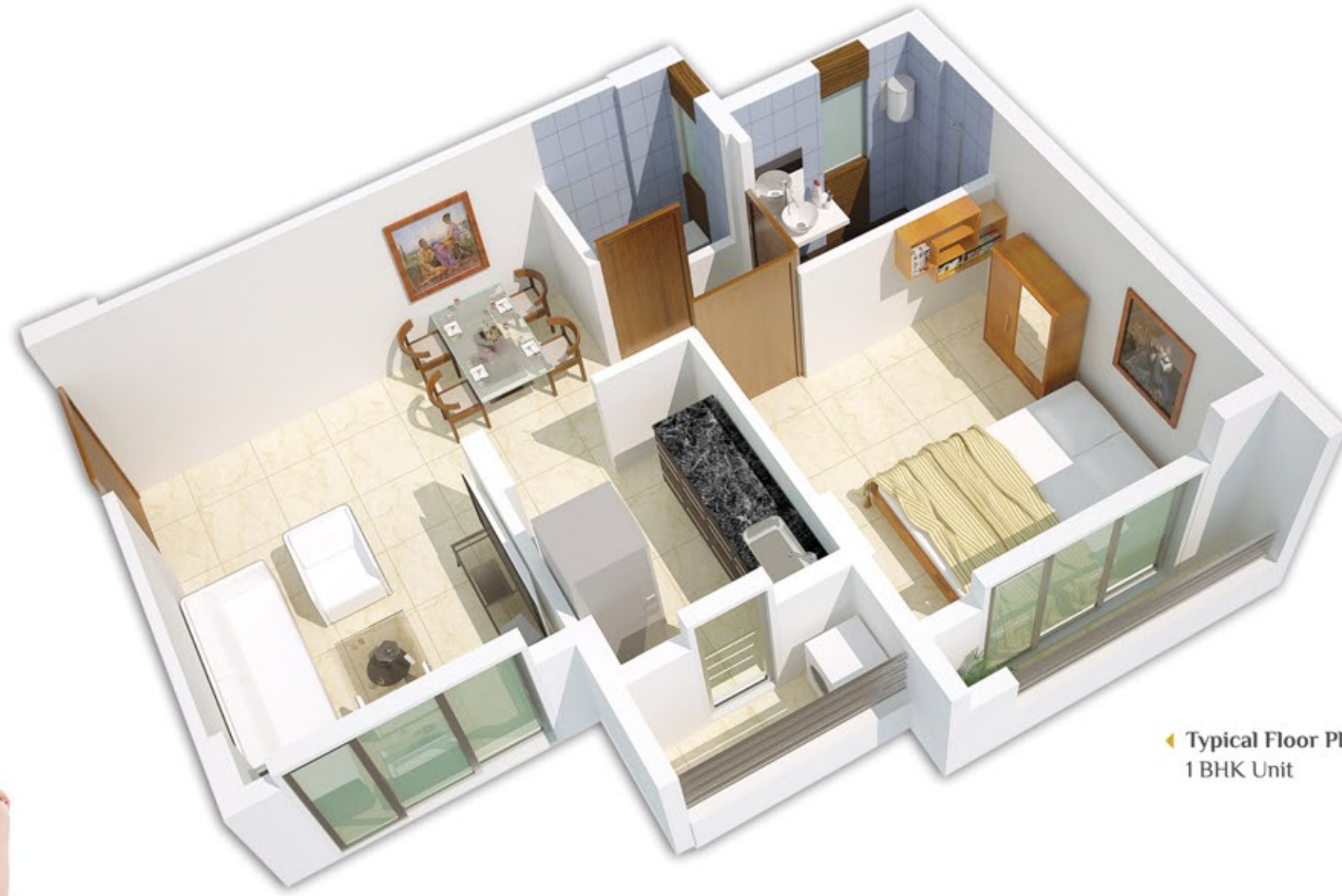
Typical Floor Plan 1 BHK Unit