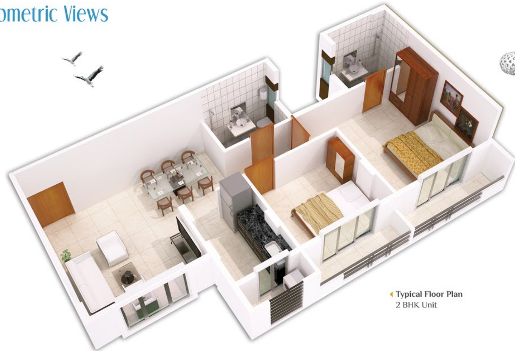
Typical Floor Plan 2 BHK Unit