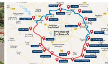
Regional Ring Road