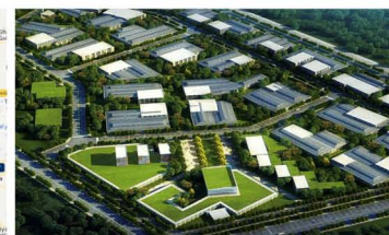
NIMZ National Investment and Manufacturing Zone 13,000 Acres.