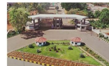
Mahindra Tractor Plant Zaheerabad