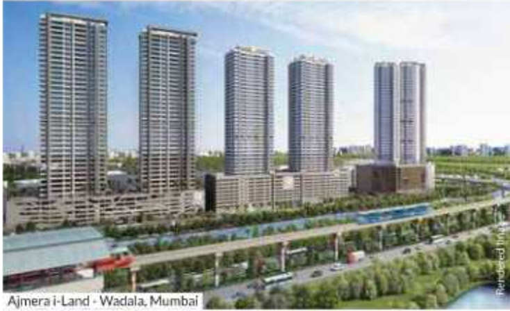
Ajmera i-Land - Wadala, Mumbai

Where the past iconic landmarks will be a testimony for the futuristic marvel.