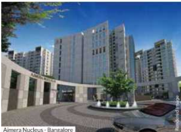
Ajmera Nucleus - Bangalore