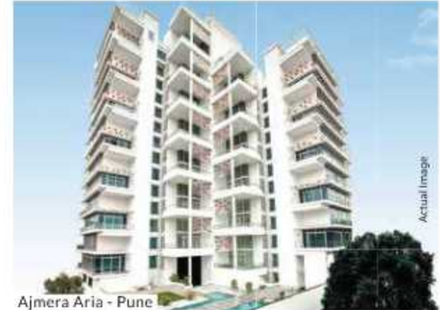
Ajmera Aria - Pune