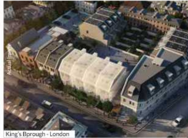
King's Brough - London