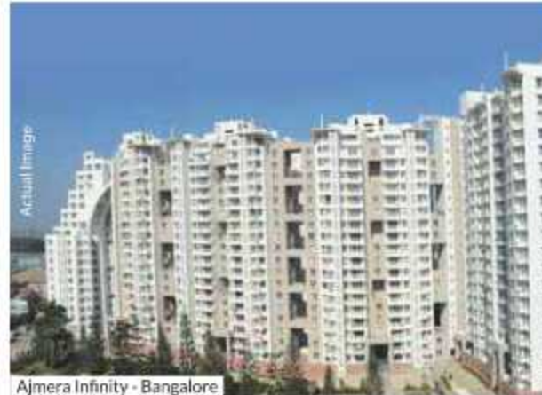
Ajmera Infinity - Bangalore