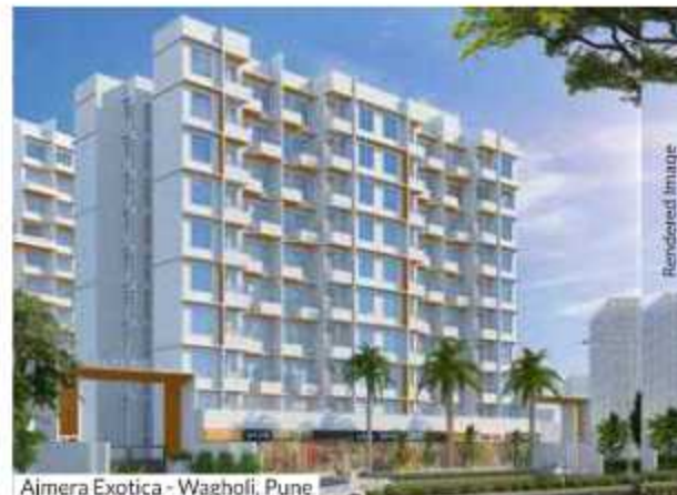
Ajmera Exotica - Wagholi, Pune