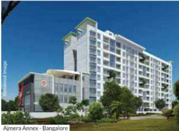
Ajmera Annex - Bangalore