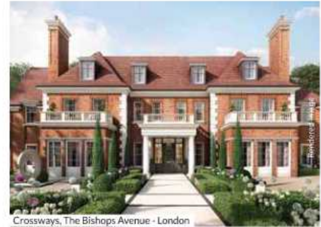
Crossways, The Bishops Avenue - London