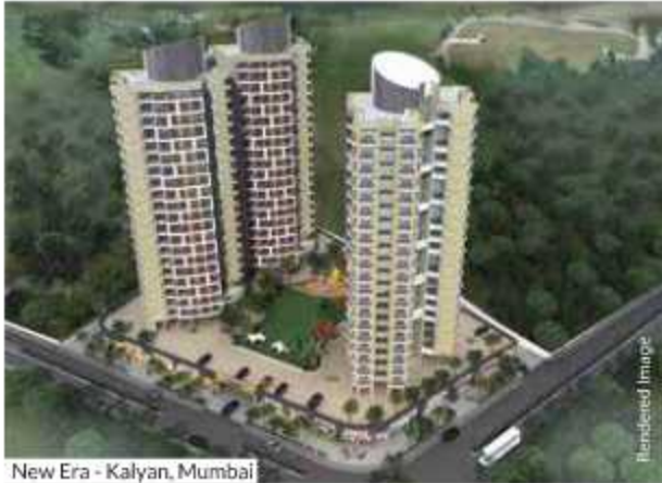
New Era - Kalyan, Mumbai