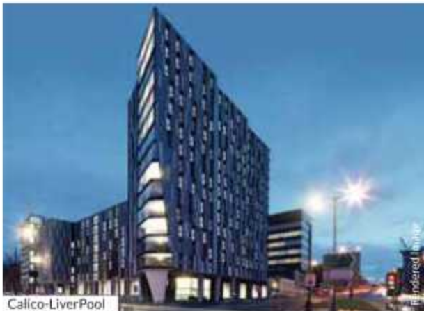
Calico - Liverpool