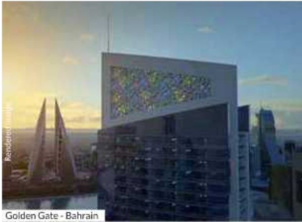
Golden Gate - Bahrain