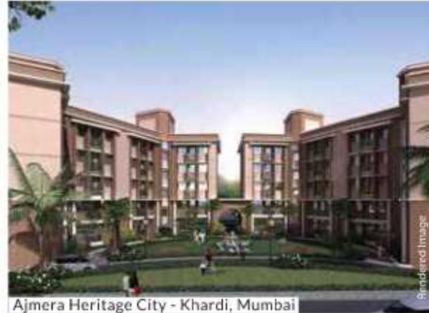
Ajmera Heritage City - Khardi, Mumbai