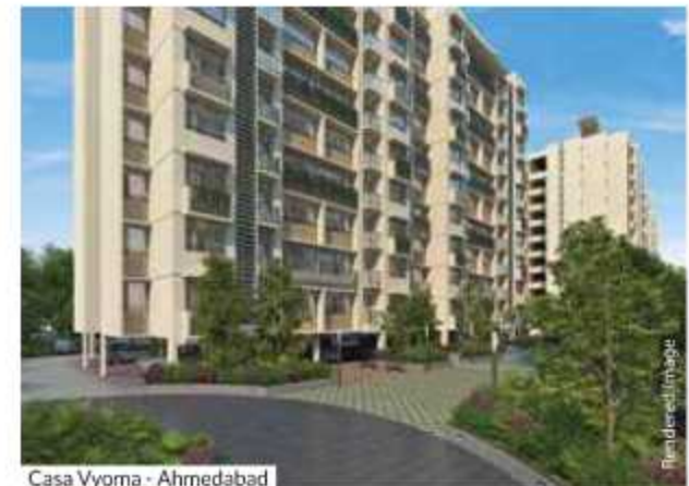
Casa Vyoma - Ahmedabad