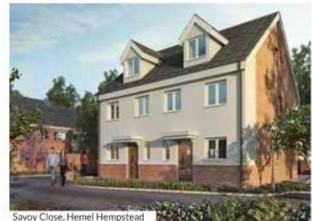
Savoy Close, Hemel Hempstead

MAHARERA No. : PRM KA RERA 1251/310 PR 181210 002207