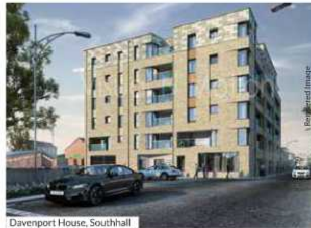
Davenport House, Southall