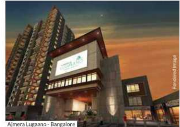
Ajmera Lugaano - Bangalore