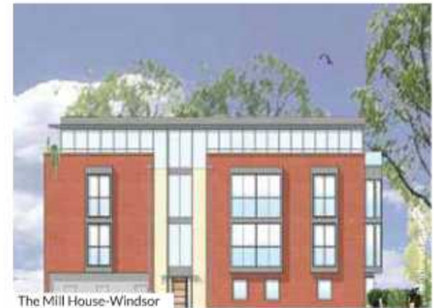
The Mill House - Windsor